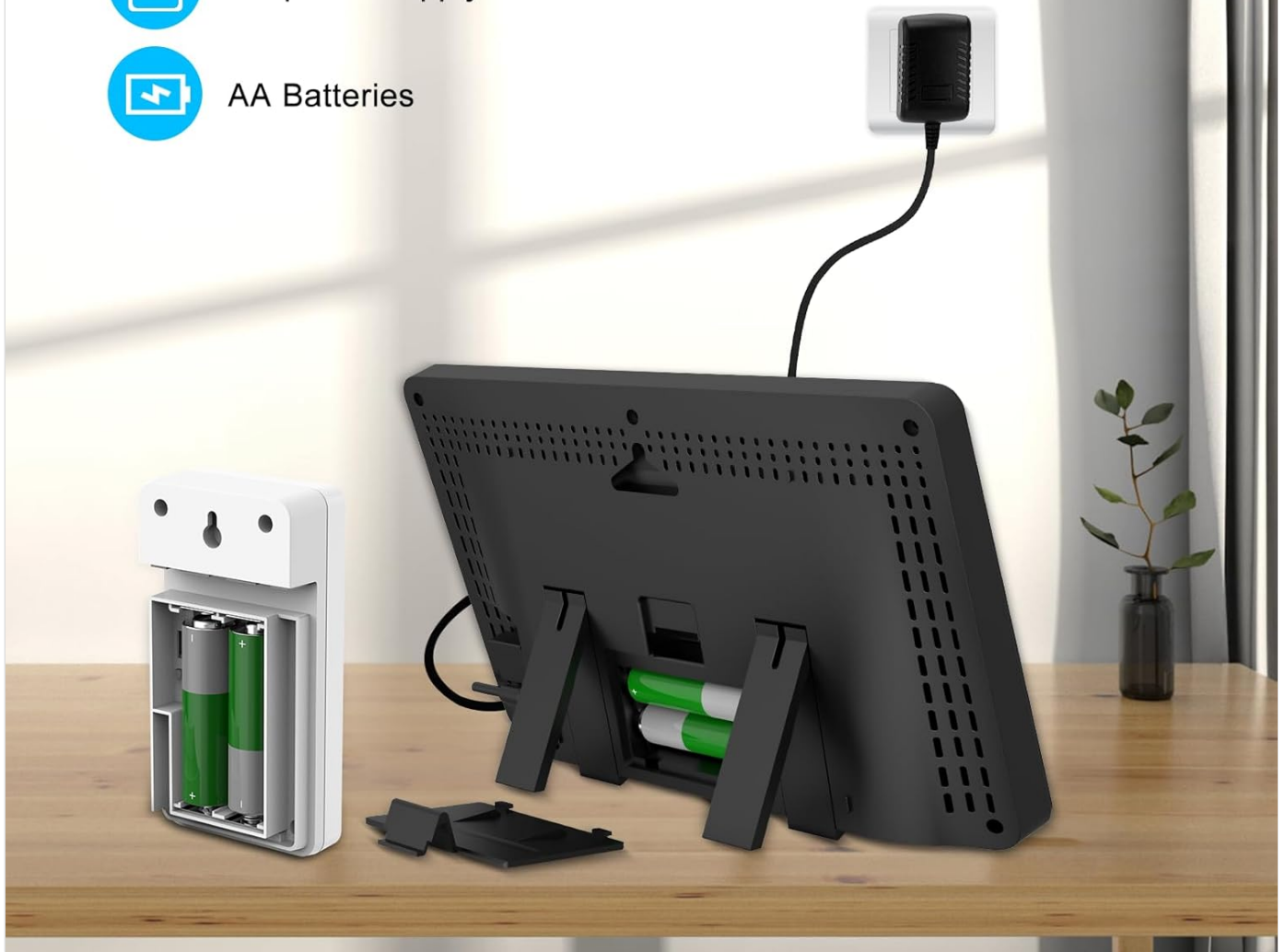
Image: Illustration of the three power supply methods for the main unit: USB, DC power supply socket, and AA batteries.