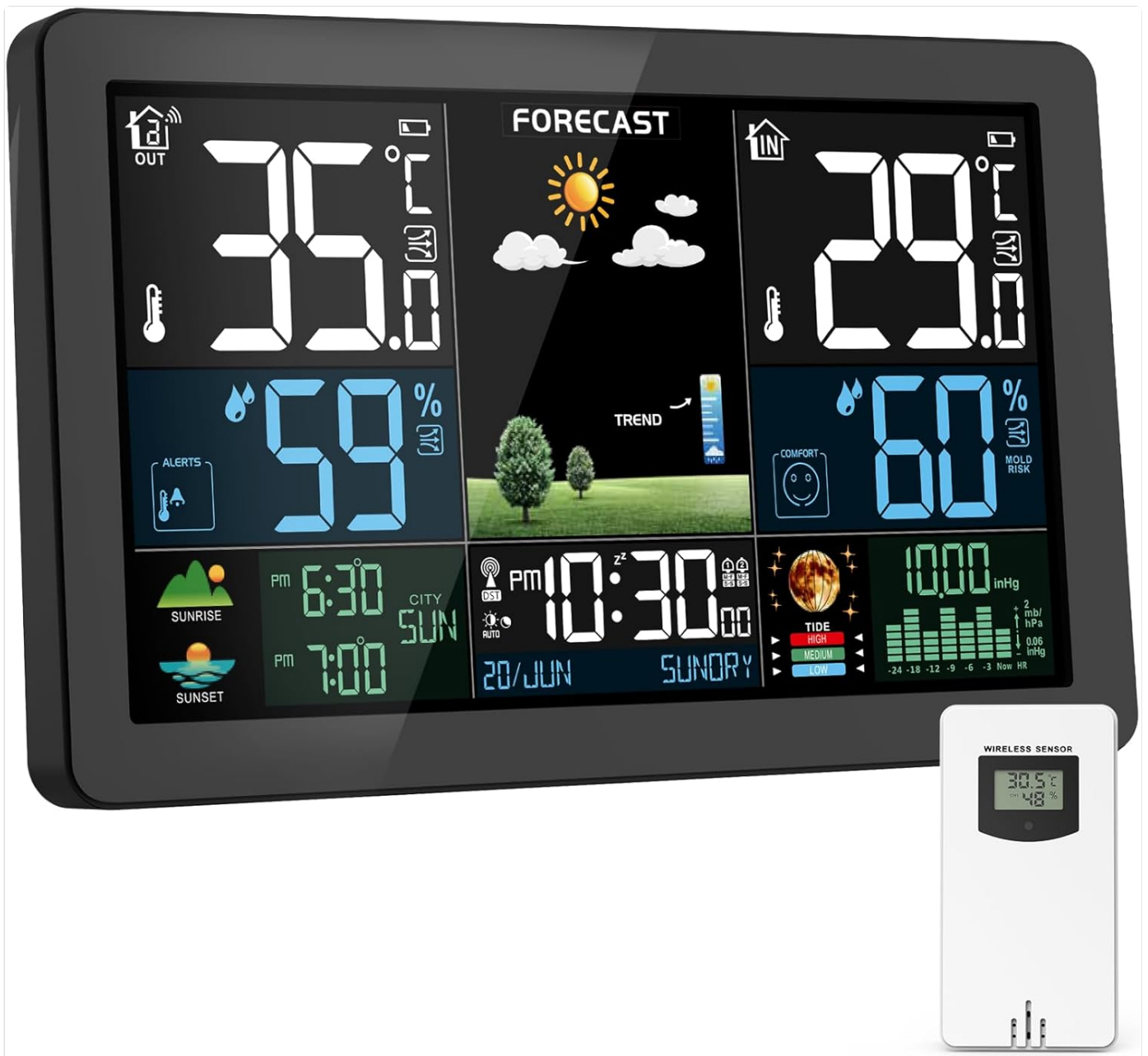
Image: The main display unit and its accompanying wireless sensor.