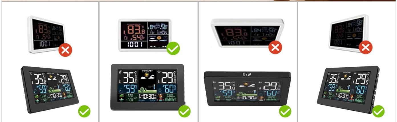
Image: Close-up of the 7.5" LCD HD Color Screen, highlighting its multi-angle view capability.