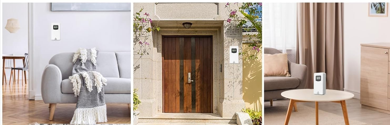
Image: Illustrates the capability of connecting up to three remote sensors for monitoring different locations.

Up to 60 meters effective transmission distance