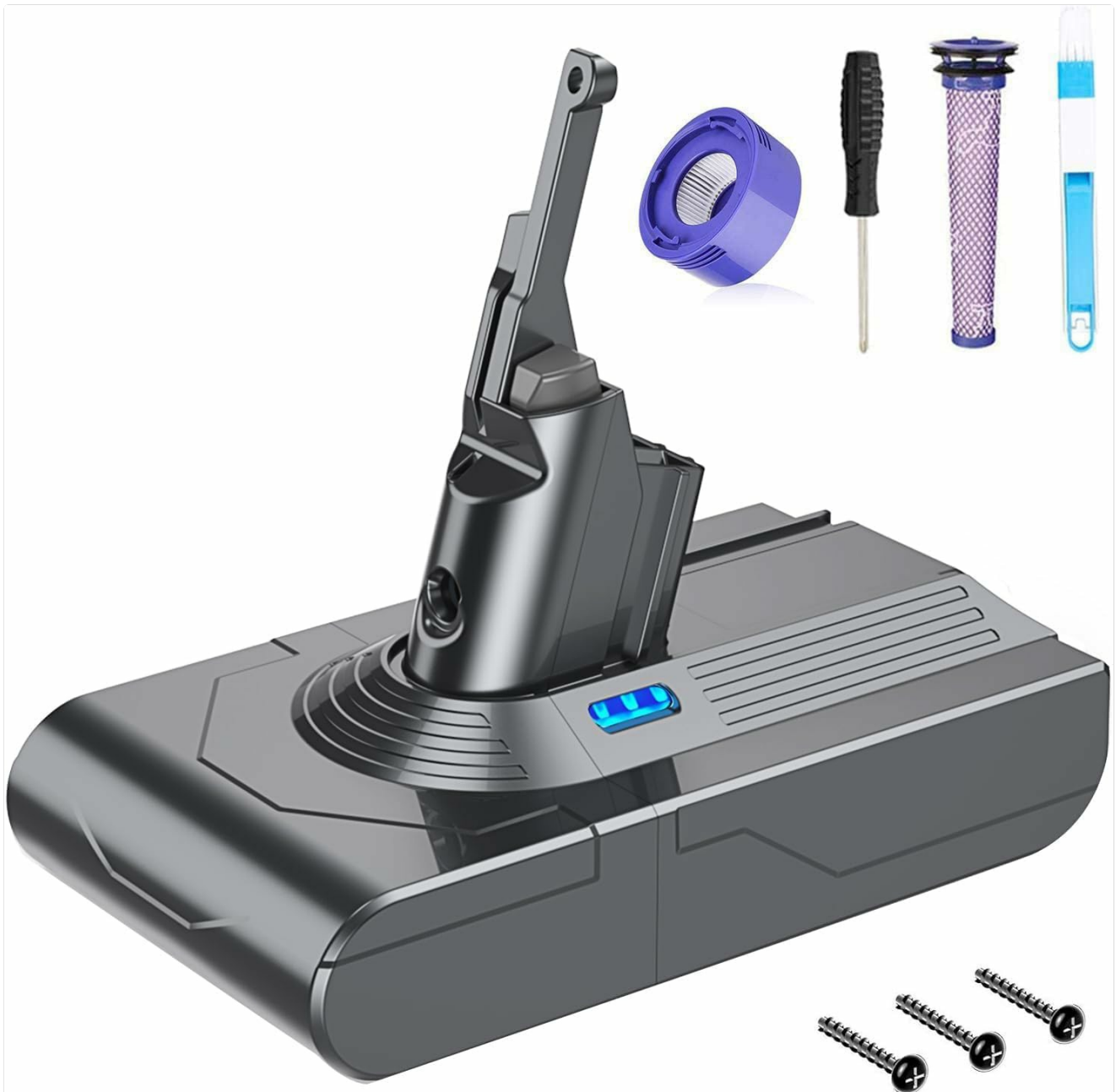
Image: FLYLINKTECH V8 6000mAh Replacement Battery. This image shows the replacement battery unit, highlighting its design and connection points.