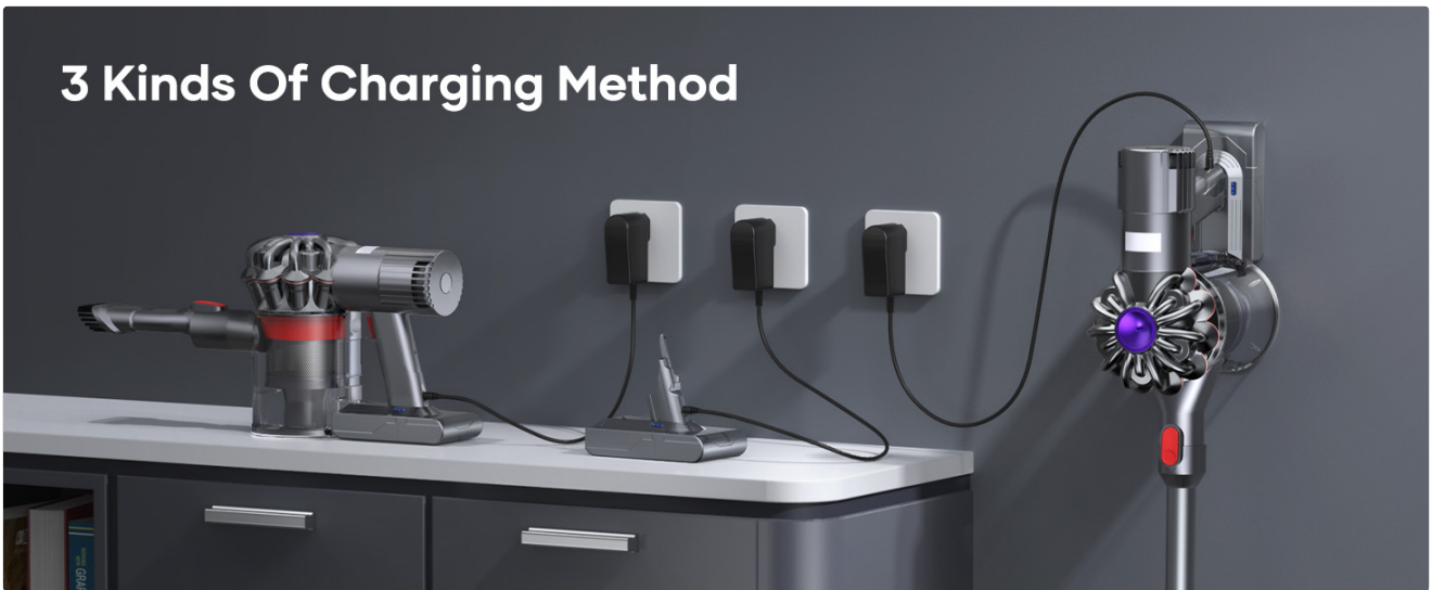
Image: Three charging methods for Dyson V8 battery. This image illustrates different ways to charge the battery: directly connected to the vacuum, using a separate charging dock, and with the vacuum mounted on a wall dock.