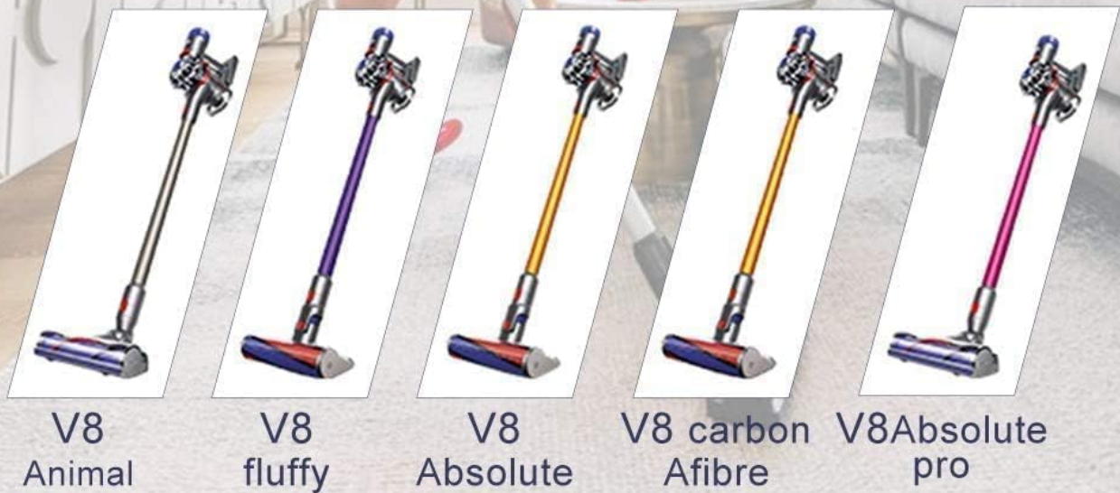
Image: Compatible Dyson V8 vacuum cleaner models. This image displays various Dyson V8 models such as Animal, Fluffy, Absolute, Carbon Fibre, and Absolute Pro, indicating the battery's broad compatibility.