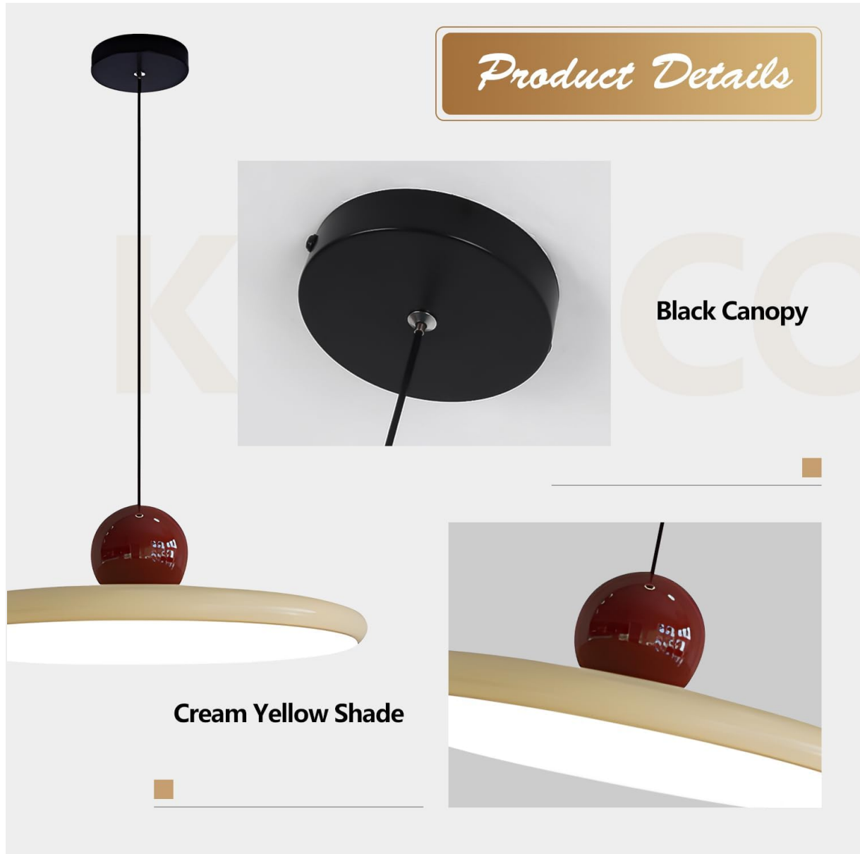
Figure 4: Detailed view of the black canopy and the cream yellow shade, highlighting the fixture's main components.