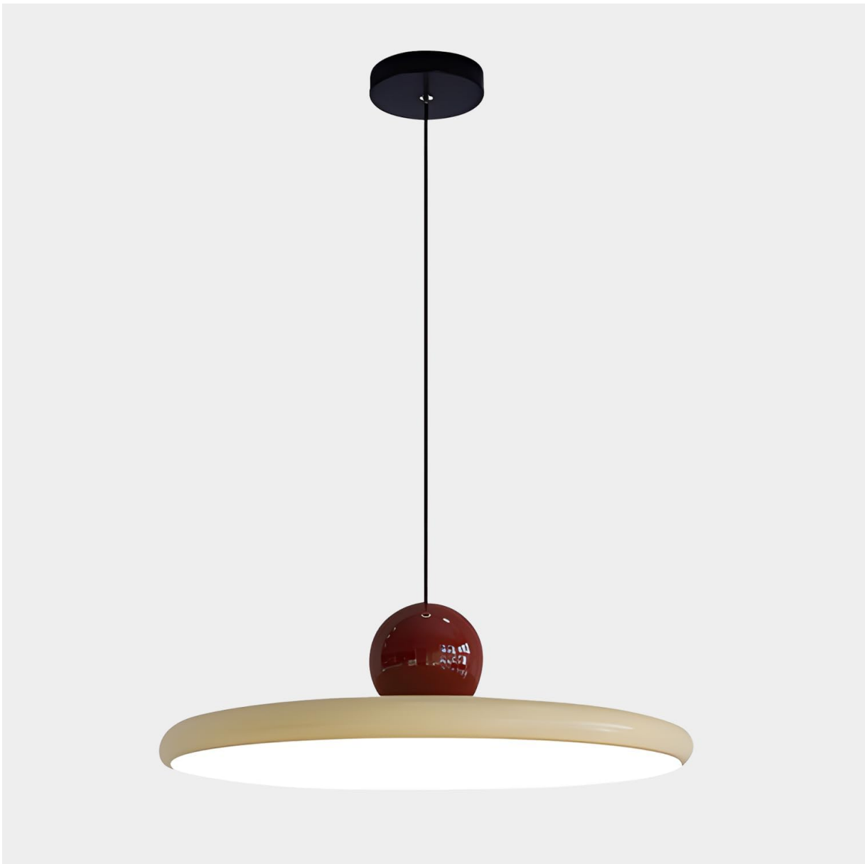
Figure 1: KCO Lighting Flat Round LED Pendant Light, Yellow.