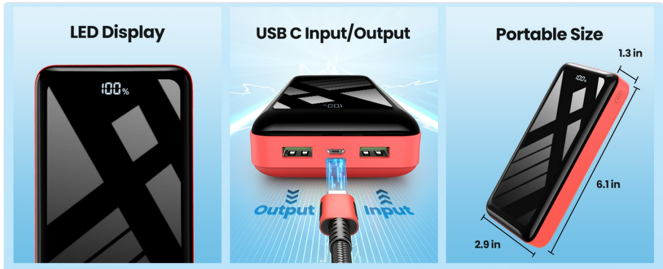
Image 5.1: Power Bank Charging Ports and Display. This image highlights the LED digital display, the USB-C input/output port, and the overall portable size of the power bank.

Note: You can also use a Micro USB cable to charge the power bank via the Micro USB input port.