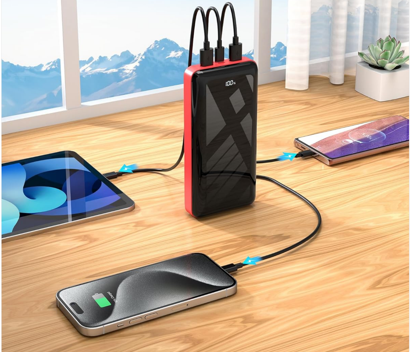
Image 6.1: Charging Multiple Devices. This image demonstrates the power bank's ability to charge three devices concurrently using its USB-A and USB-C output ports.