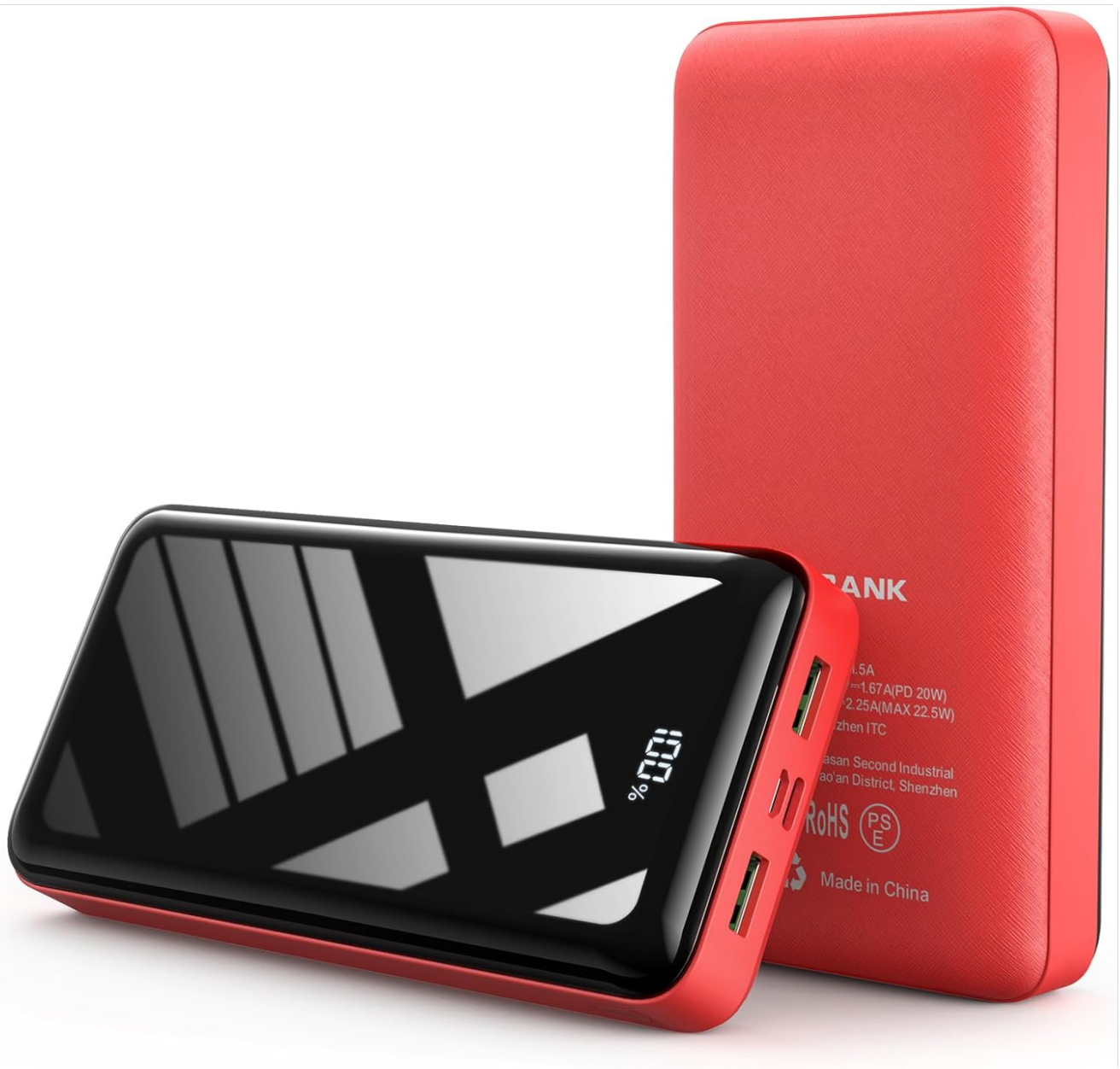
Image 1.1: LOOPEAK 50000mAh Portable Power Bank. This image shows the red-colored power bank with its digital display indicating a full charge, highlighting its compact design.