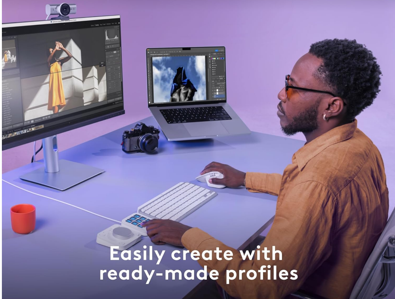
Image: A user engaged in creative work on a dual-monitor setup, utilizing the Logitech MX Creative Console to master their workflow with ready-made profiles.