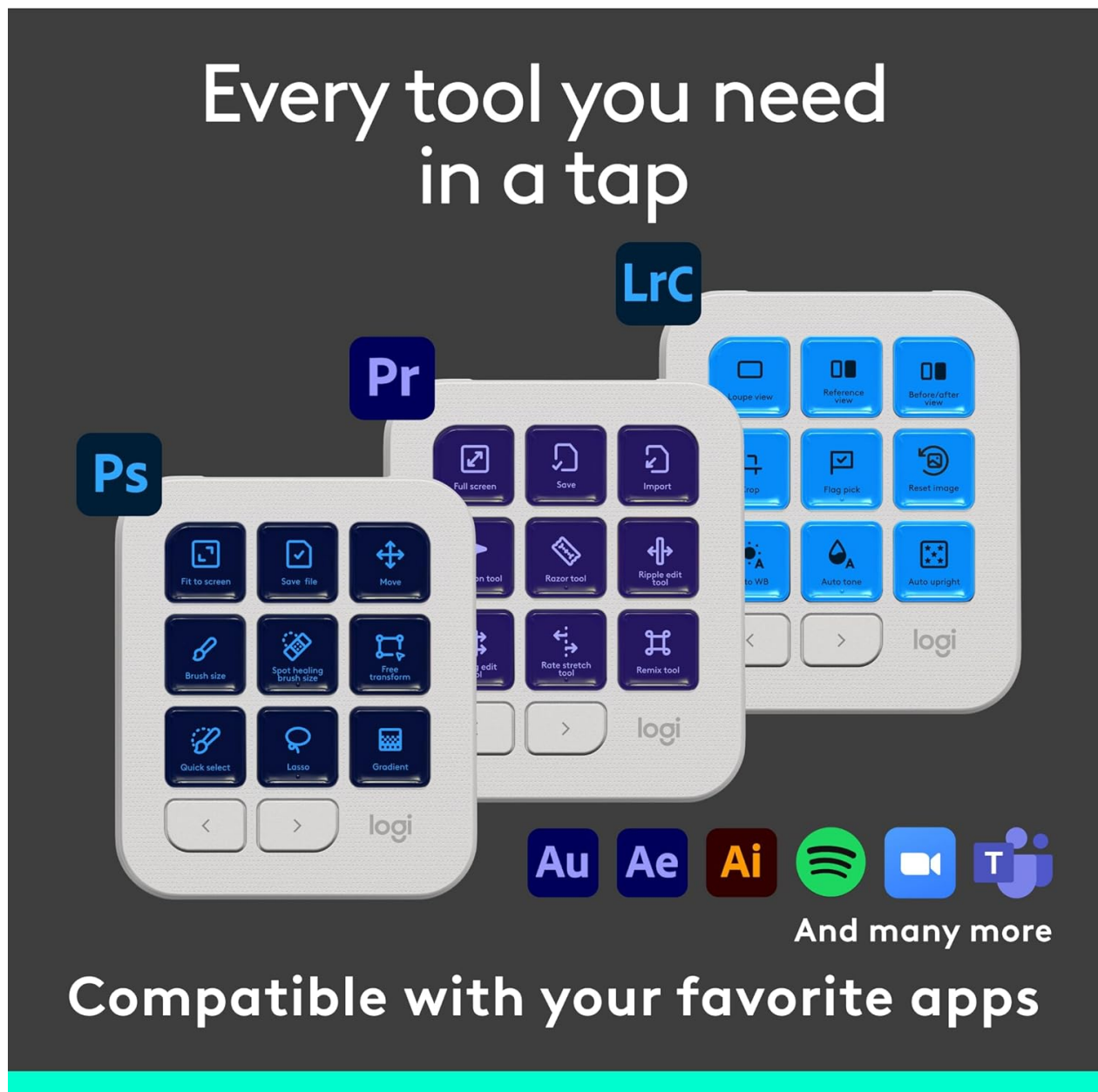
Image: The keypad displaying icons for various compatible applications such as Photoshop, Premiere Pro, Lightroom, Illustrator, Audition, After Effects, Spotify, Zoom, and Teams.