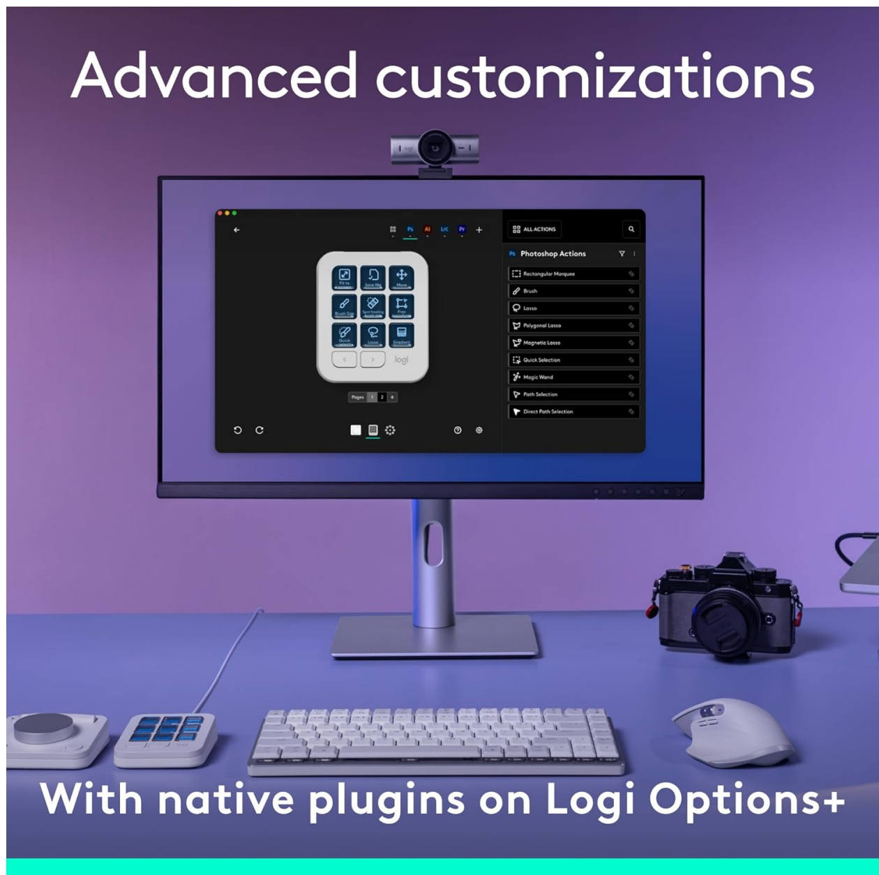
Image: The Logi Options+ software interface on a monitor, displaying advanced customization options and plugins for Adobe Photoshop, with the MX Creative Console visible on the desk.

Logi Options+ provides recommended profile configurations for these applications, allowing you to get started quickly. The console can automatically switch profiles based on the active application.