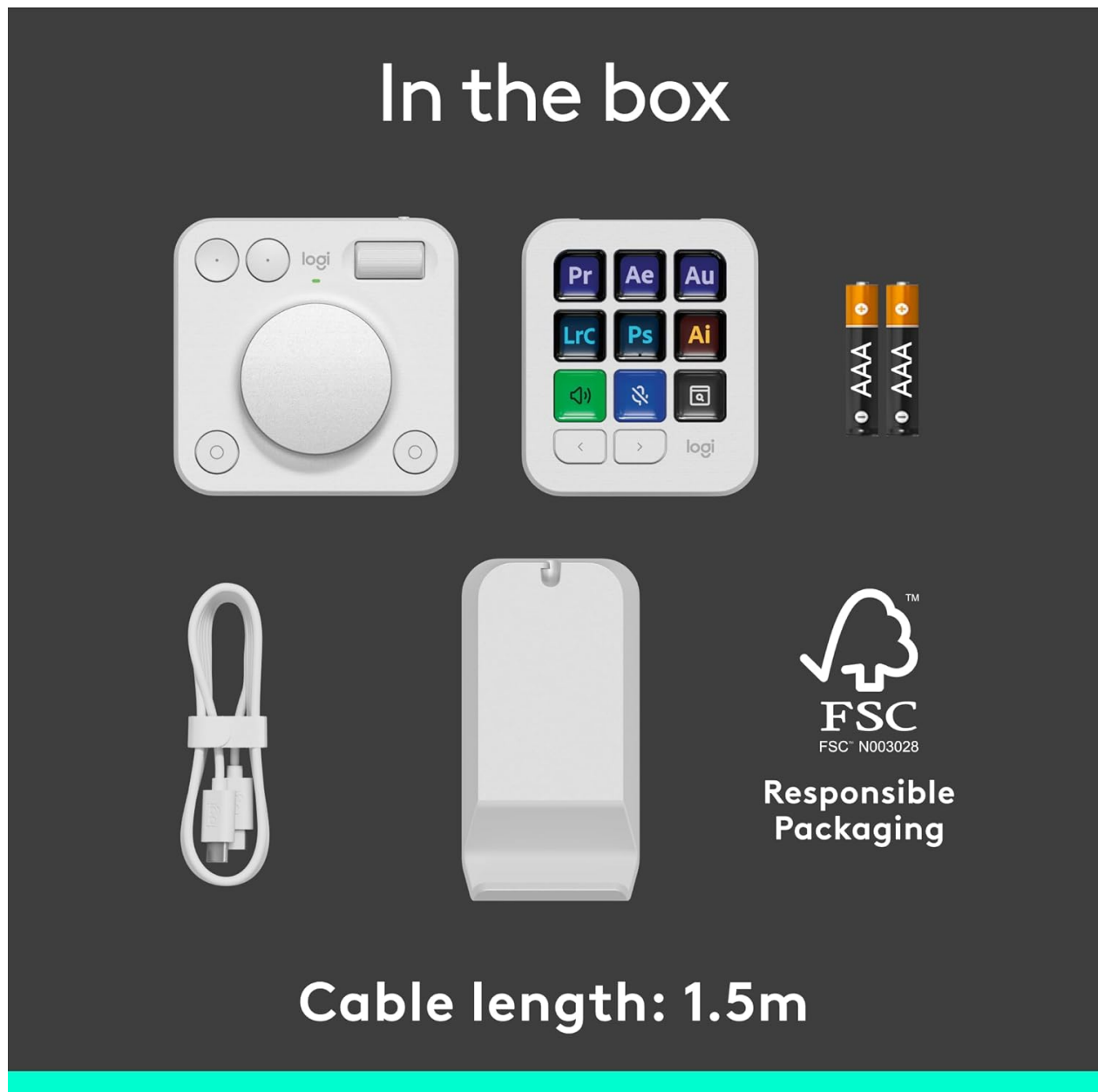
Image: All components included in the box: the keypad, dialpad, USB-C cable, and two AAA batteries.