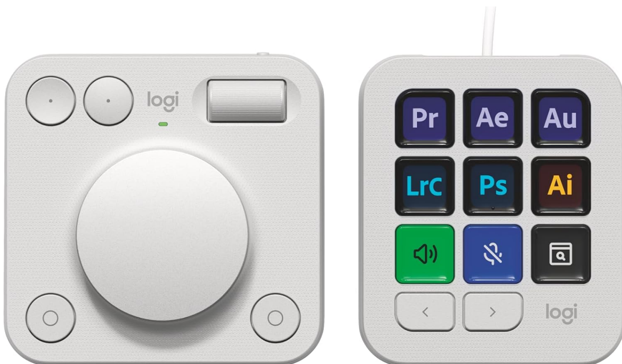
Image: The Logitech MX Creative Console, featuring the customizable keypad on the right and the control dial on the left.

This manual provides comprehensive instructions for setting up, operating, maintaining, and troubleshooting your MX Creative Console to ensure optimal performance and user experience.