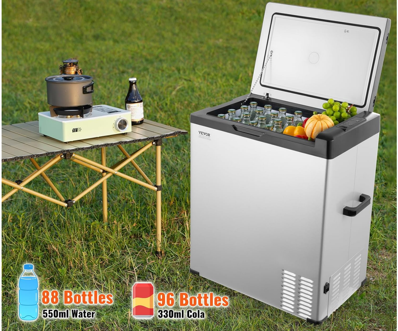
Image: The VEVOR C75 portable refrigerator freezer displayed in an outdoor setting, highlighting its large 70L/74QT capacity, capable of holding numerous bottles of water or cans of cola.