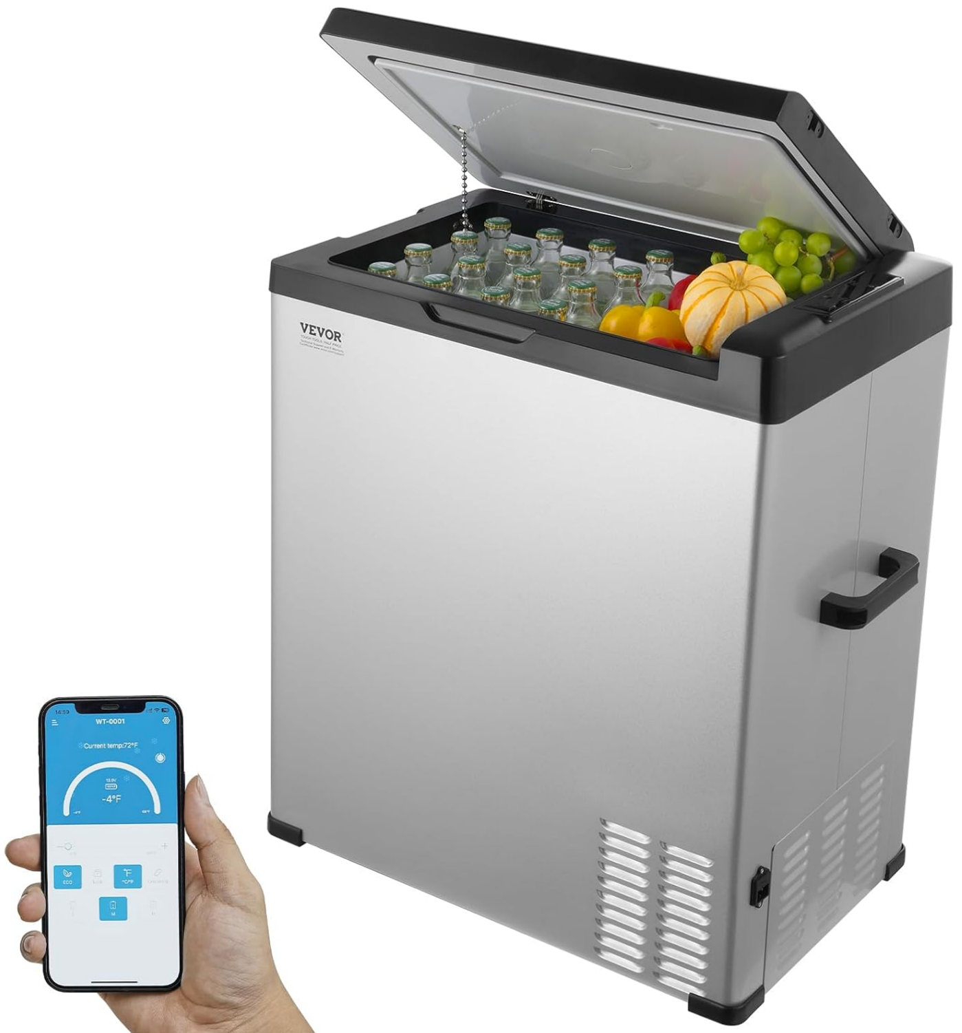
Image: The VEVOR C75 portable refrigerator freezer, showcasing its interior capacity filled with various items like bottles and fruits. A smartphone displaying the control app is also visible, highlighting its smart features.