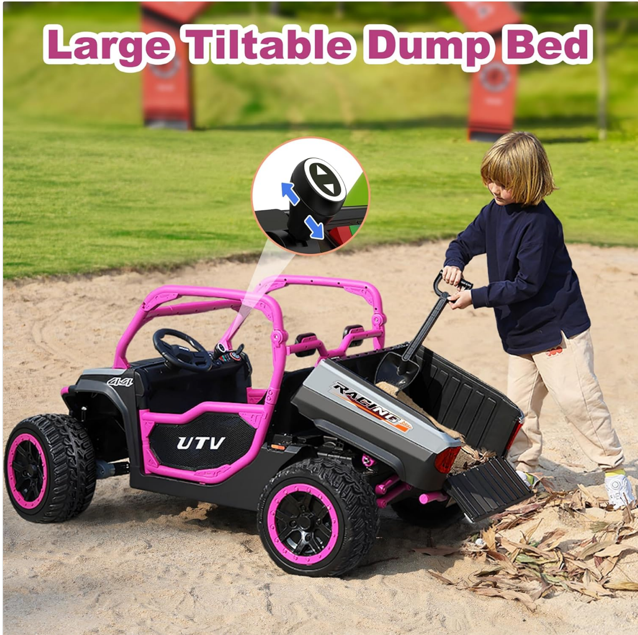
Image 5.3: A child using the included shovel to load material into the large, tiltable dump bed of the ride-on truck, demonstrating the joystick control for tilting.