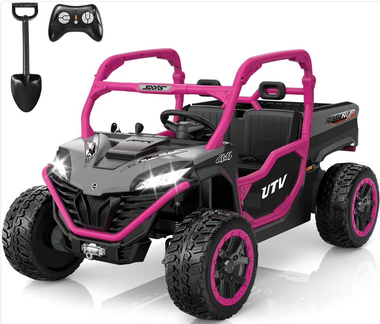
Image 3.1: Fully assembled ANPABO 24V 2 Seater Ride On Dump Truck in Rose Red, showcasing its robust design, large wheels, and included shovel and remote control.