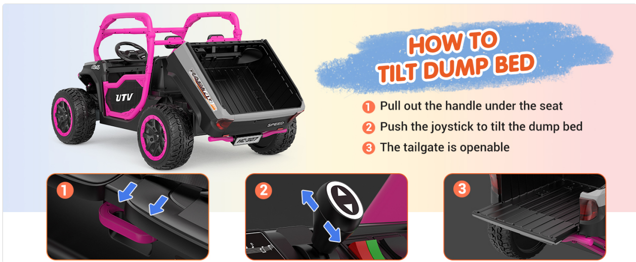
Image 5.4: Visual instructions detailing how to operate the electric dump bed: 1. Pull out the handle under the seat. 2. Push the joystick to tilt the dump bed. 3. The tailgate is openable.