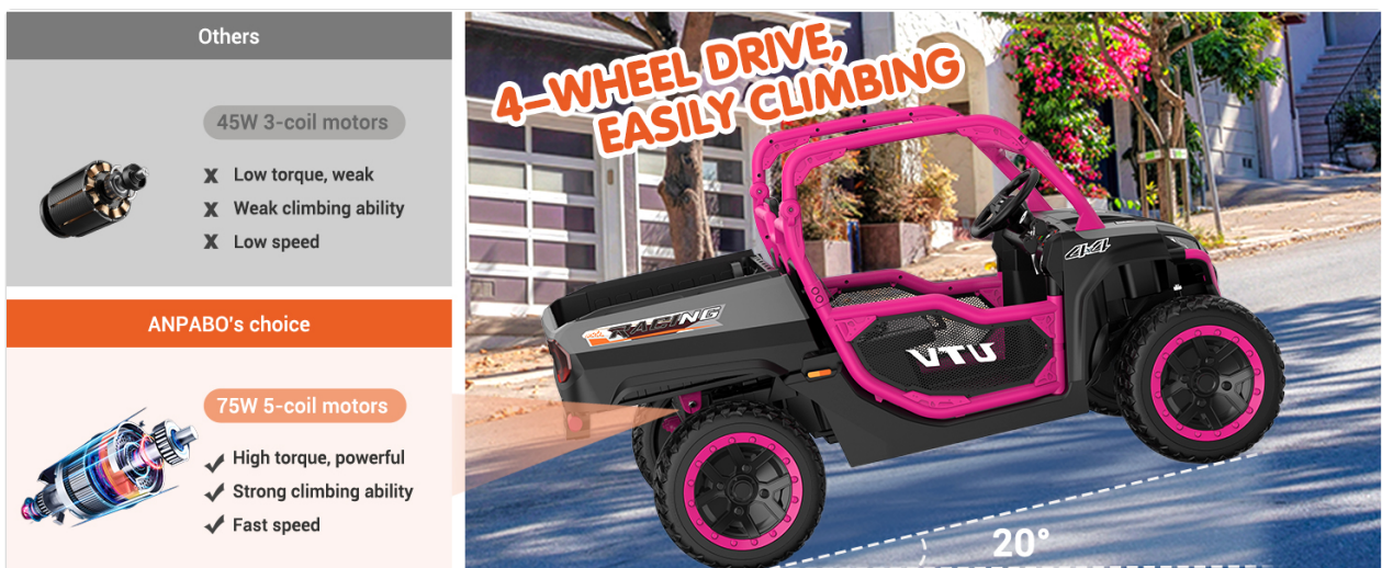
Image 5.2: Illustration of the vehicle's 4-wheel drive system, demonstrating its ability to climb inclines up to 20 degrees, powered by 75W 5-coil motors for high torque and strong climbing ability.