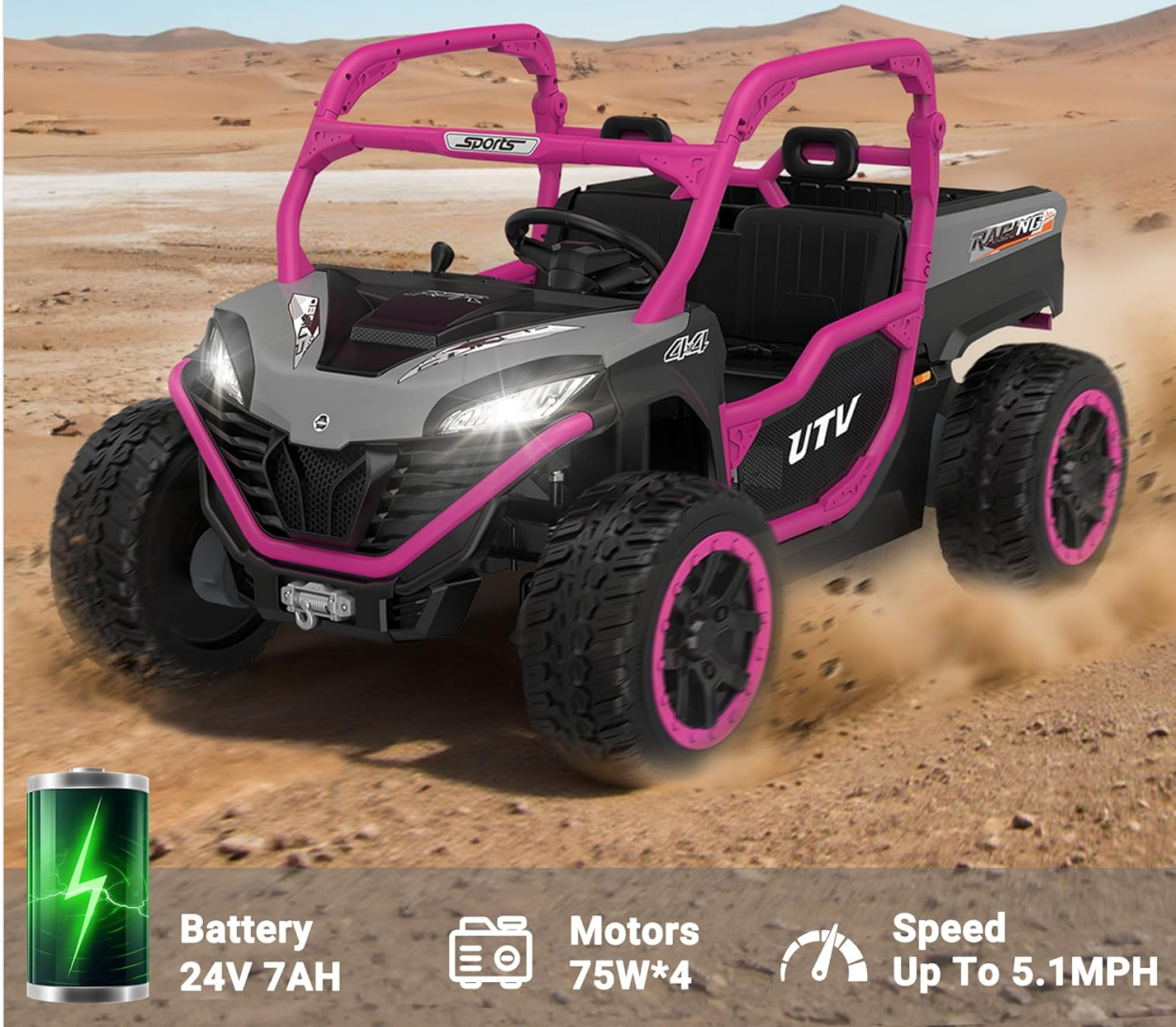
Image 5.1: The ANPABO 24V Ride On Dump Truck in an off-road setting, highlighting its 24V 7Ah battery, 4x75W motors, and speed up to 5.1 MPH, suitable for various terrains.