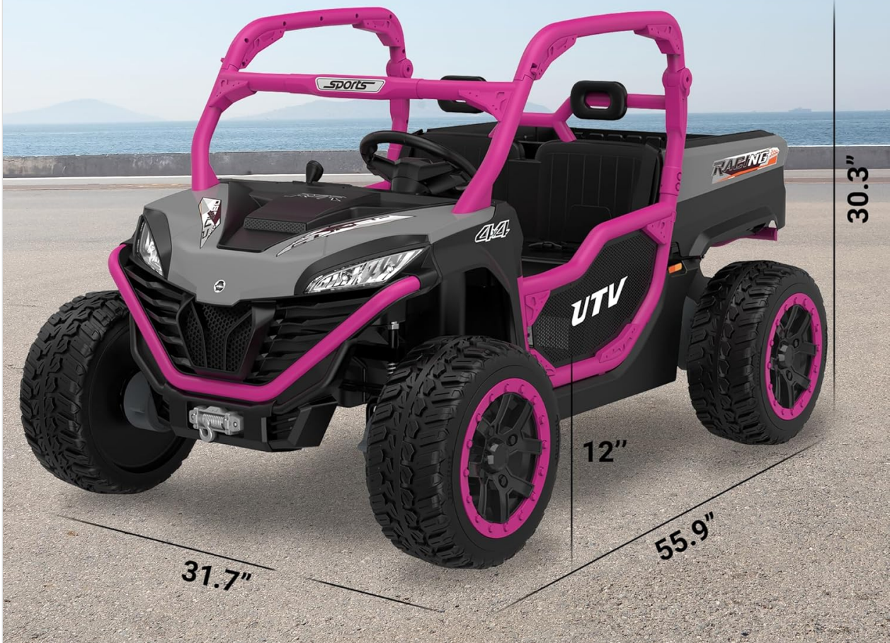
Image 9.1: Visual representation of the ANPABO Ride On Truck's dimensions (55.9" L x 31.7" W x 30.3" H) and recommended usage: one child aged 3-8 years, two toddlers aged 2-4 years, with a maximum load of 110 lbs.