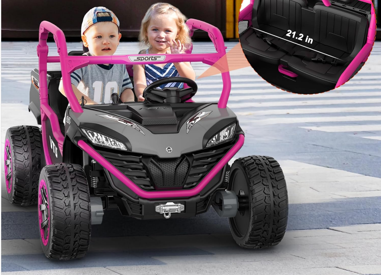
Image 9.2: Two children seated comfortably in the ANPABO 2-seater ride on truck, highlighting the 21.2-inch wide seating area designed for shared play.