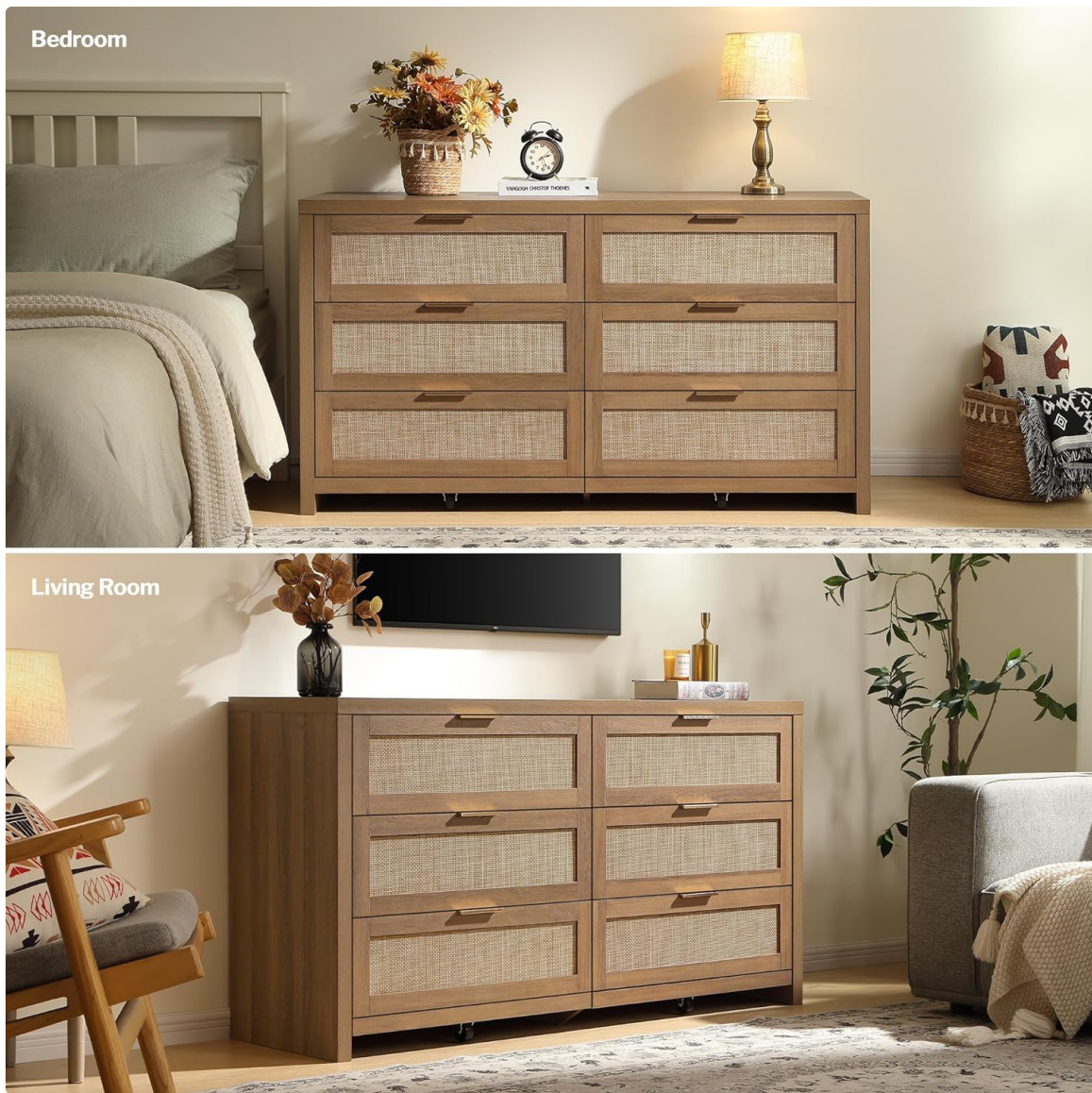
Figure 4: The dresser seamlessly integrates into both bedroom and living room environments.