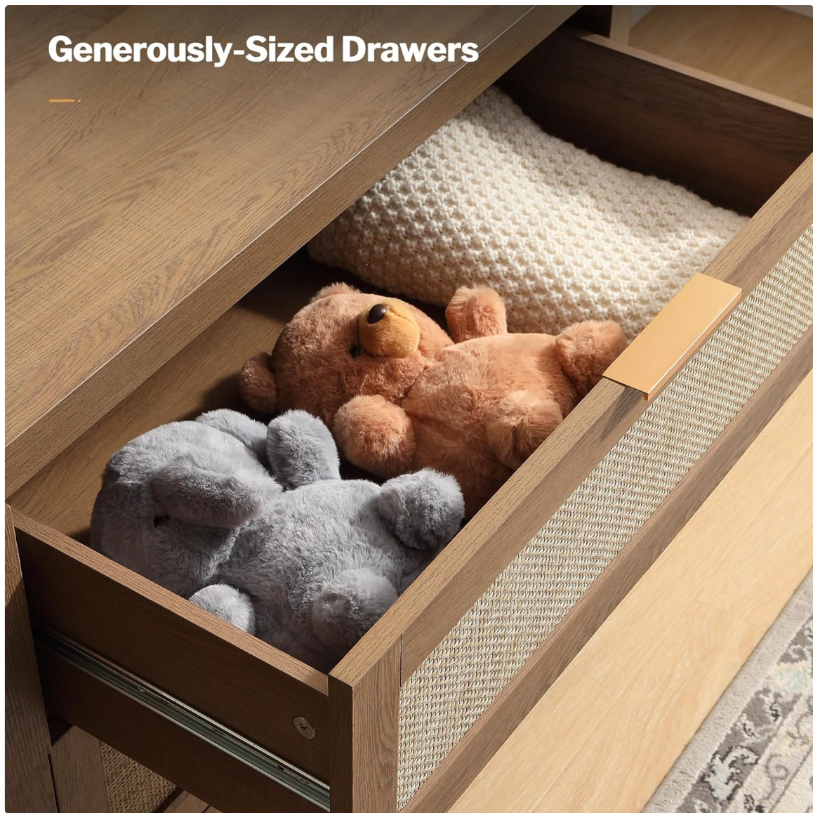
Figure 3: View of a generously-sized drawer, demonstrating ample storage capacity.