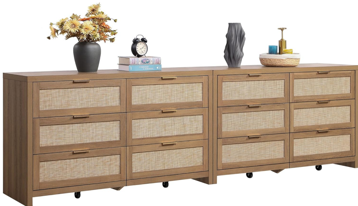
Figure 1: Overall view of the SICOTAS DR006 Rattan 6-Drawer Dresser.