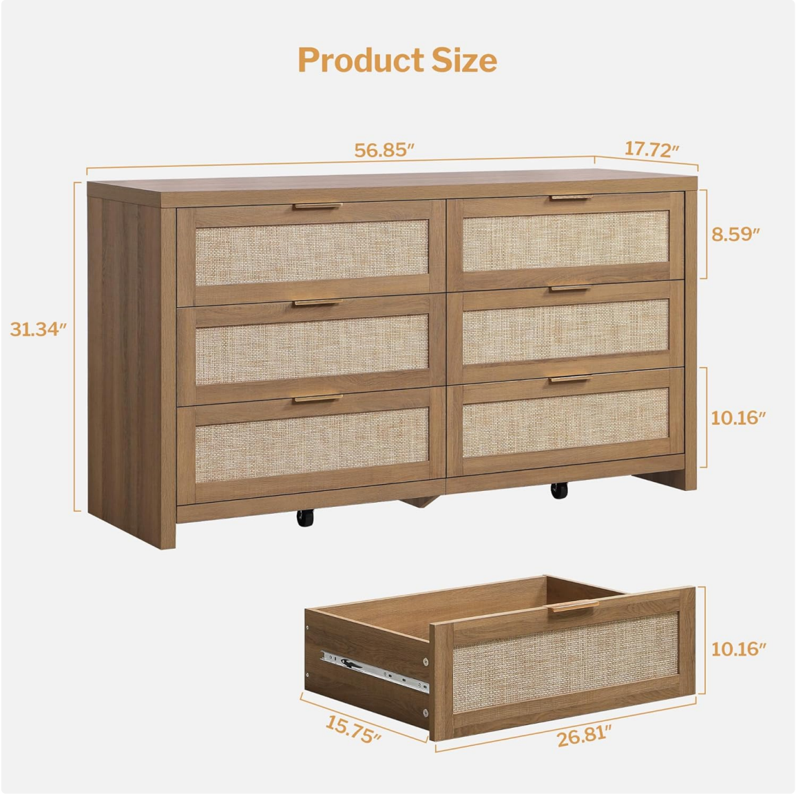
Figure 5: Product dimensions for the SICOTAS DR006 Dresser.

If the dresser feels unstable, re-check all assembly connections. Ensure the anti-tip fasteners are securely attached to the back of the dresser and to the wall, with screws tightened at the recommended 45-degree angle. Confirm the dresser is placed on a level surface.