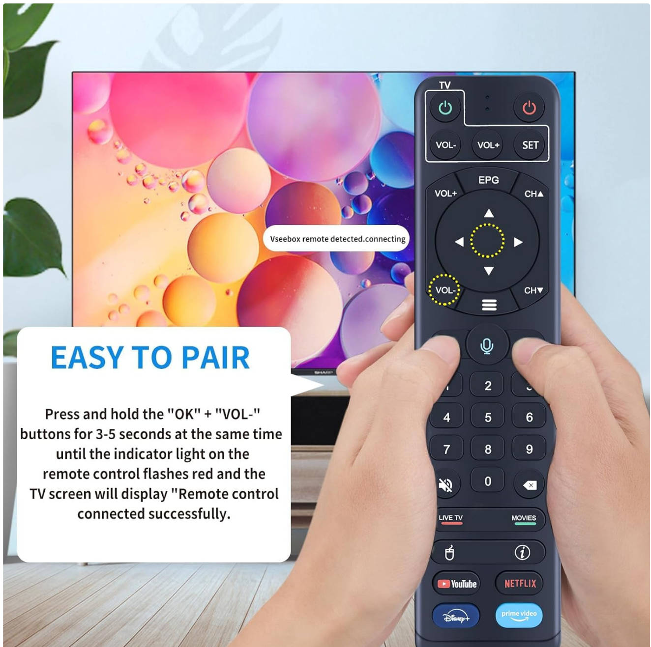
Figure 6: Easy Pairing Procedure.