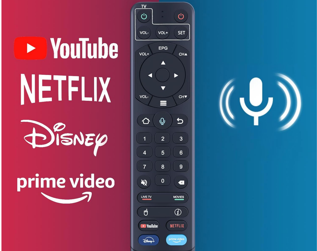
Figure 3: Voice and Hotkey Buttons. Features a dedicated voice command button and quick access buttons for popular streaming services.

There are 4 dedicated Netflix, YouTube, Disney+, Primevideo access buttons on the screen, which may be the first choice for most people to access streaming sources