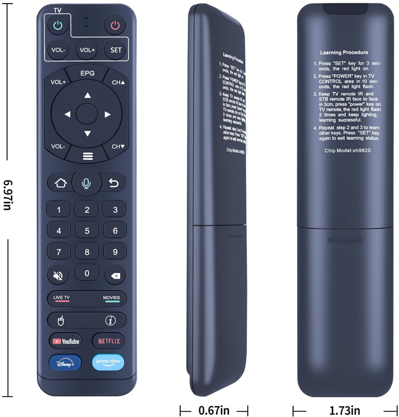
Figure 2: Remote Control Dimensions. The remote measures approximately 6.97 inches in length, 1.73 inches in width, and 0.67 inches in thickness.