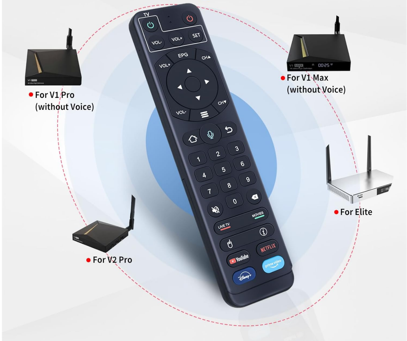
Figure 4: Compatible vSeeBox Devices.