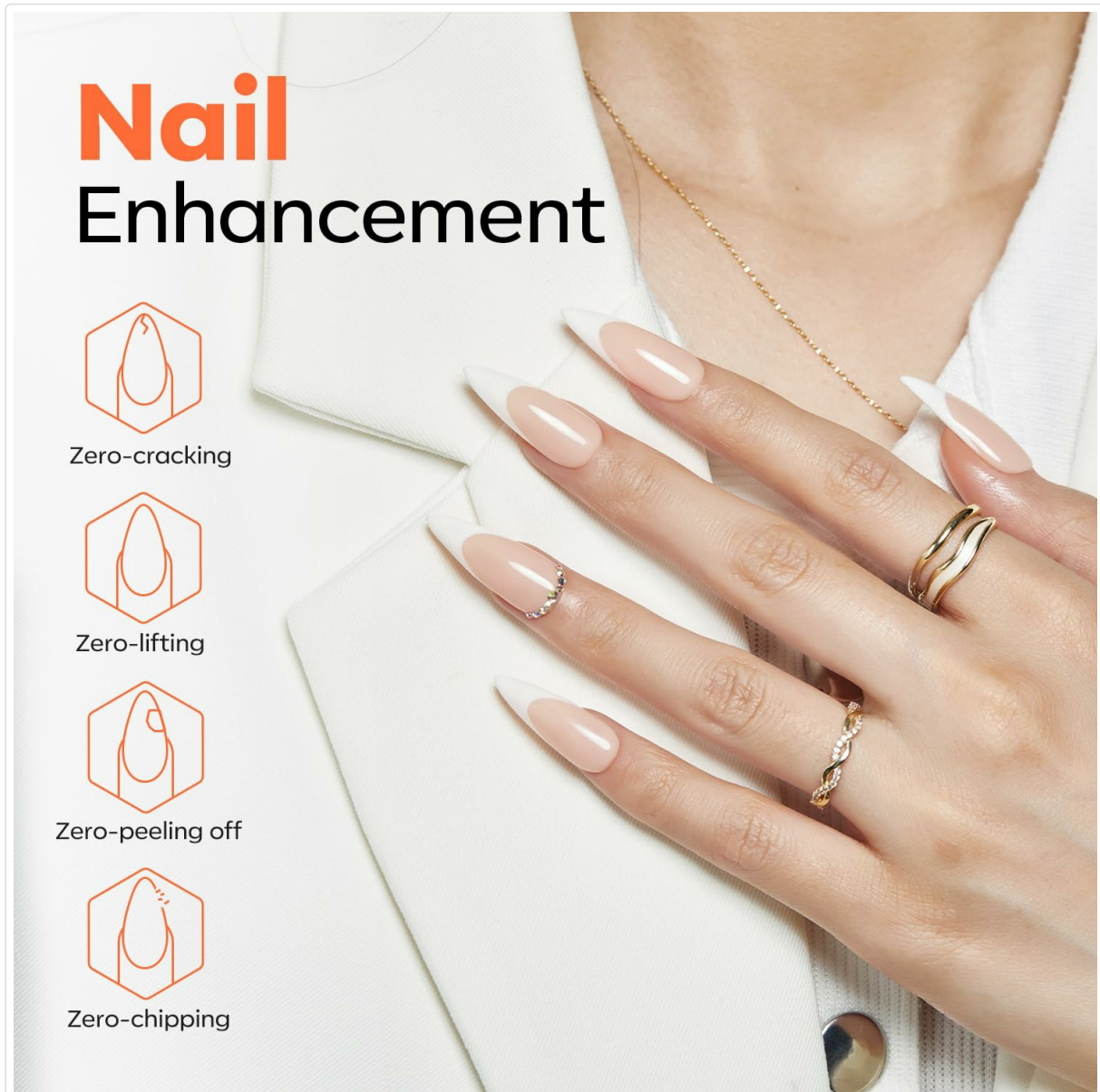
Image 5.1: Diagram illustrating how proper application can prevent common issues like cracking, lifting, peeling, and chipping.