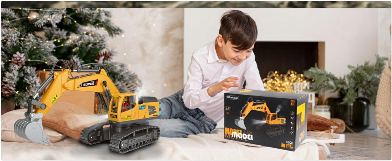
Figure 2.1: Package contents of the ViRockSign 16 Channel RC Excavator.