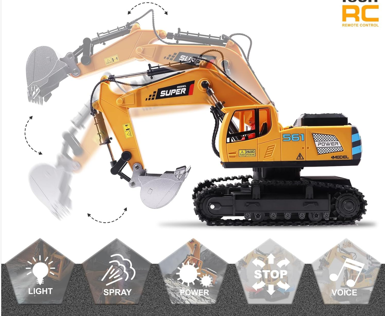
Figure 5.2: Simulated digging arm in action.