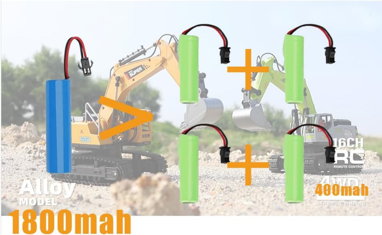
Figure 4.1: Excavator battery installation and charging setup.