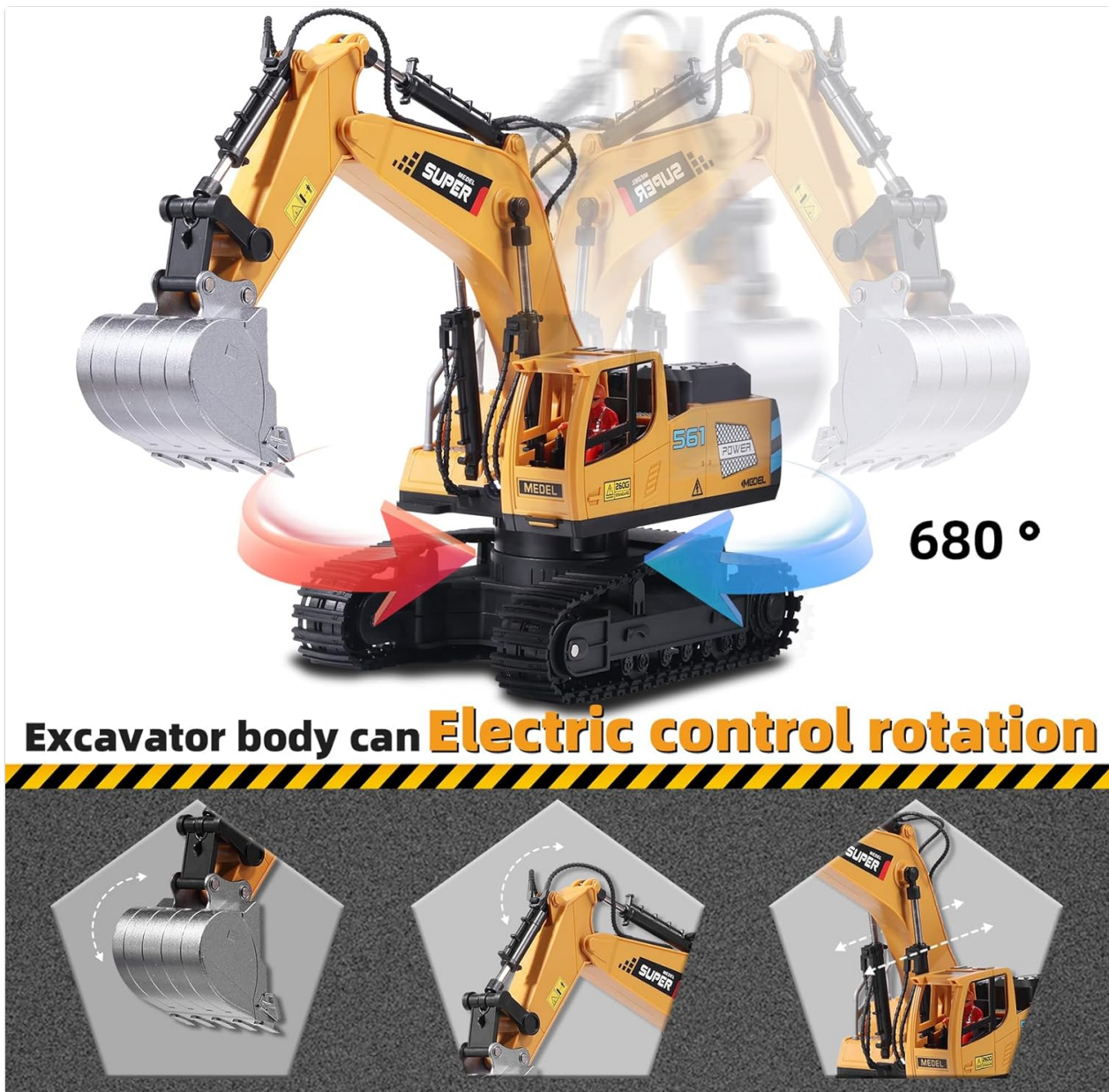
Figure 5.3: Excavator body electric control rotation.