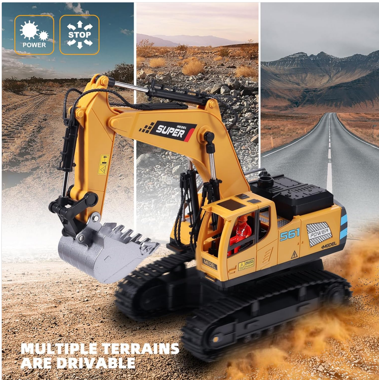
Figure 5.4: Excavator operating on multiple terrains.

Video 5.1: Demonstration of the ViRockSign RC Excavator's features and operation on various terrains, including its digging capabilities and remote control functions.