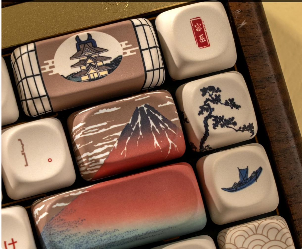
Figure 4.1: Detailed view of keycaps demonstrating the dye sublimation technique, which ensures the intricate designs are durable and fade-resistant.

Fade-resistant, more durable, and non-slip.