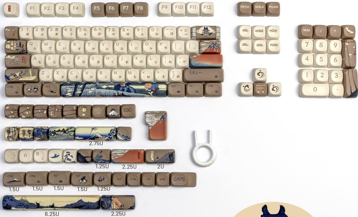
Figure 2.1: The complete 140-keycap set, including various sizes and a keycap puller, showcasing the Japanese Fuji Mountain theme.