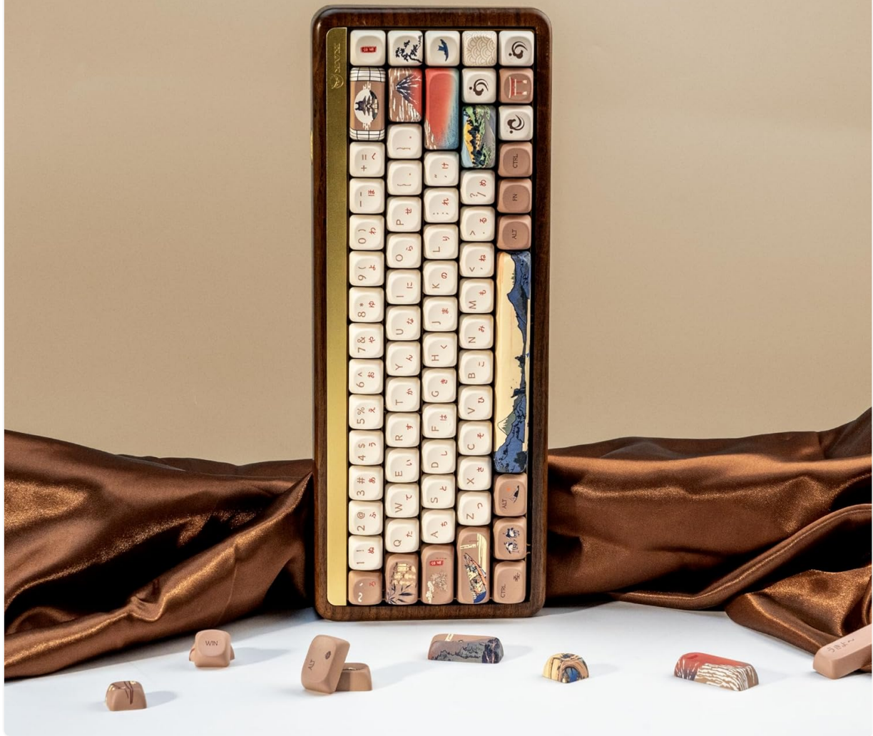
Figure 6.1: An example of the keycaps installed on a mechanical keyboard, demonstrating the aesthetic outcome.

Your browser does not support the video tag.