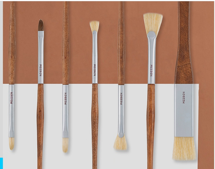
Image 4.2: Illustration of the 10 various brush sizes and shapes, demonstrating their unique painting effects for different artistic needs.

Embedded & reinforced - firmly connect the handle and bristle, won't shed