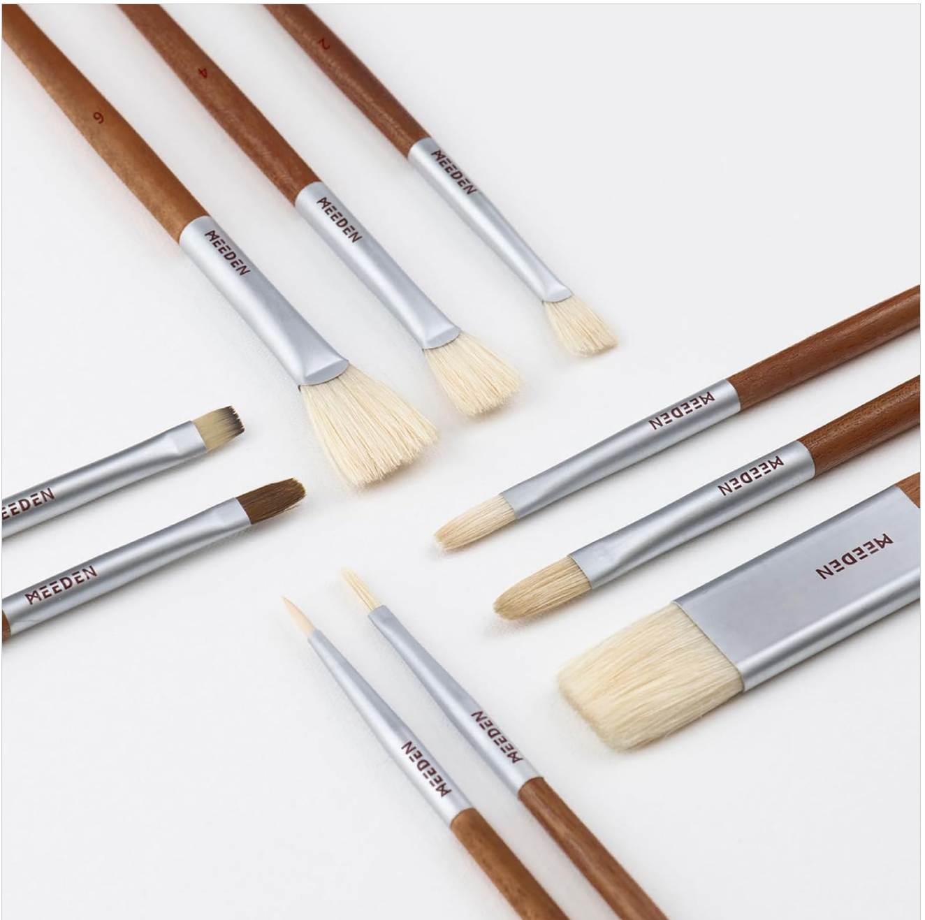
Image 1.1: The MEEDEN Artist Oil Paint Brush Set, showcasing the variety of brushes within their packaging.