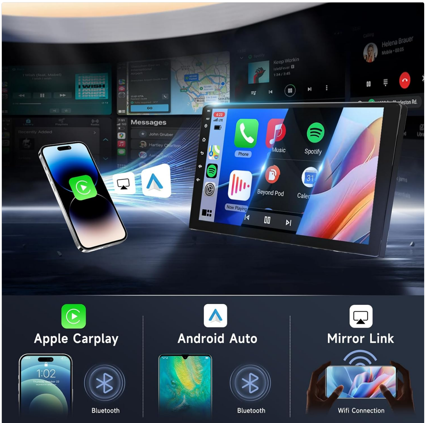
Image: Illustrates the seamless integration of Apple CarPlay, Android Auto, and Mirrorlink with various smartphone devices.