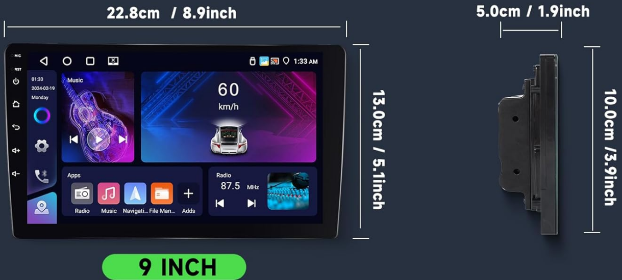
Image: A visual representation of the product dimensions and a detailed list of all included accessories and cables.