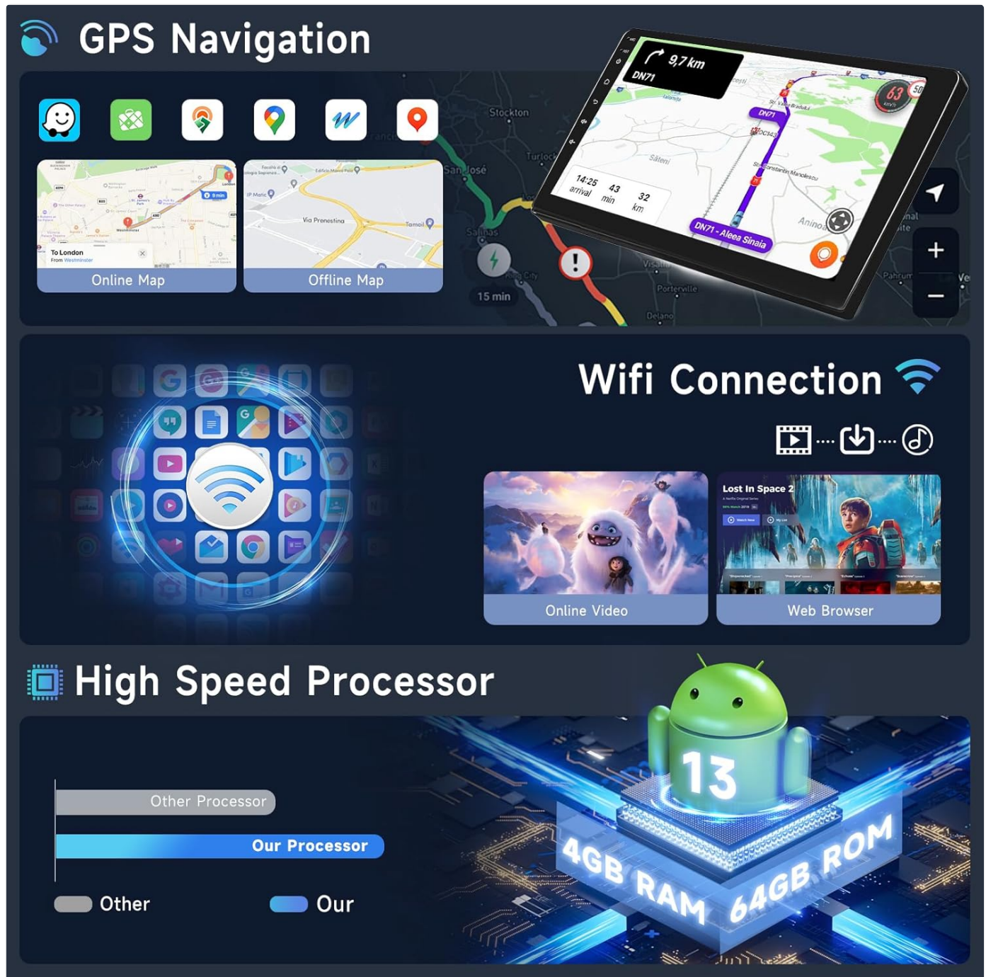
Image: Displays the GPS navigation interface with online and offline map options, alongside the Wi-Fi connection screen for internet access.