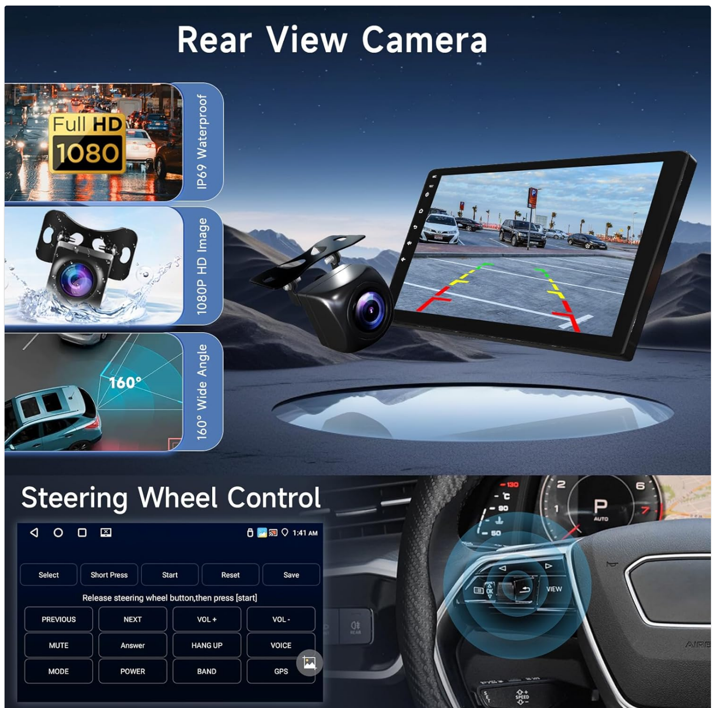
Image: Shows the clear display of the rear view camera with guidelines and the user interface for configuring steering wheel controls.