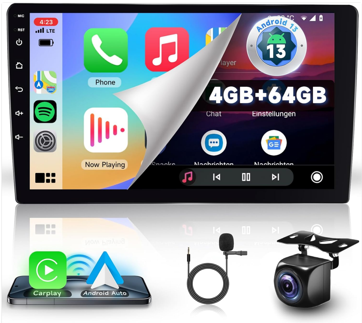
Image: The Hodozzy 9-inch Double Din Android Car Stereo unit, showcasing its display and key features, along with a microphone and rear camera.