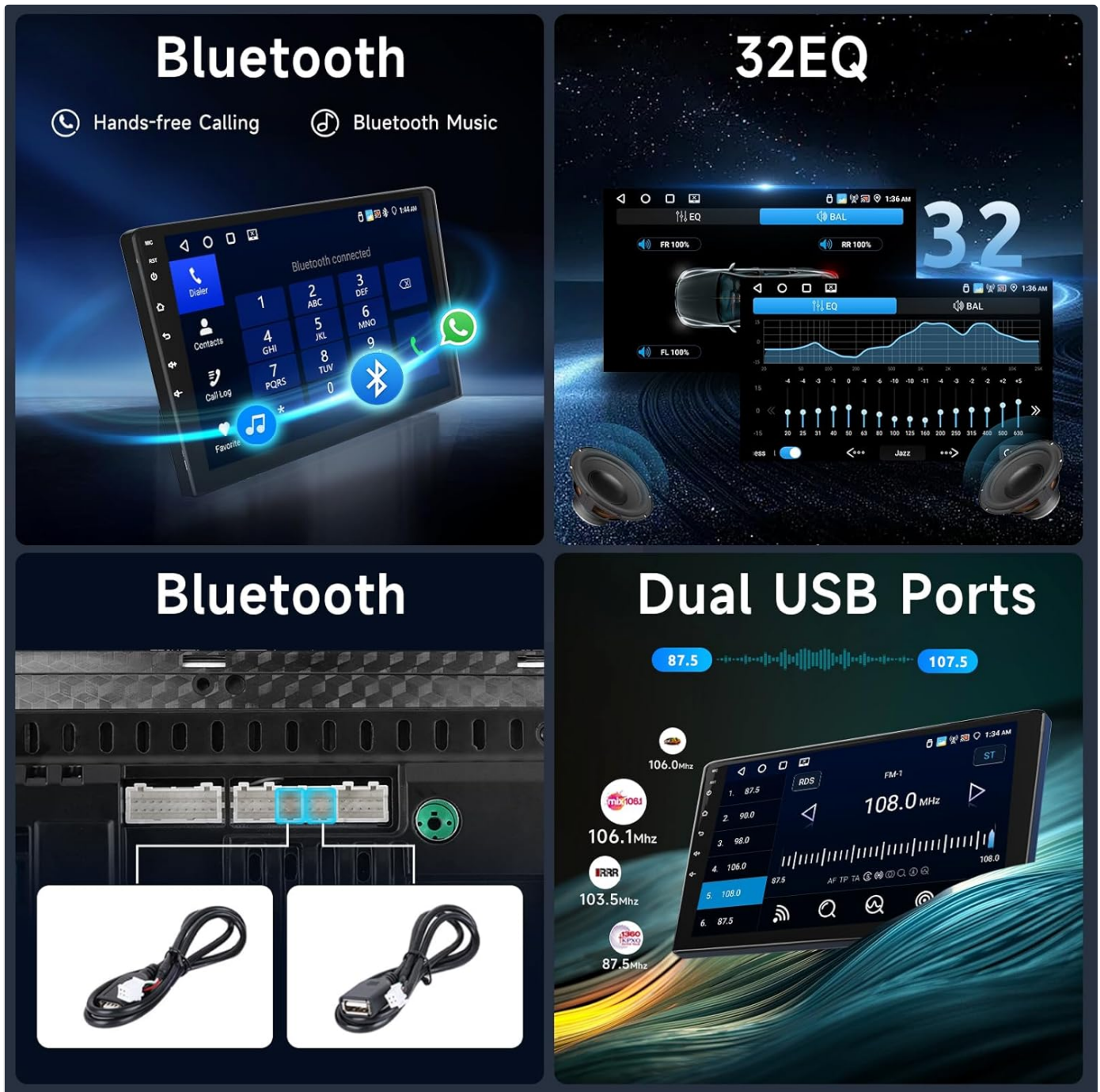
Image: Details the Bluetooth hands-free calling interface, the 32-band equalizer for sound customization, and the dual USB ports for connectivity.