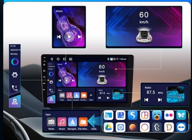
Image: Demonstrates the vibrant full-color HD screen, split-screen capability, and diverse UI designs available on the car stereo.