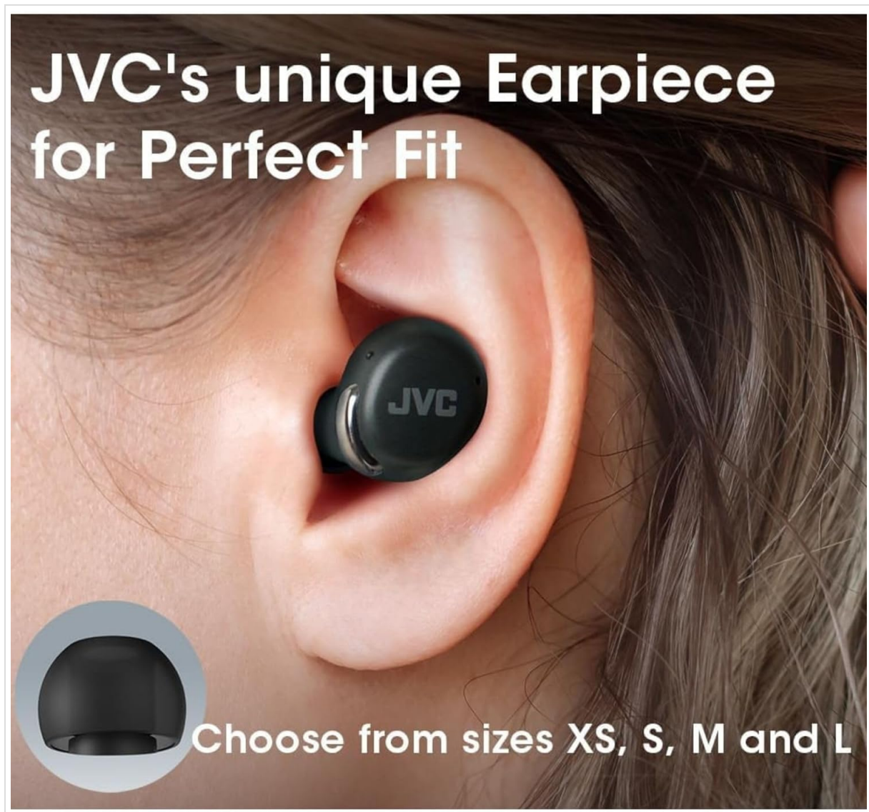
Image: An earbud properly seated in an ear, demonstrating a secure fit, alongside an illustration of different eartip sizes.

Proper fit is crucial for optimal sound quality and active noise cancelling performance. Select the eartip size (XS, S, M, L) that provides a snug and comfortable seal in your ear canal. Gently insert each earbud into your ear and twist slightly to secure it.