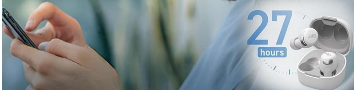
Image: A person using the JVC HA-A30T2B earbuds with a smartphone, illustrating seamless Bluetooth connectivity.

Pair instantly and stay connected. Enjoy seamless audio transitions for gaming, calls, or music.