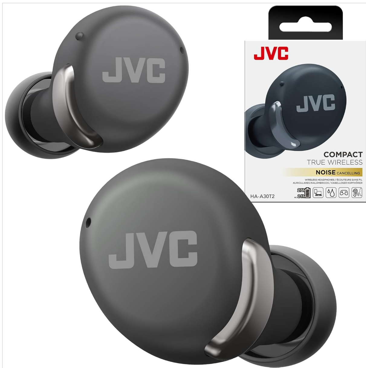
Image: JVC HA-A30T2B True Wireless Compact Earbuds, showing the earbuds, charging case, and product packaging.