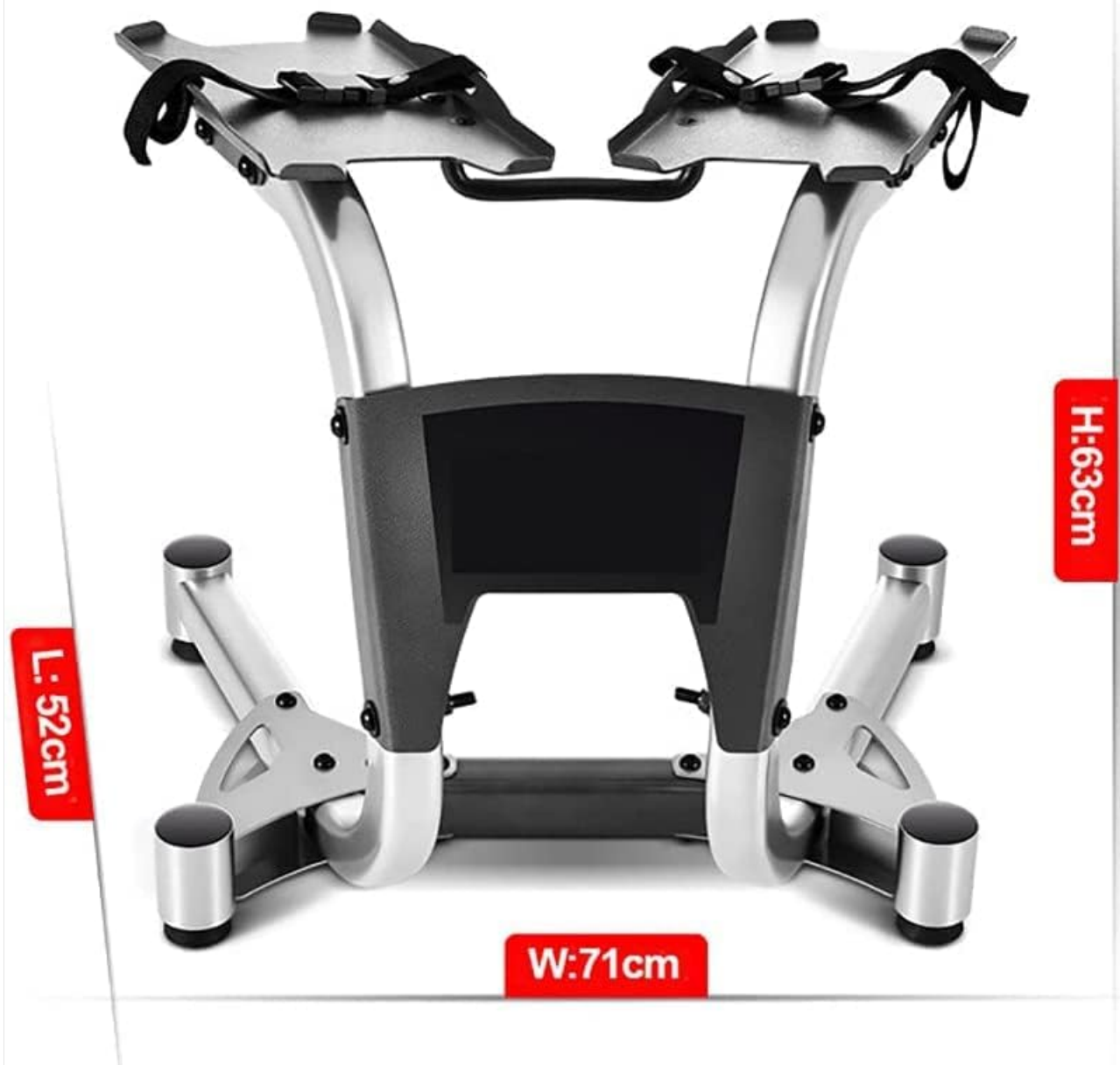
Figure 2: Dimensional overview of the BRAINGAIN Weight Rack, showing length (52cm), width (71cm), and height (63cm).