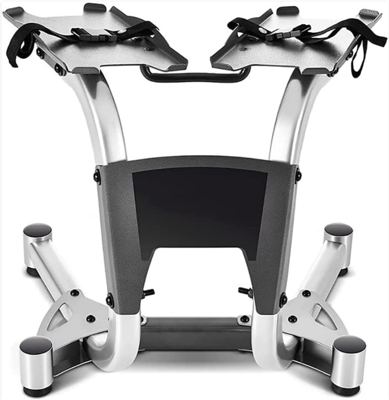
Figure 1: Fully assembled BRAINGAIN Weight Rack, designed to hold adjustable dumbbells at an ergonomic height.