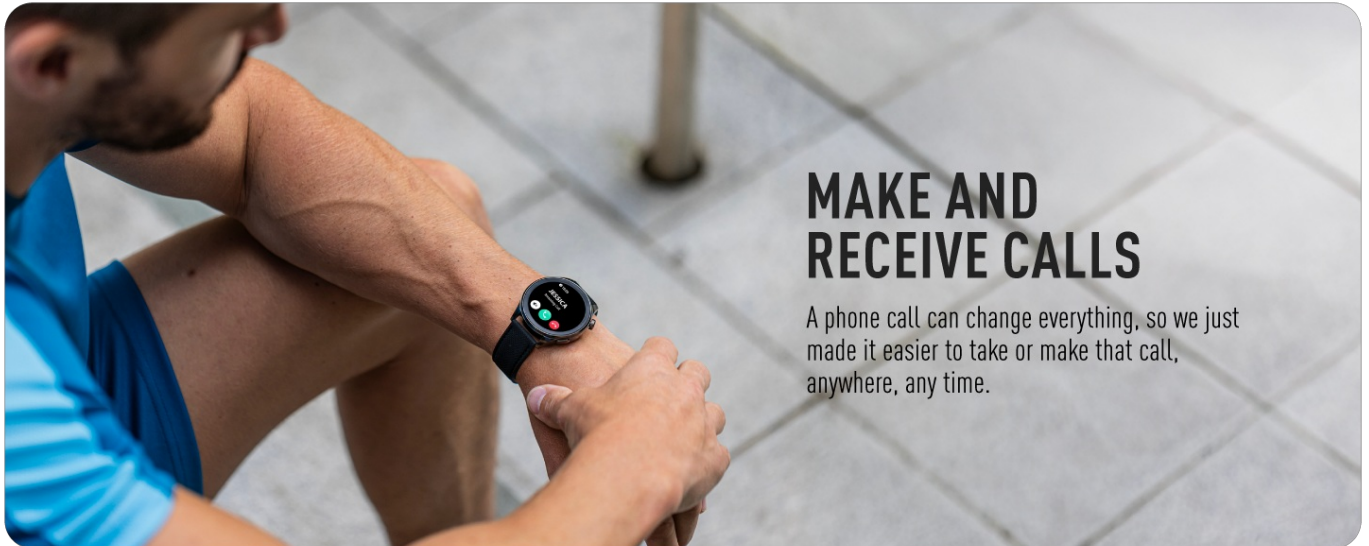
Image: A man using the Reflex Active Smart Watch to make or receive a call, highlighting the convenience of wrist-based communication.