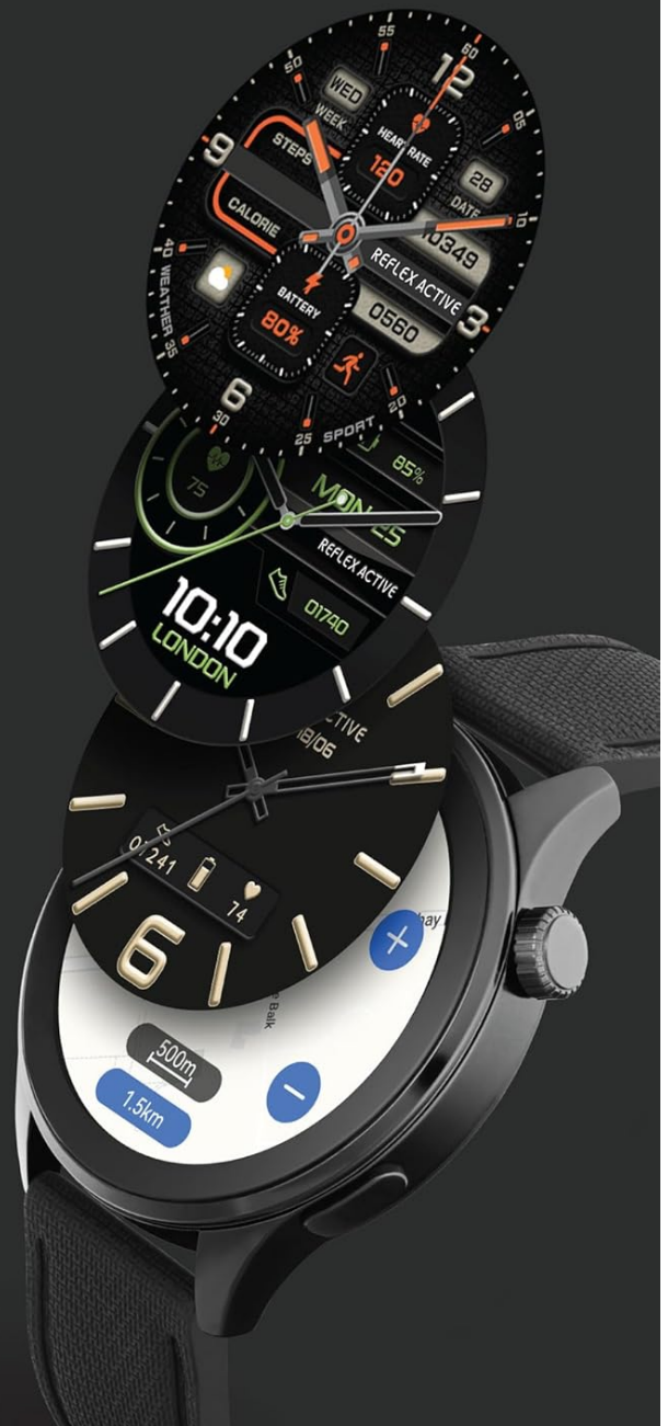
Image: An infographic detailing the primary features of the Reflex Active Series 45 Smart Watch.