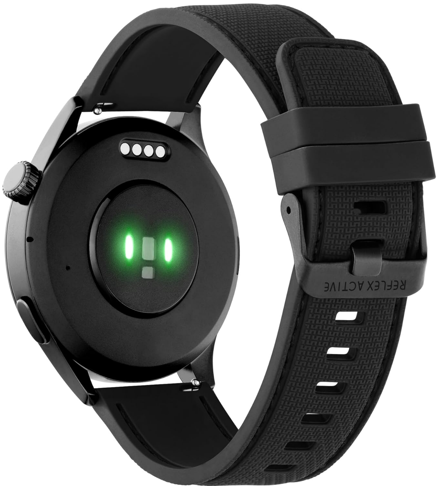
Image: The back of the Reflex Active Smart Watch, highlighting the optical heart rate sensors with green LED lights.