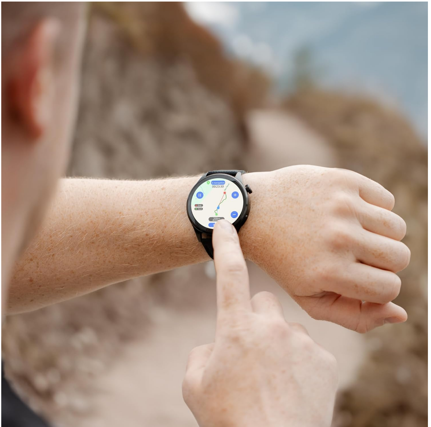
Image: A user interacting with the Reflex Active Smart Watch, displaying a map with a tracked route, demonstrating the built-in GPS functionality.