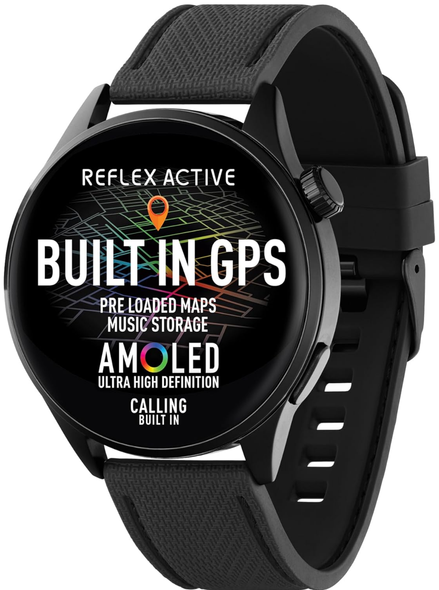
Image: Front view of the Reflex Active Series 45 Smart Watch showcasing its AMOLED display with GPS, maps, music storage, and calling features.