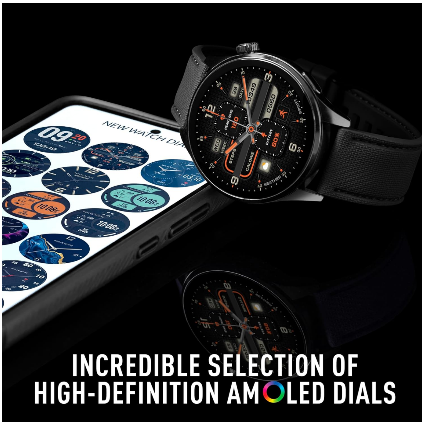
Image: The Reflex Active Smart Watch alongside a smartphone screen showing multiple watch dial designs, demonstrating the customisation options.