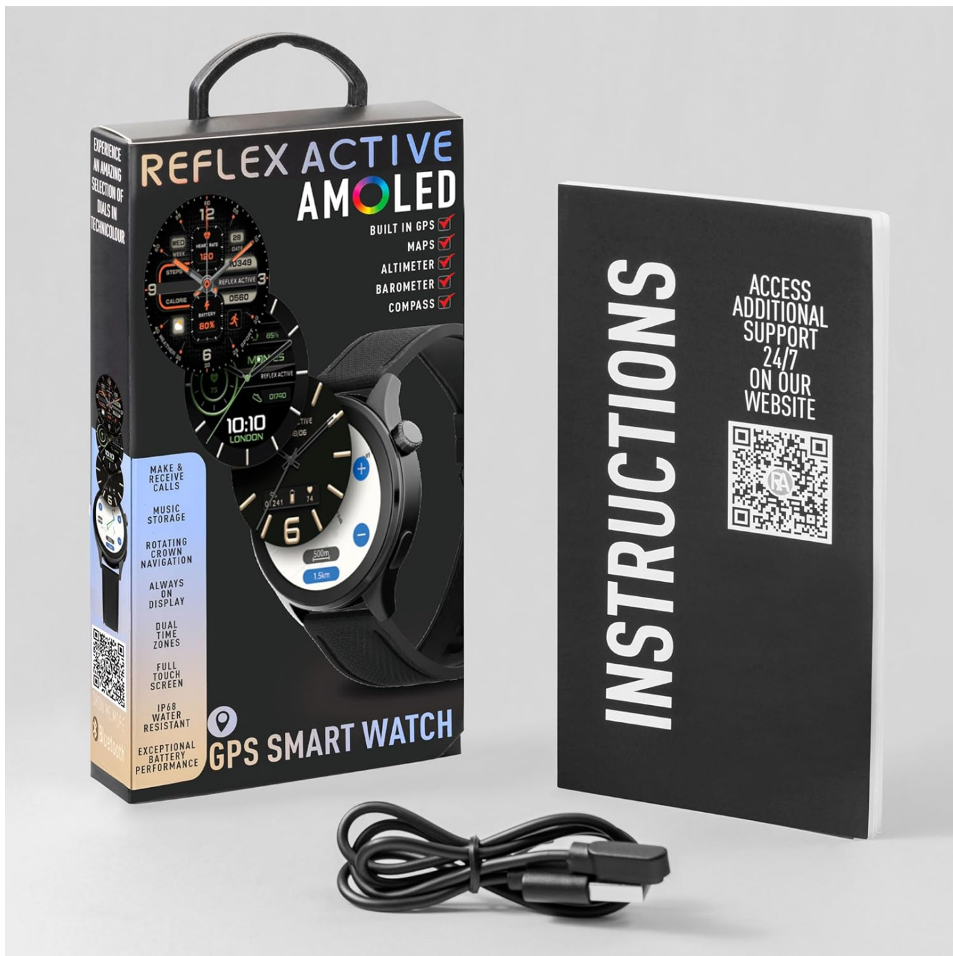
Image: The retail box of the Reflex Active Series 45 Smart Watch, showing the watch, instruction manual, and USB charging cable.