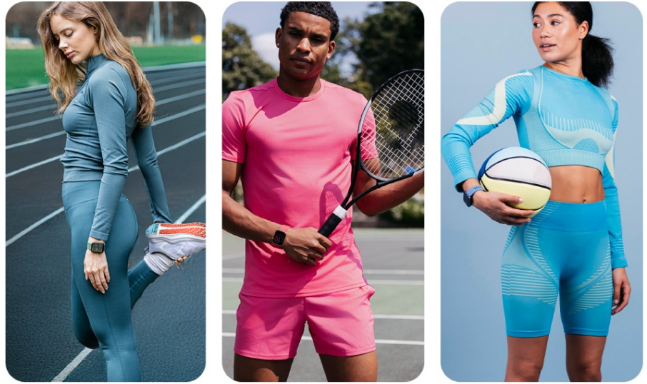
Image: Three individuals demonstrating various sports activities, highlighting the multi-sport tracking capabilities of the Reflex Active Smart Watch.

Whatever sport you enjoy, keep motivated & track it with our multiple activity modes including walking, running, swimming...and more!