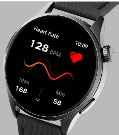
Image: The Reflex Active Smart Watch display showing a heart rate reading, illustrating the heart rate monitoring feature.

Keep an eye on your heart rate throughout the day with our integral heart rate monitor.