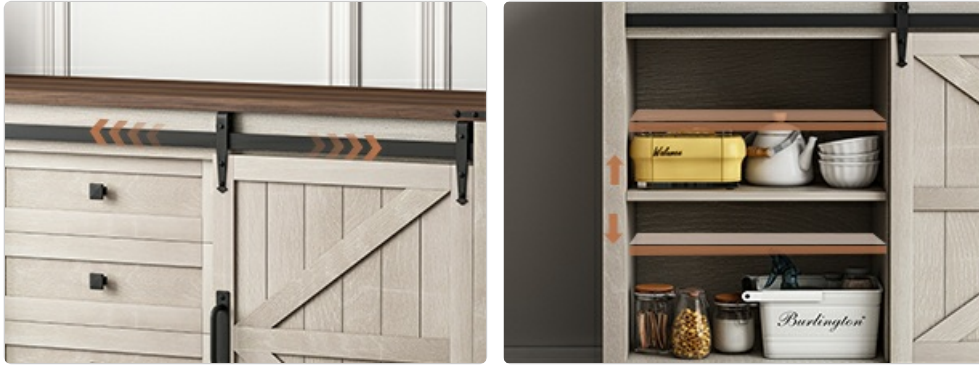
Figure 3.1: Detailed views of the barn door sliding mechanism and drawer slides, illustrating key assembly points.

For detailed visual guidance, refer to the online video support mentioned in your product documentation. This can be particularly helpful for complex steps like installing the sliding barn doors or drawer mechanisms.