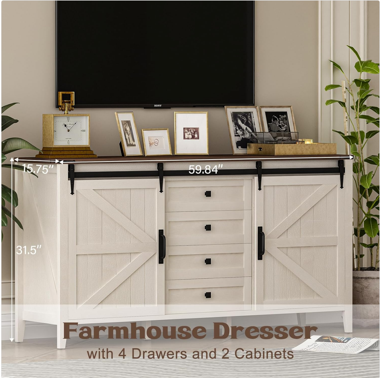
Figure 7.1: Diagram illustrating the key dimensions of the GlouMod Rustic Farmhouse Dresser.