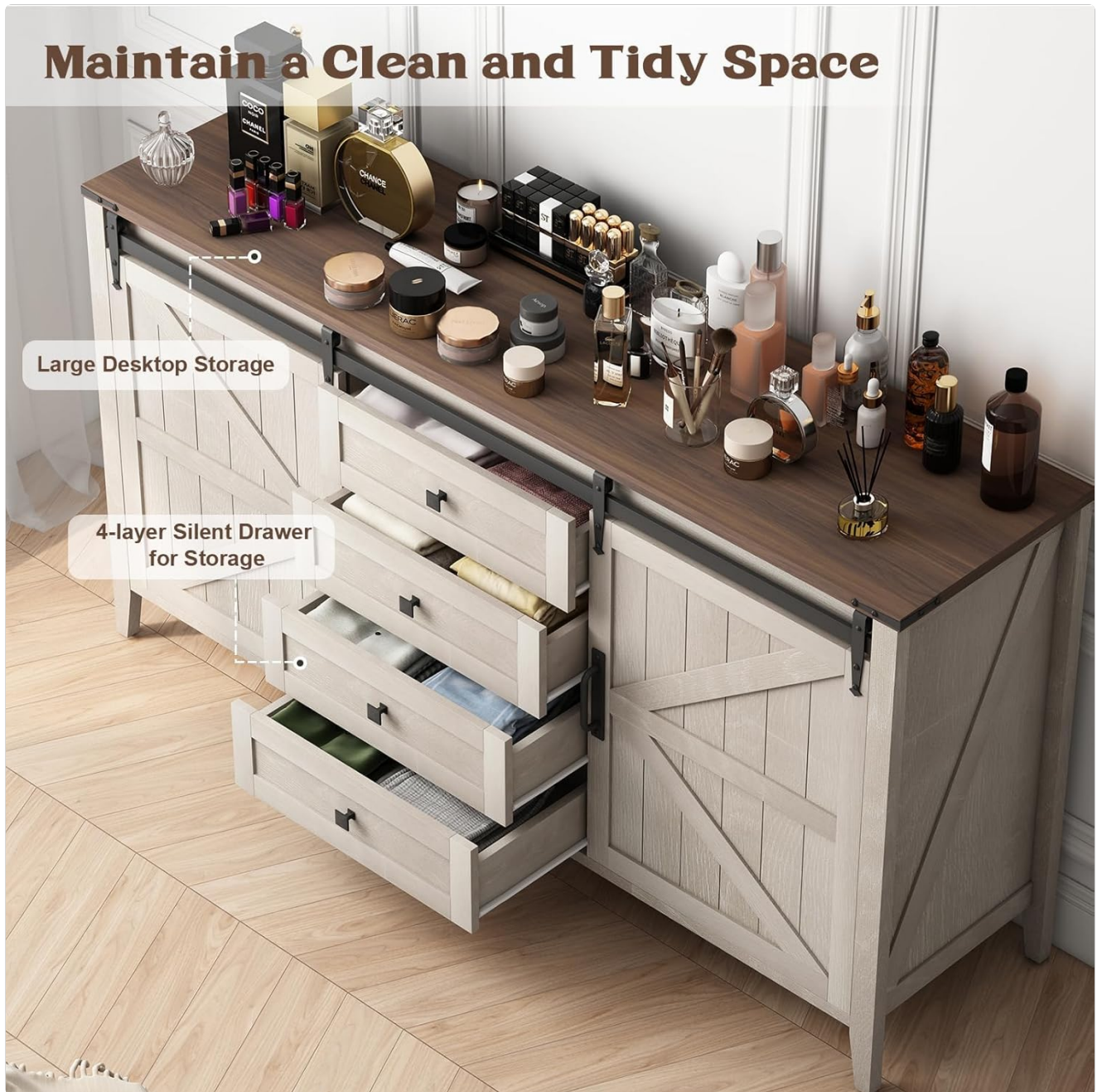
Figure 4.1: The dresser with its four drawers open, demonstrating ample storage space for various items.