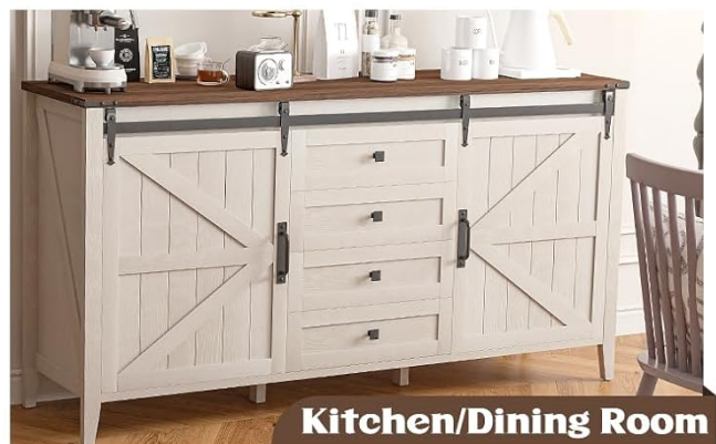
Figure 4.4: Examples of the dresser's versatile use in different home environments, including bedroom, living room, and kitchen/dining room.