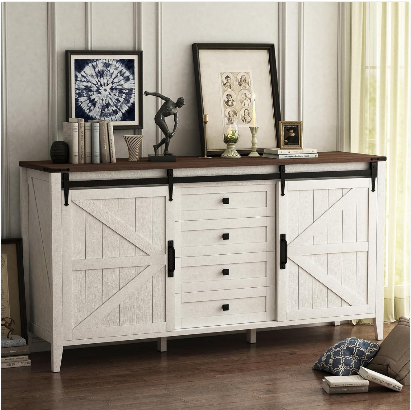
Figure 1.1: The GlouMod Rustic Farmhouse Dresser, showcasing its vintage white finish and barn door design.