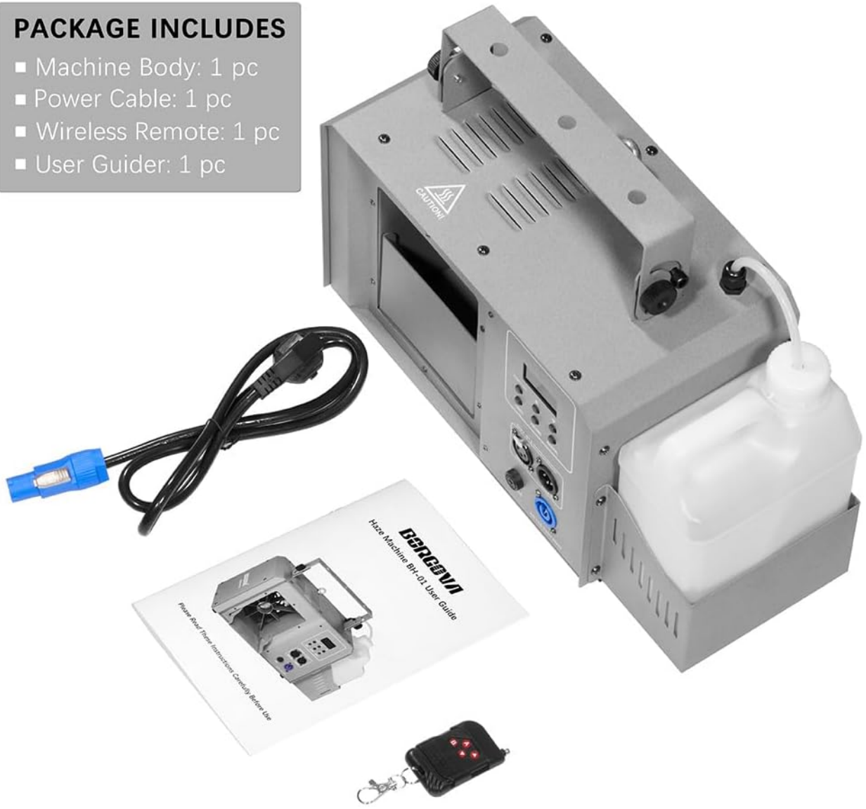
Image: All components included in the BORGOWA 700W Haze Machine package, laid out on a surface. This includes the haze machine, power cable, wireless remote, and user guide.