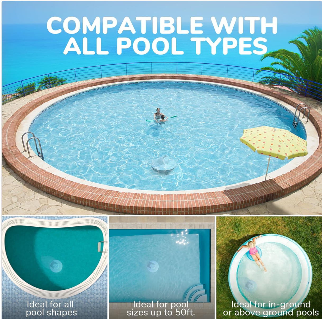
Image: Maximum cleaning area specifications.