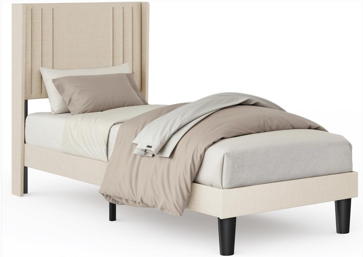
Figure 3.2.2: This image focuses on the sturdy legs and the upholstered frame, highlighting the stable and firm construction of the bed.