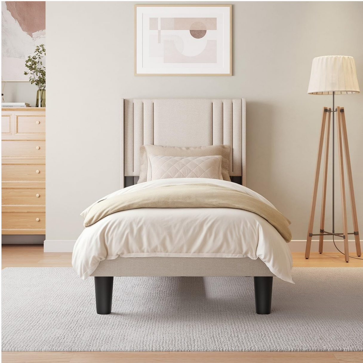
Figure 4.1.2: This image demonstrates the ample clearance beneath the bed, ideal for storing items in baskets and allowing for easy cleaning with a robotic vacuum.