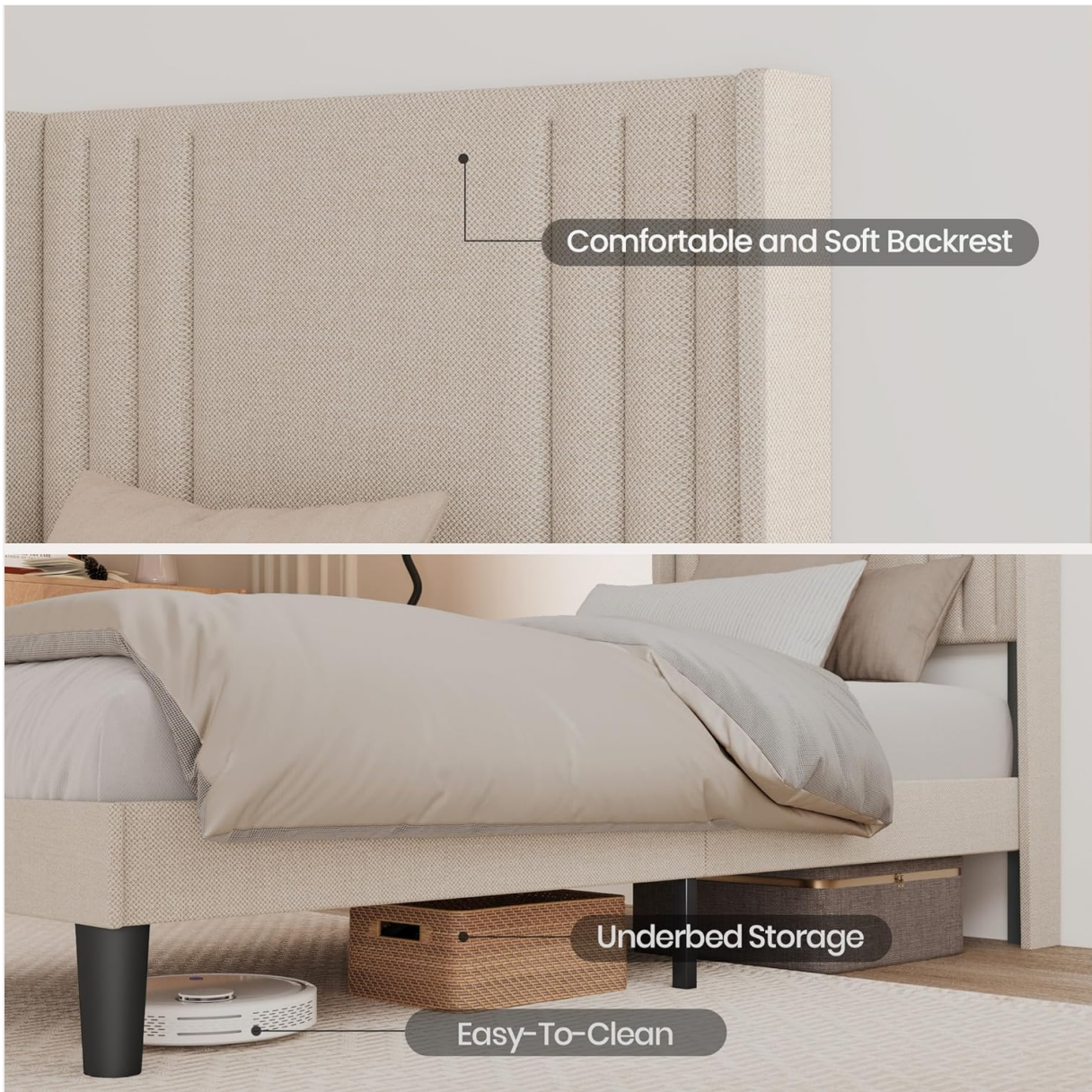
Figure 4.1.1: This image provides a detailed view of the upholstered headboard, emphasizing its comfortable padding and soft texture, designed for back support.