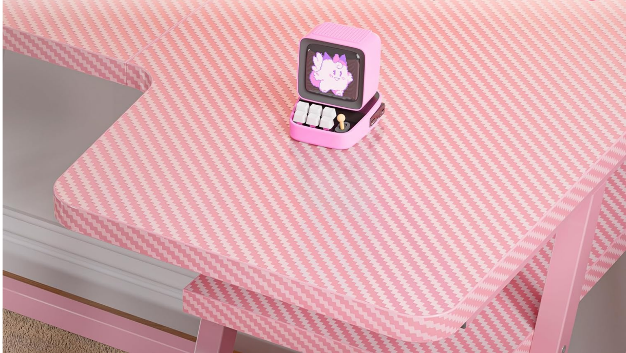
Image: Close-up of the desk surface, highlighting its carbon fiber texture which is designed to be scratch-resistant and waterproof for easy maintenance.

✓ Scratch Resistant 💧 Water proof 🧽 Easy to clean ↩️ Rounded corner design