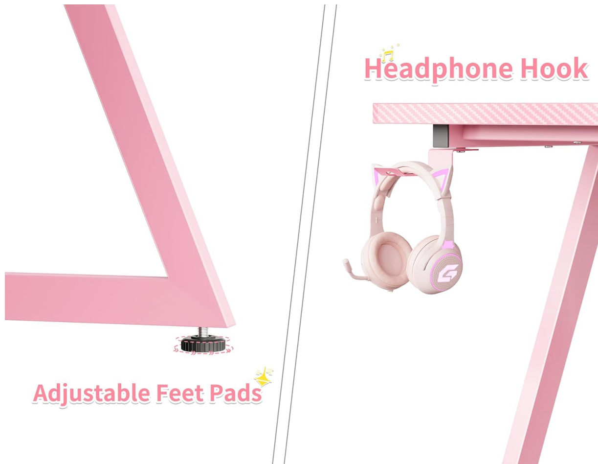
Image: Close-up view of the convenient headphone hook and the adjustable footpads designed for stability on various floor types.