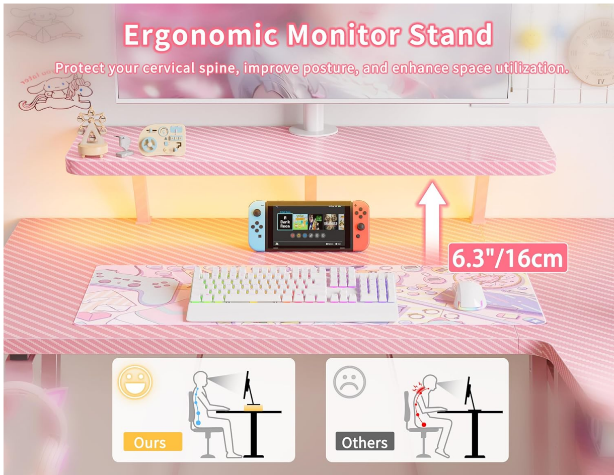
Image: The ergonomic monitor stand elevating a display, illustrating how it helps maintain proper posture and provides additional storage space.