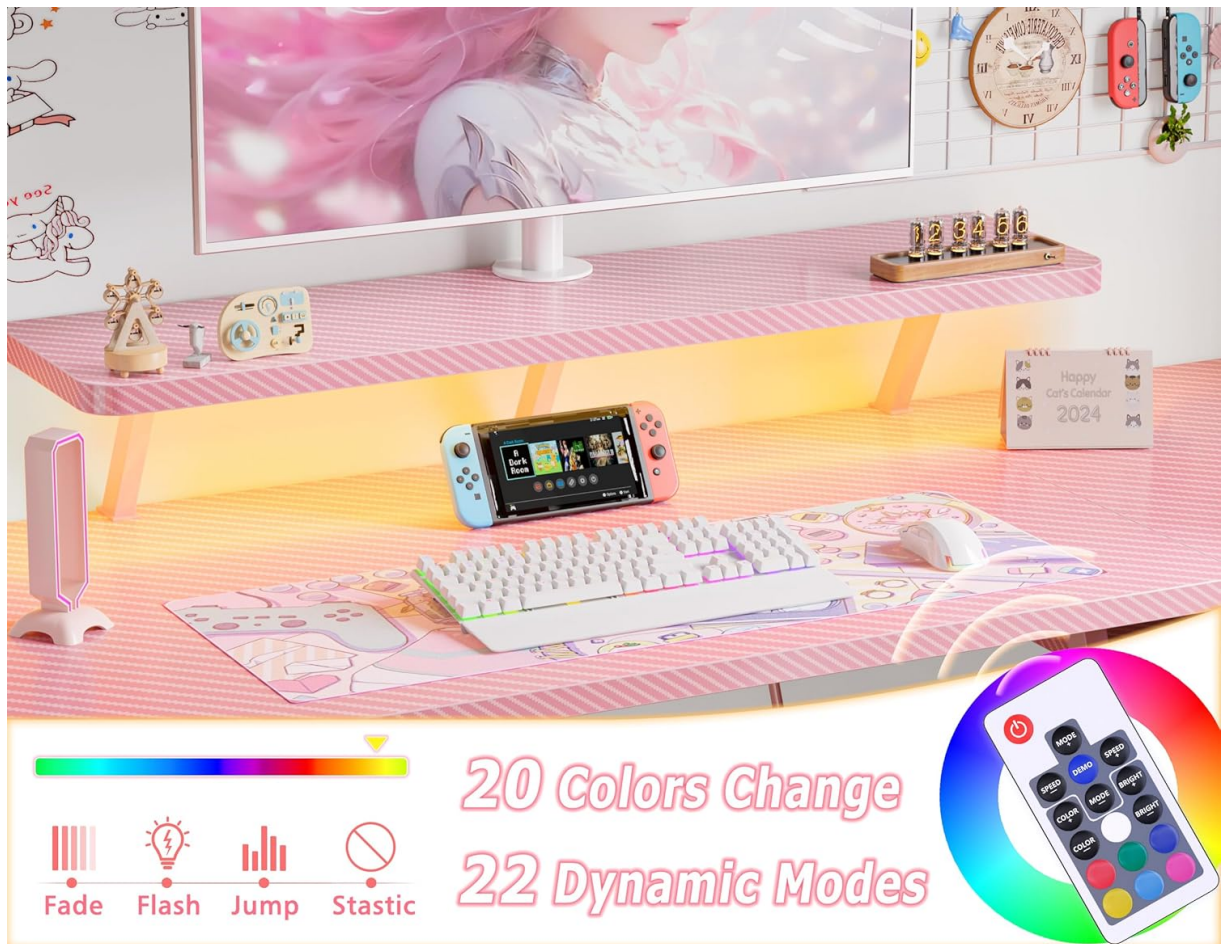
Image: The LED light strip under the monitor stand, displaying various color options, along with the remote control for customization.