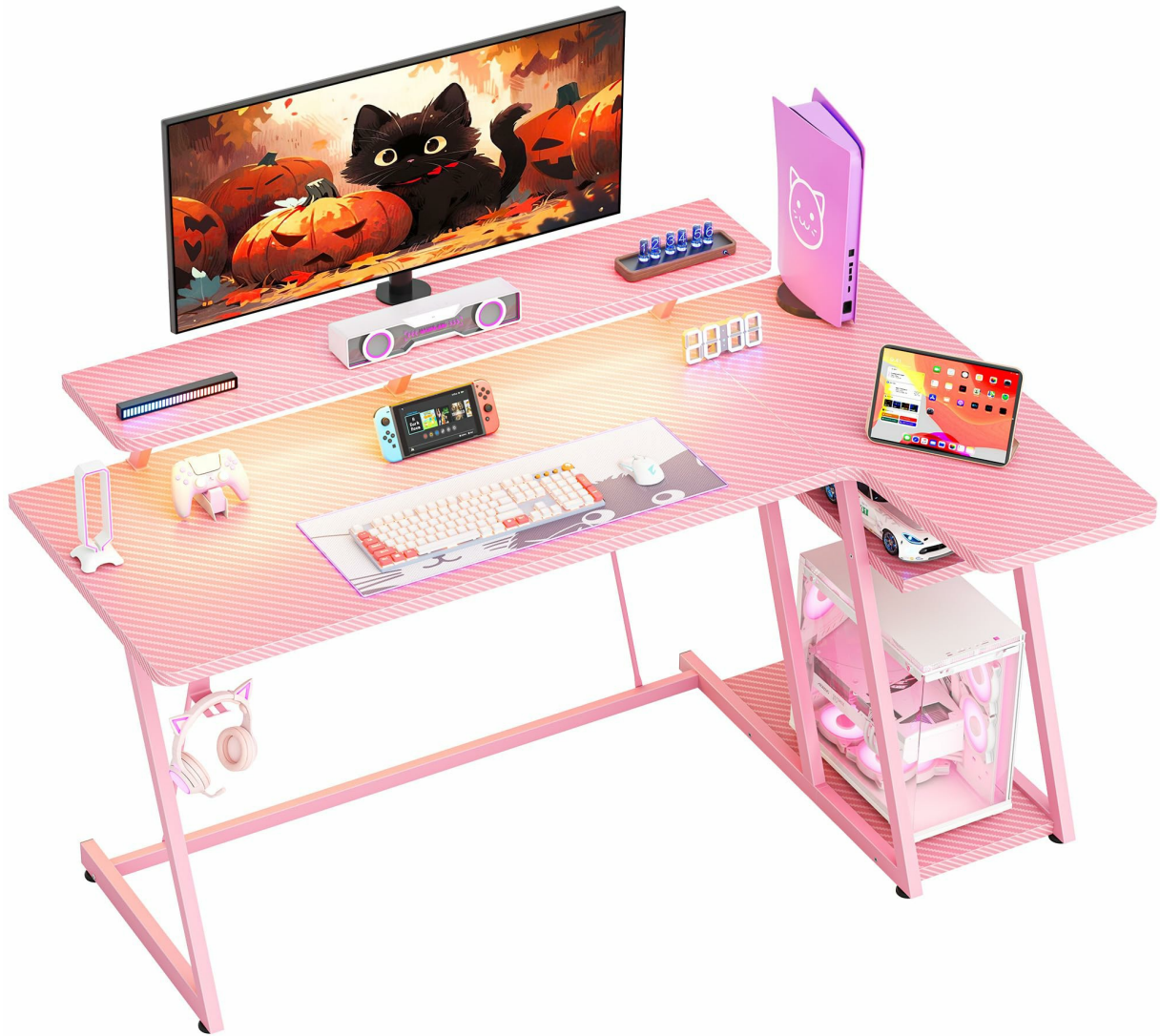
Image: Overall view of the HOMIDEC 140CM L-Shaped Gaming Desk with LED Lights, showcasing its design and features in a gaming setup.