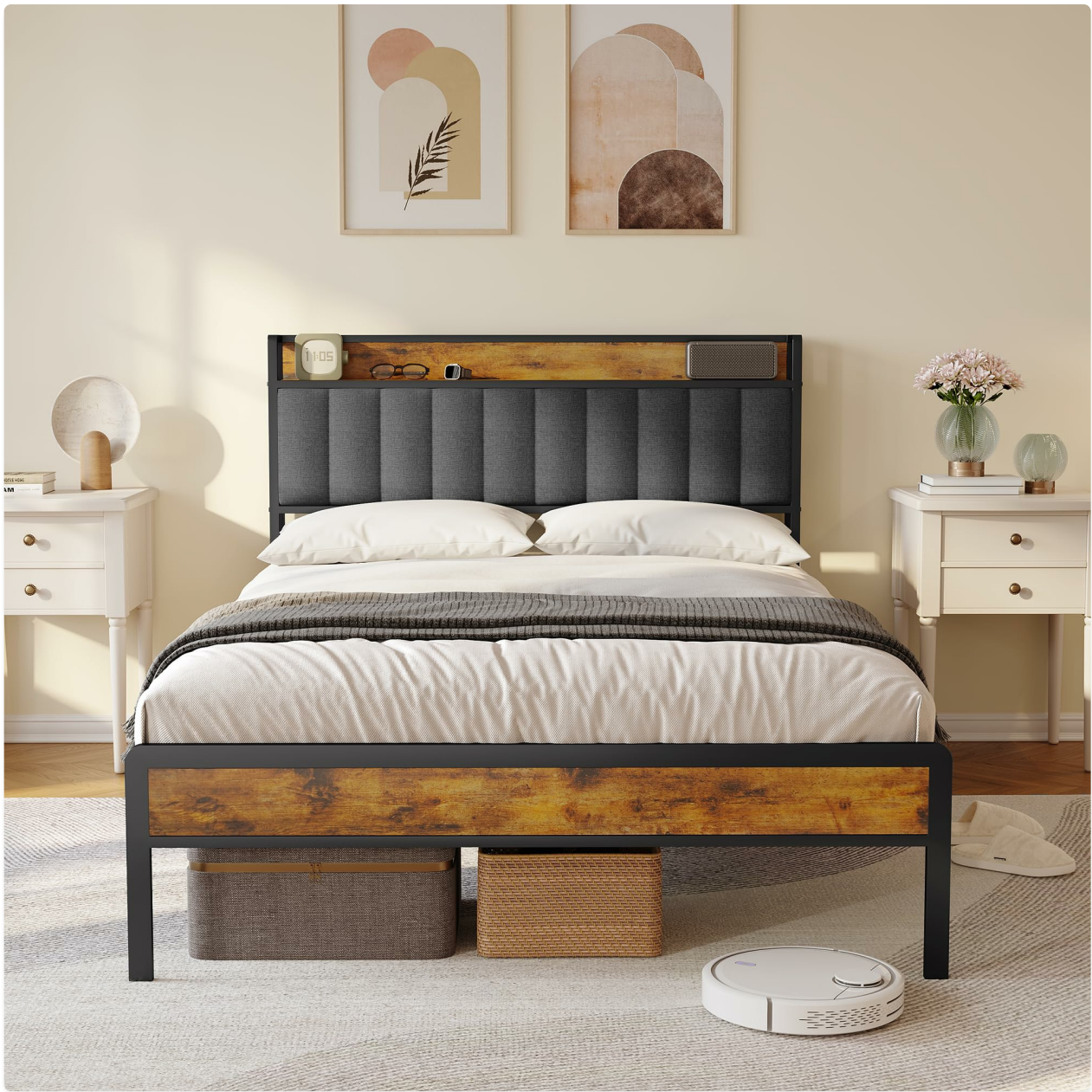
Image: Bealife Double Bed with Dark Grey Upholstered Headboard and Wooden Accents.