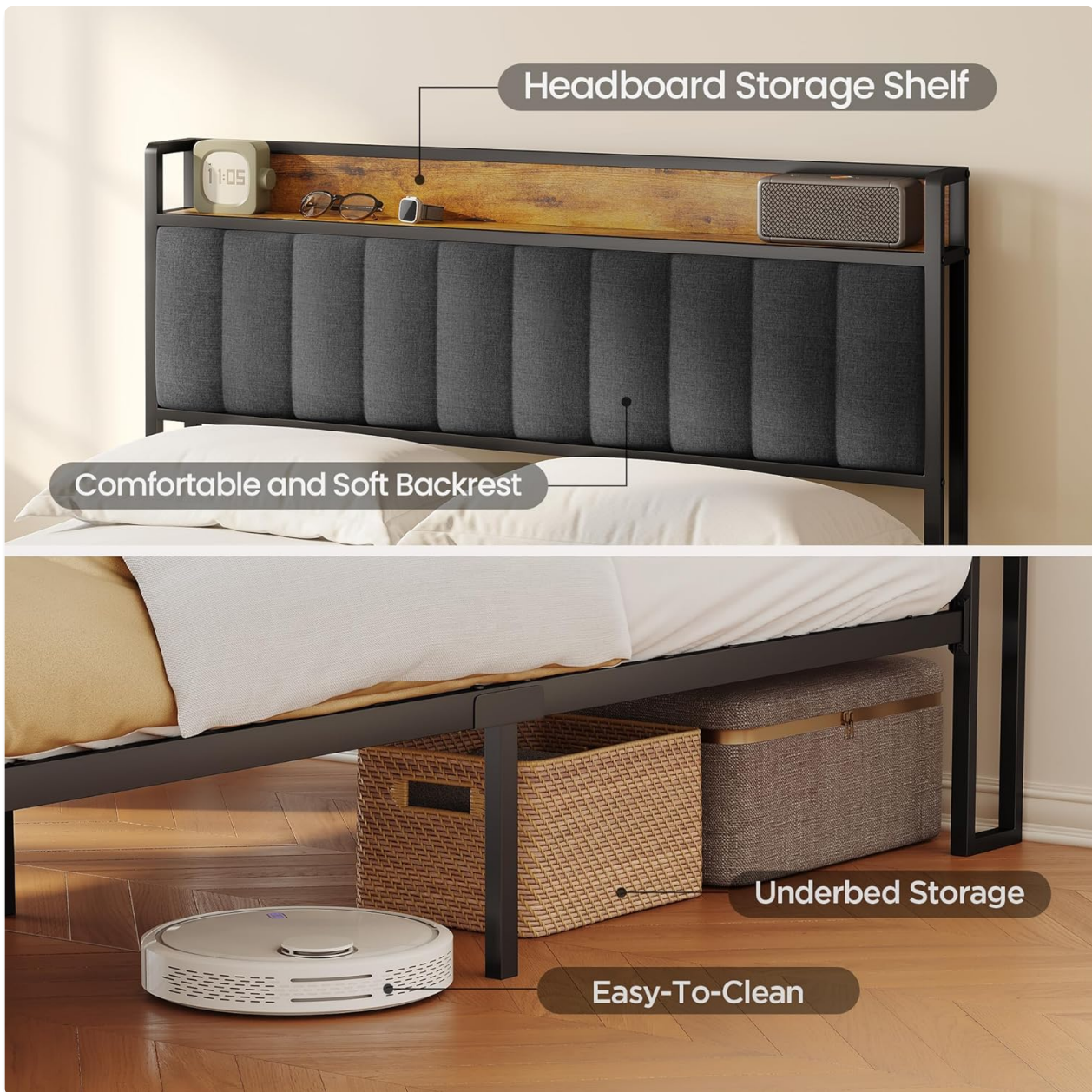
Image: Headboard storage shelf and under-bed storage area.