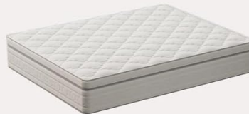
Image: Detailed product dimensions.

Mattress +Box Spring 20-30cm Total Height