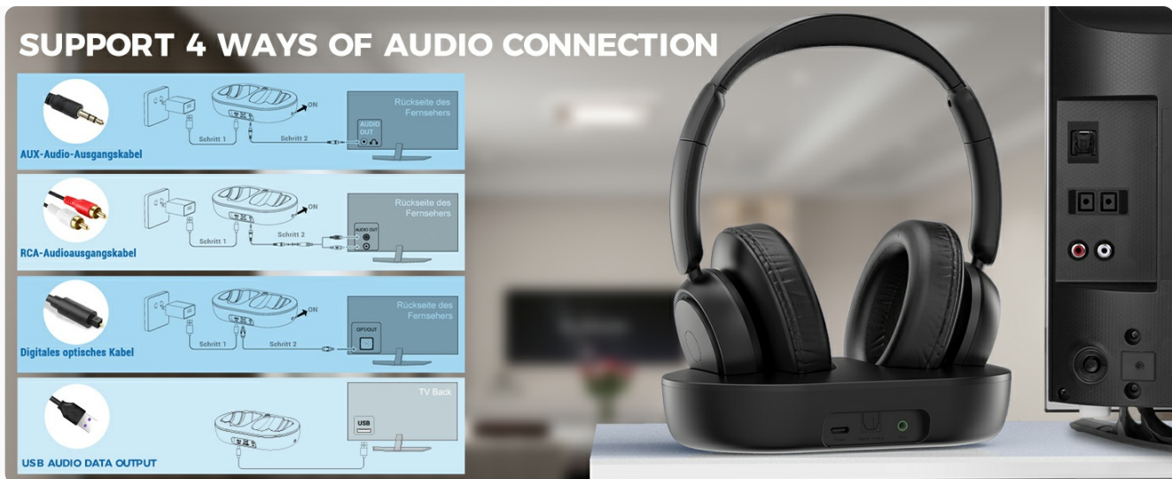
Image 4.1: Visual guide for connecting the transmitter to your TV using different audio cables.