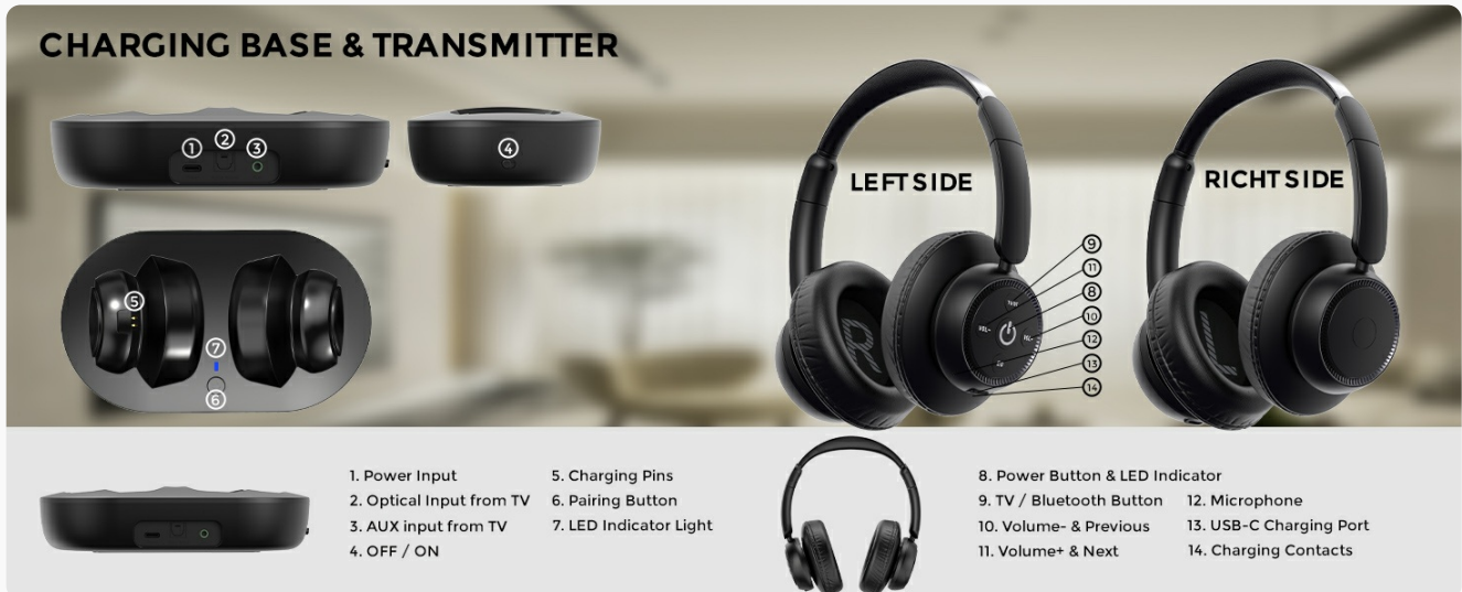
Image 3.1: Overview of headphone controls and transmitter base ports.