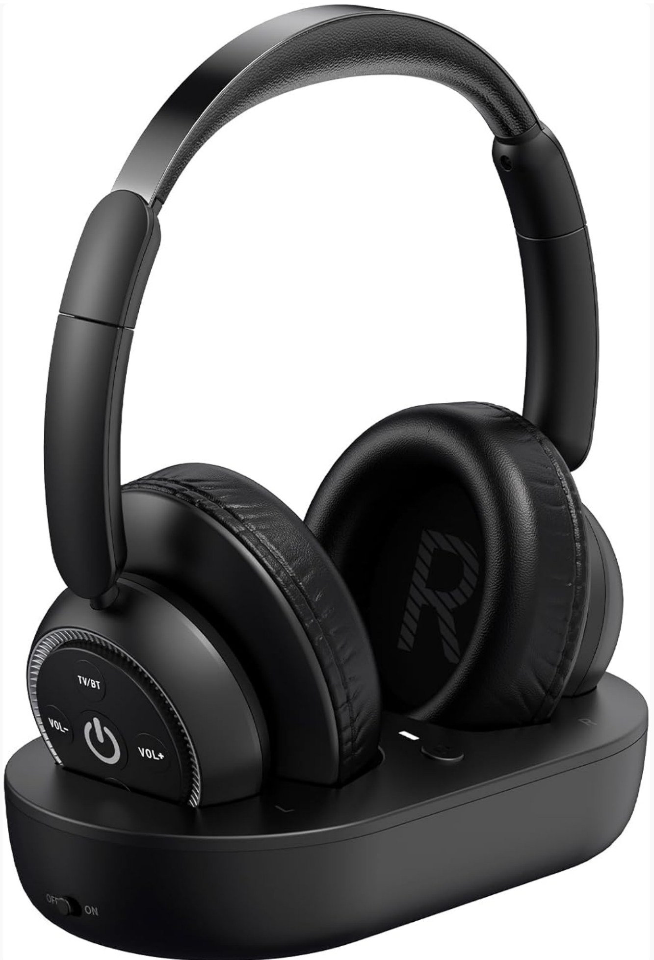
Image 1.1: ROSIDA M98A Wireless TV Headphones on their charging base.