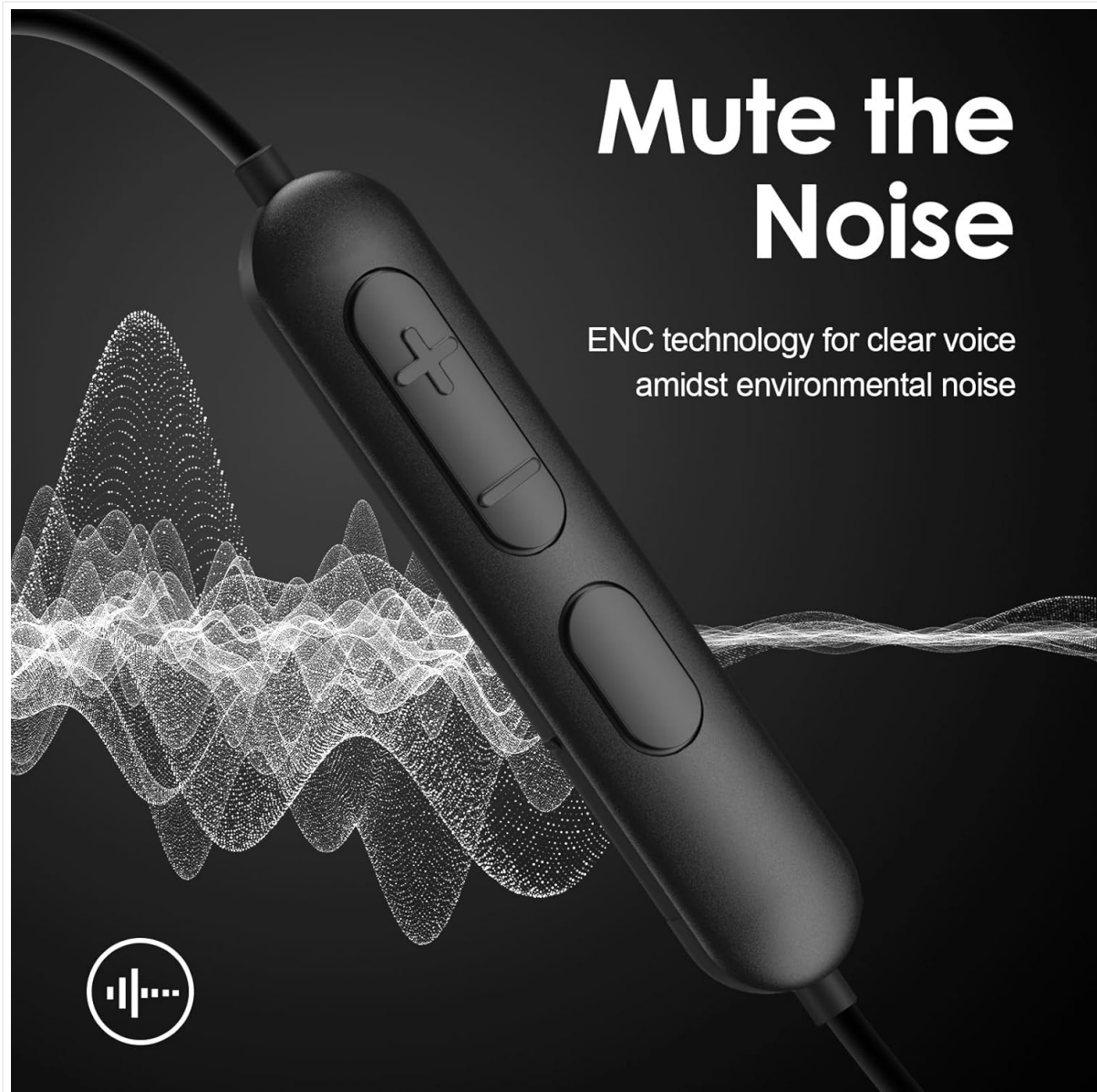
Image: Close-up of the control module on the Rythflo WH03 headphones, showing the USB-C charging port being connected.