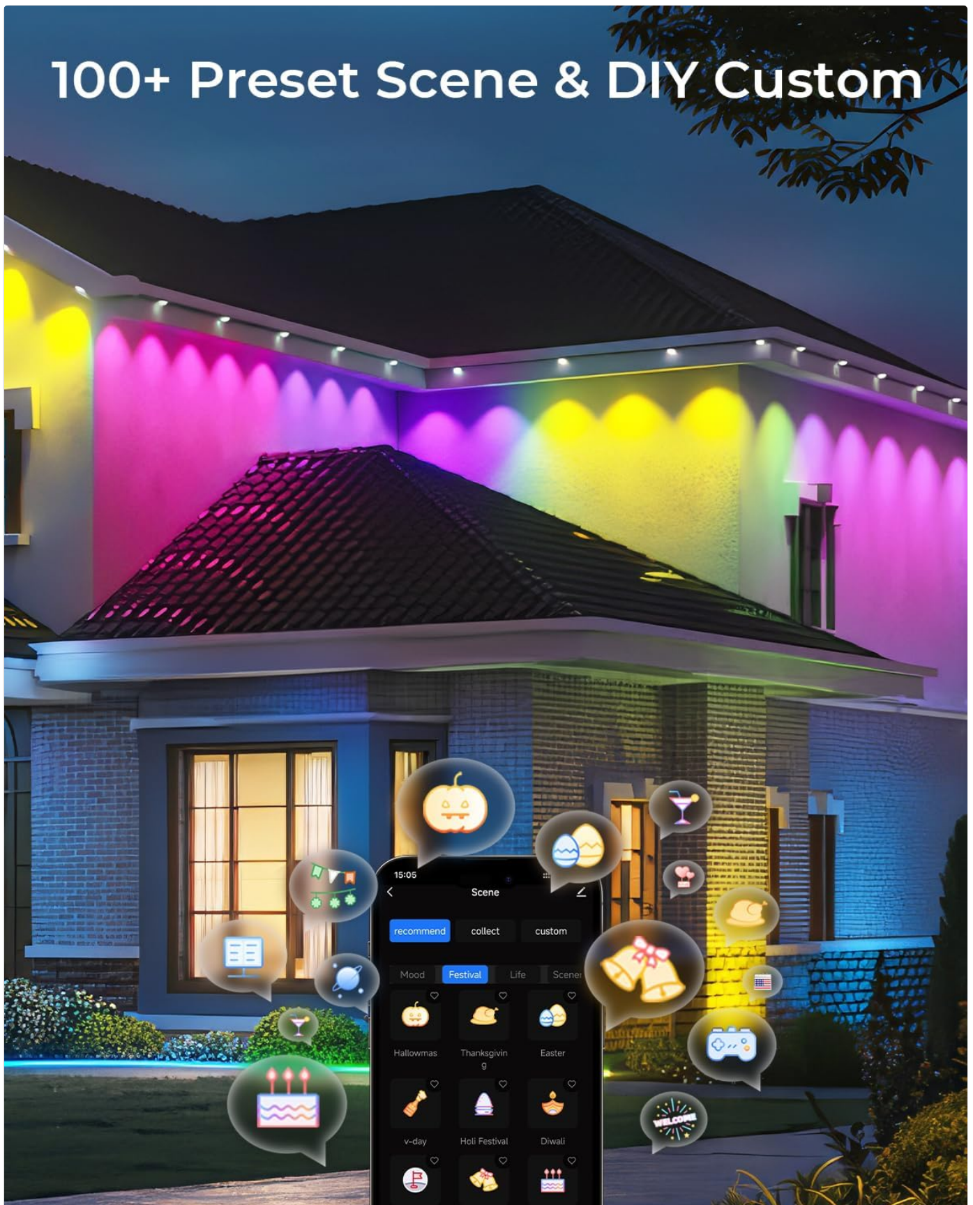
Image: A smartphone displaying the Smart Life App interface, showing options for color selection, brightness adjustment, and scene modes for the Permanent Outdoor Lights.

Your browser does not support the video tag.