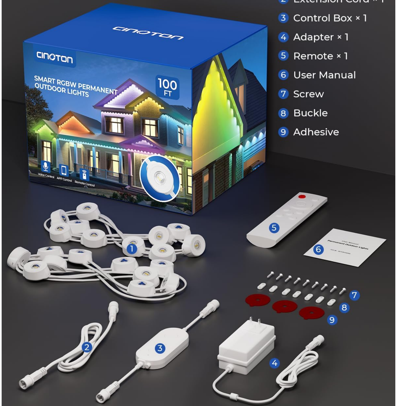
Image: All components included in the CINOTON Permanent Outdoor Lights 100ft package. This includes four 25ft light segments, a control box, power adapter, remote control, extension cable, and installation hardware.