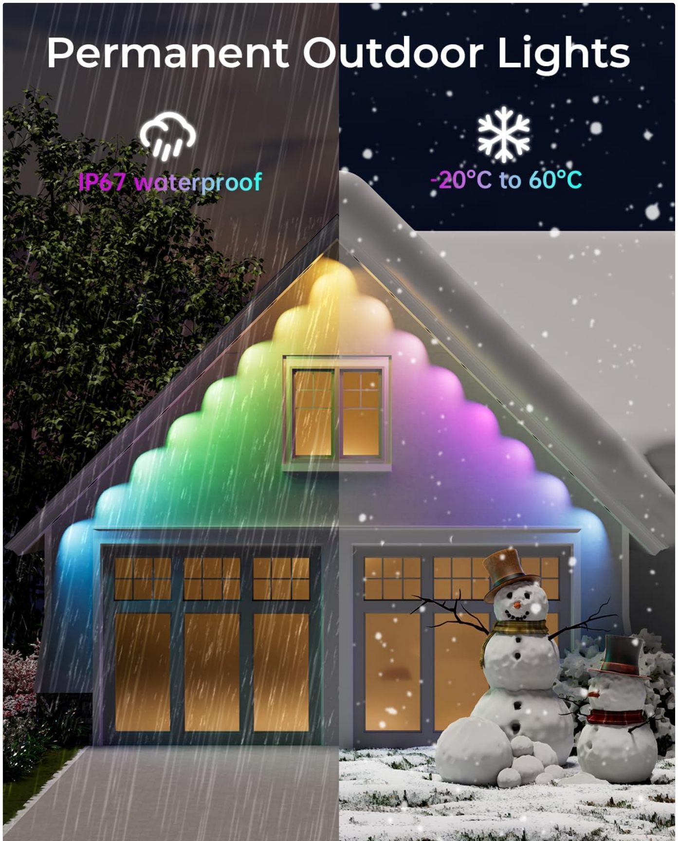
Image: The Permanent Outdoor Lights are shown installed on a house during rain and snow, highlighting their IP67 waterproof rating and ability to withstand extreme temperatures from -20°C to 60°C.