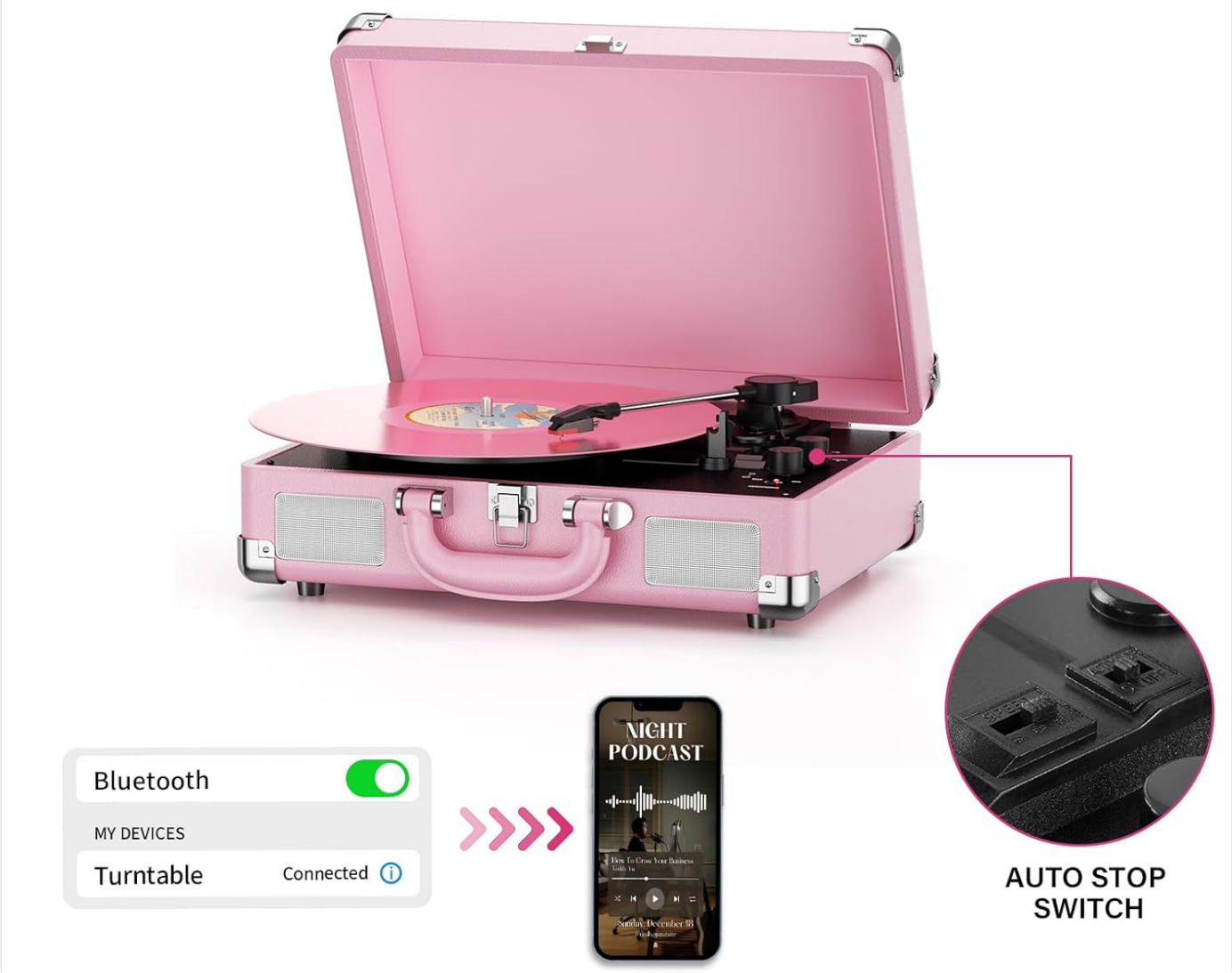
Figure 1: Top-down view of the record player's controls and components.

Turn on the AUTO STOP switch, the turntable stop spinning automatically, then turn on the power button to see the blue LED flashing, finally find the device :Turntable from your mobile to connect your phone to play your favorite music via Bluetooth.