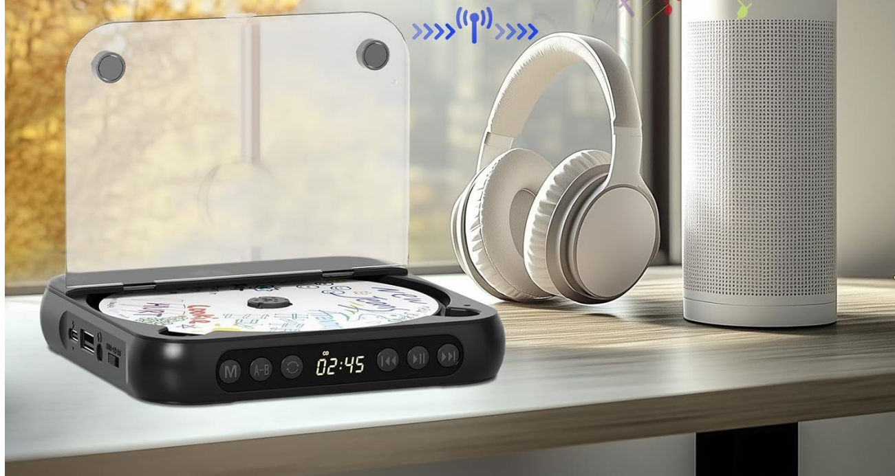
Image: The SKYANS CD player uses Bluetooth 5.3 to transmit audio to wireless headphones or a Bluetooth speaker.