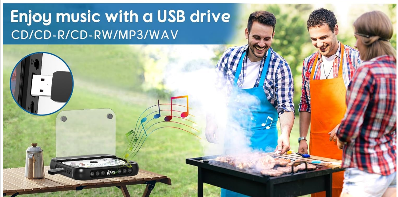
Image: The portable CD player supports USB drive playback for MP3/WAV files, allowing users to enjoy music from a USB stick.