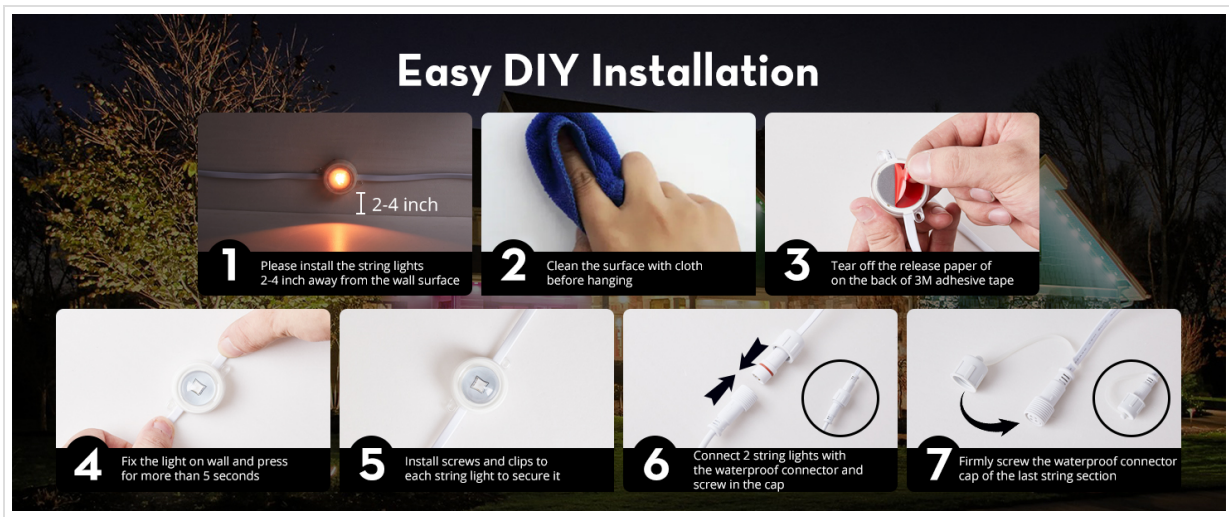
Image: Demonstrates the 100° focus lens angle and more than 16 inches of wall washing depth, advising installation 2-4 inches from the wall for best effect.