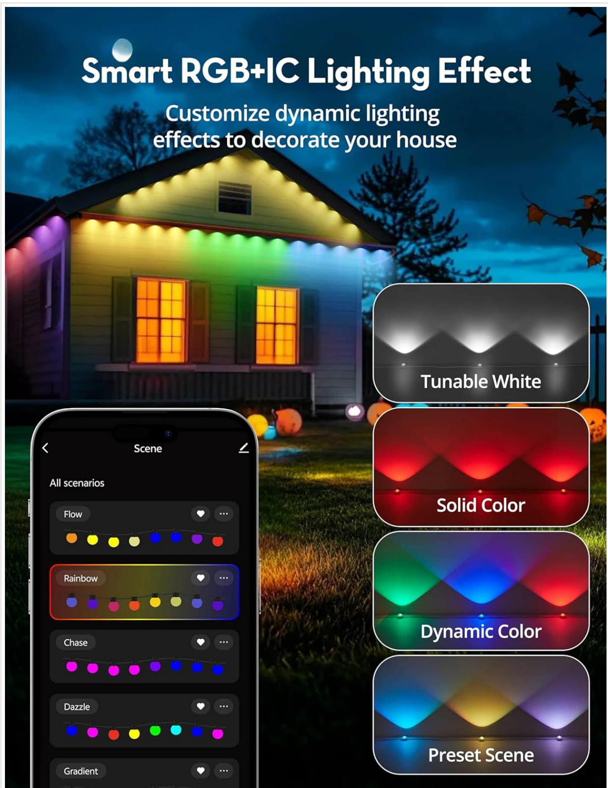
Image: Shows the Smart Life app interface for customizing dynamic lighting effects, including tunable white, solid color, dynamic color, and preset scenes.