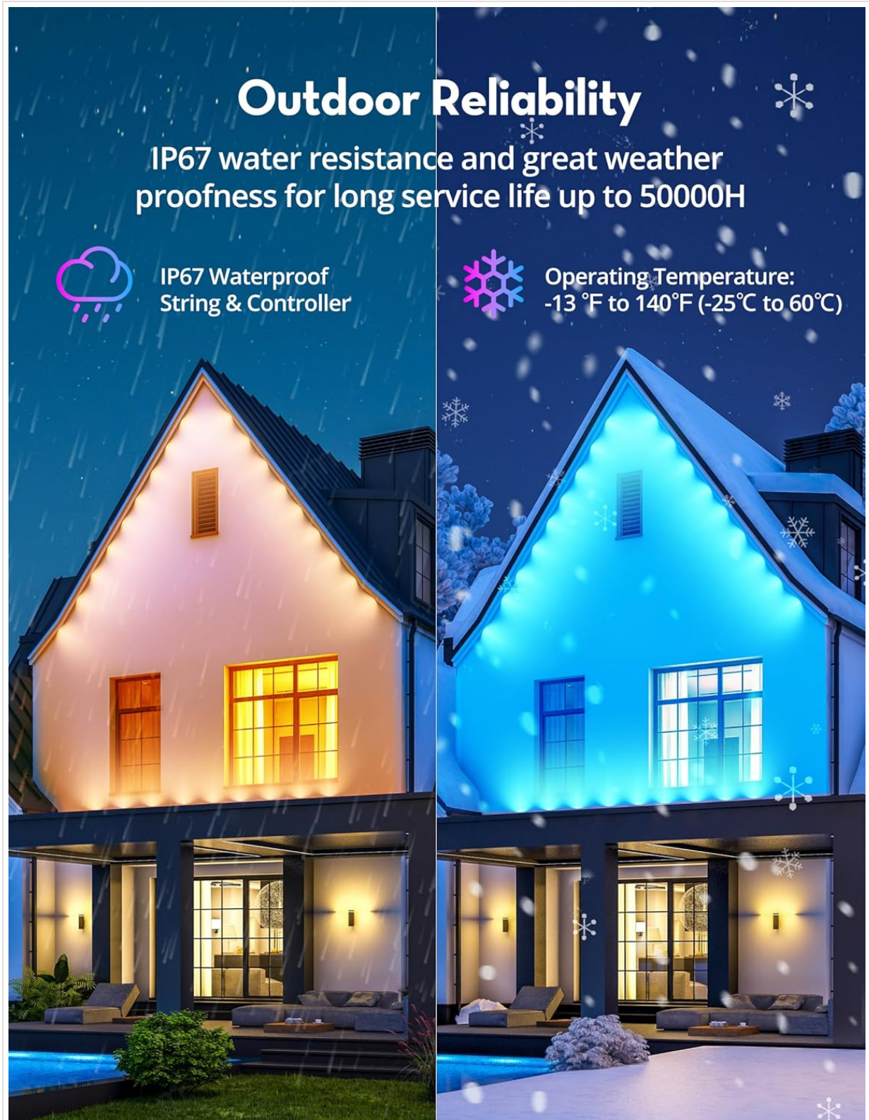
Image: Highlights the outdoor reliability of the lights, showcasing IP67 waterproof string and controller, and an operating temperature range from -13°F to 140°F.