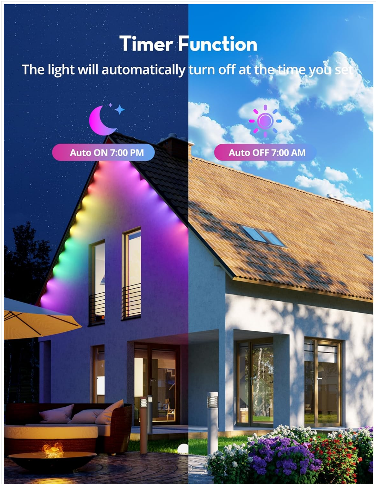
Image: Depicts the timer function, showing lights automatically turning on at 7:00 PM and off at 7:00 AM.

Set specific times for the lights to automatically turn on and off using the Smart Life app. This feature helps conserve energy and provides convenience.