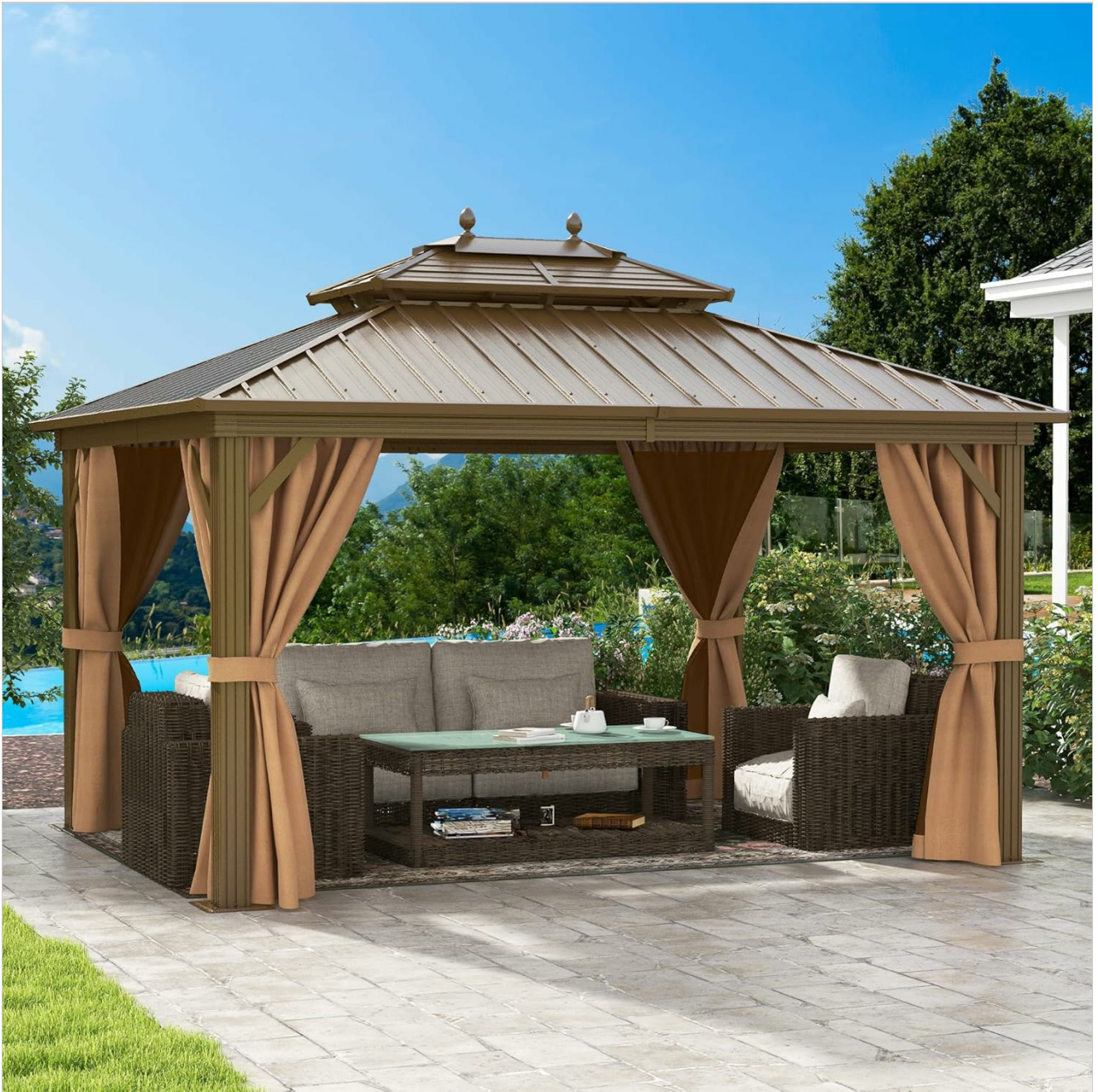
Image 2.1: The DWVO 10x12ft Hardtop Gazebo with its double roof and sidewalls.