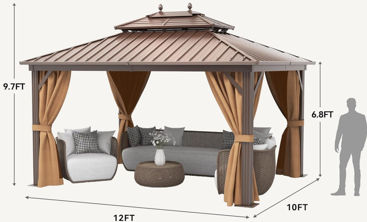
Image 2.6: A diagram illustrating the overall dimensions of the 10x12ft gazebo.