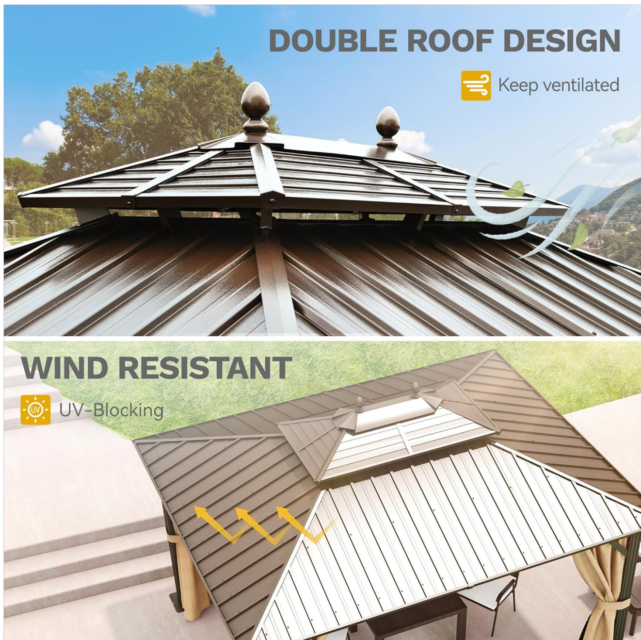
Image 2.4: Detail of the double roof design, highlighting ventilation and wind resistance.