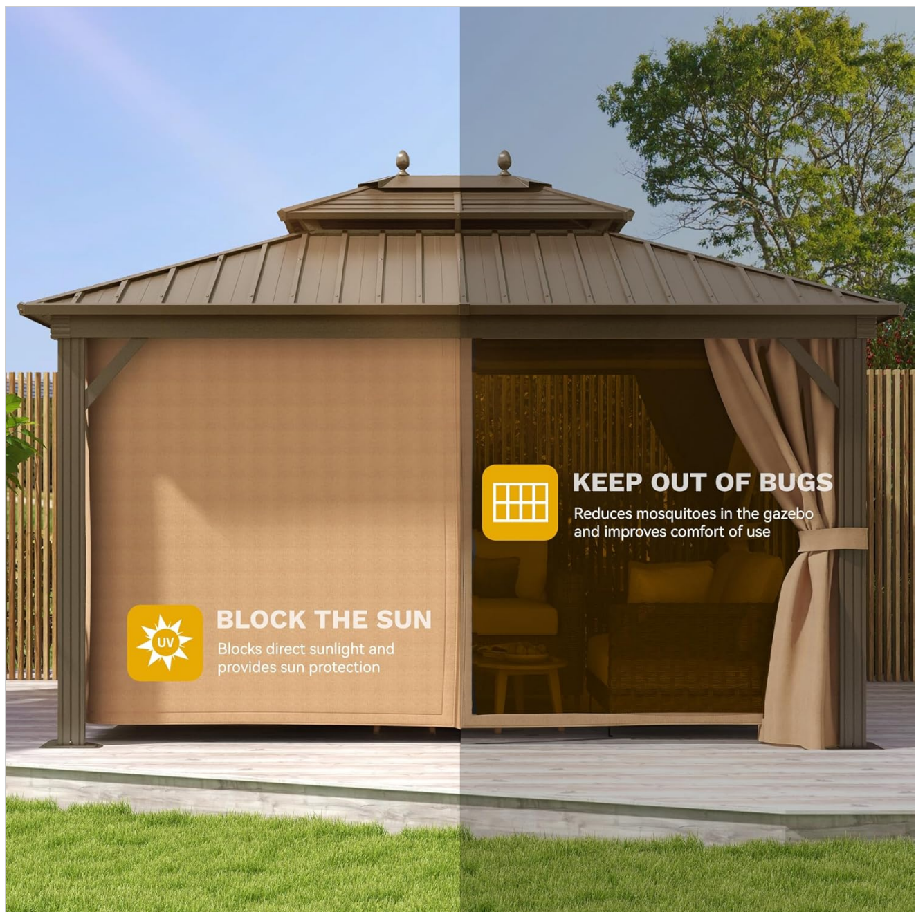
Image 2.3: The gazebo's ability to block sun and keep out bugs with its sidewalls.