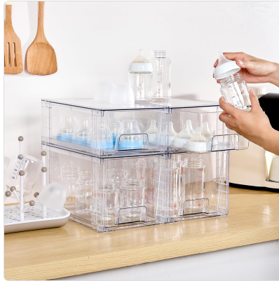
Image: Drawers used to store baby bottles and feeding accessories on a kitchen counter.