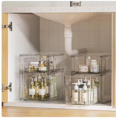
Image: Drawers neatly organizing items under a bathroom sink.