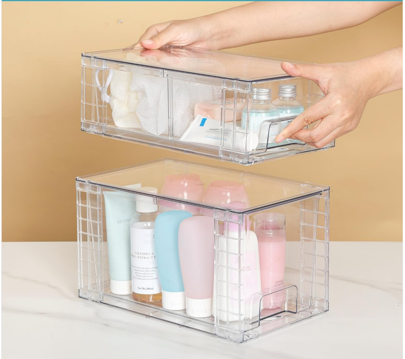
Image: Demonstrates how the drawers can be stacked securely to optimize vertical storage space.