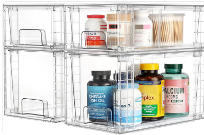
Image: Drawers organizing various medicine bottles and health supplies.