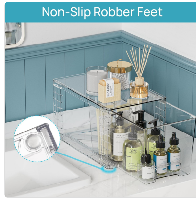
Image: Close-up of the non-slip rubber feet providing stability to the drawer unit.