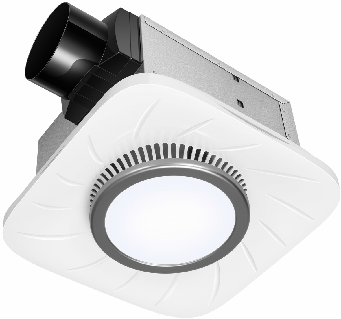
Image 1.1: VIVOHOME Bathroom Exhaust Fan with Light installed in a modern bathroom ceiling, providing both ventilation and illumination.