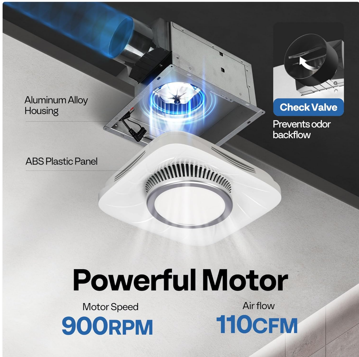
Image 3.1: Internal view of the fan, illustrating the aluminum alloy housing, ABS plastic panel, and the check valve mechanism that prevents backflow.