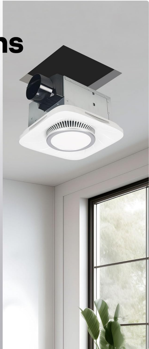
Image 4.1: Detailed dimensions of the fan unit and the recommended ceiling opening for installation.