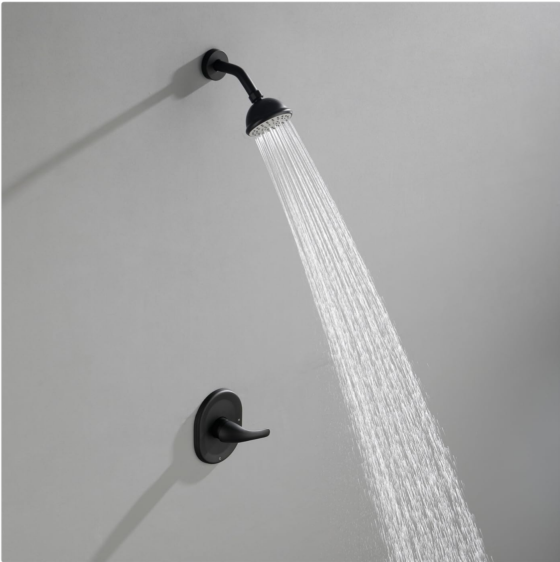
Image: The WELLFOR shower head actively spraying water, illustrating its function and coverage.