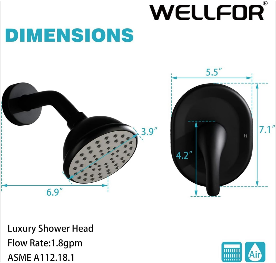
Image: Diagram showing the approximate dimensions of the WELLFOR shower head and valve trim