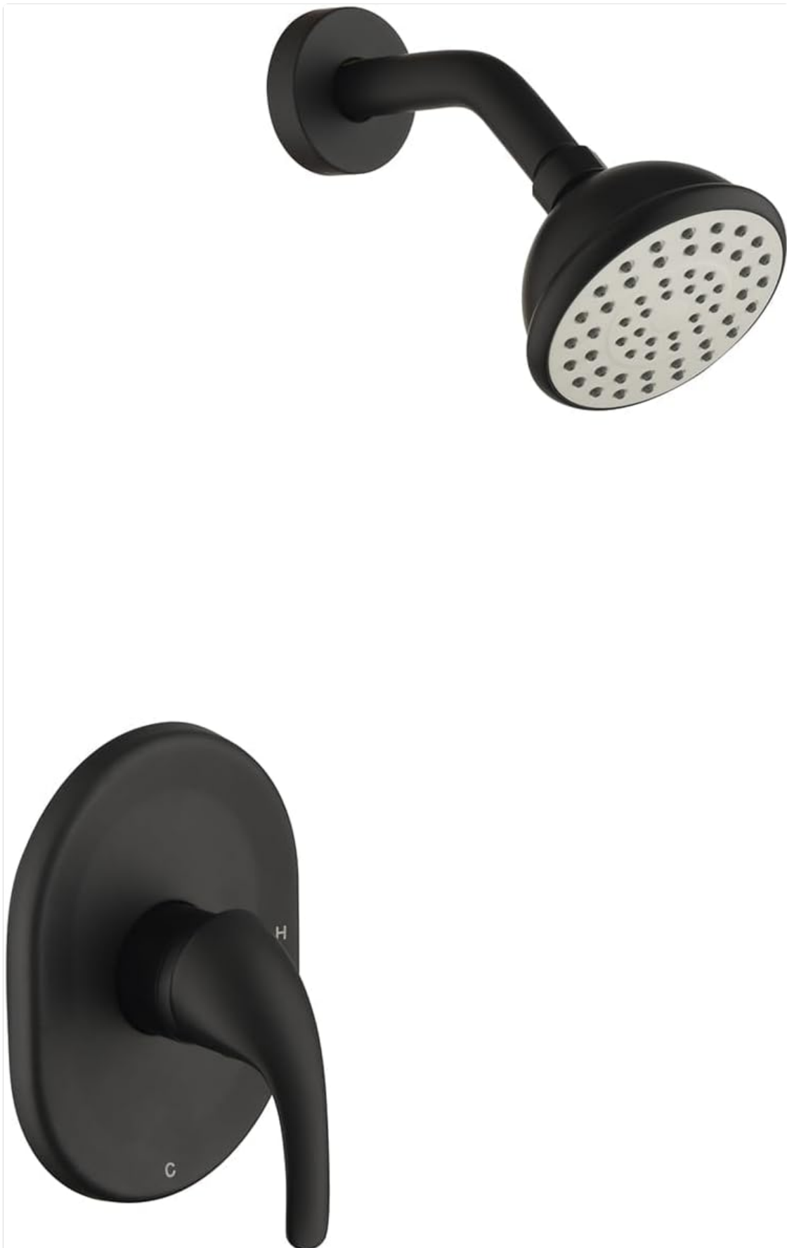
Image: Main components of the WELLFOR Pressure Shower Head Combo, including the shower head, shower arm, and single-handle valve trim.