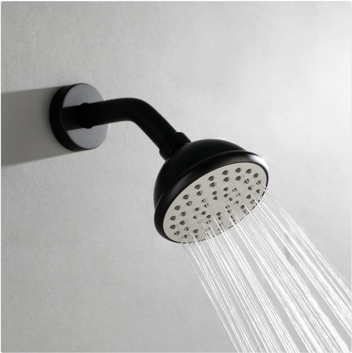
Image: A fully installed WELLFOR shower head and valve trim, demonstrating the product in a bathroom setting.