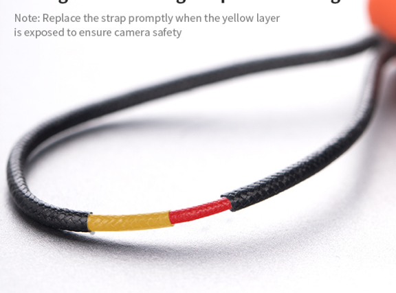
Image: Cross-section of the Dyneema fiber showing the load-bearing, warning, and wear-resistant layers.

Note: Replace the strap promptly when the yellow layer is exposed to ensure camera safety