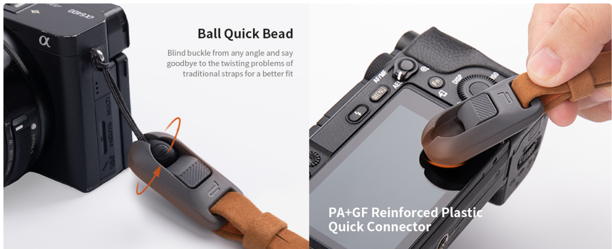
Image: Step-by-step illustration of attaching the quick release bead to a camera's strap eyelet.