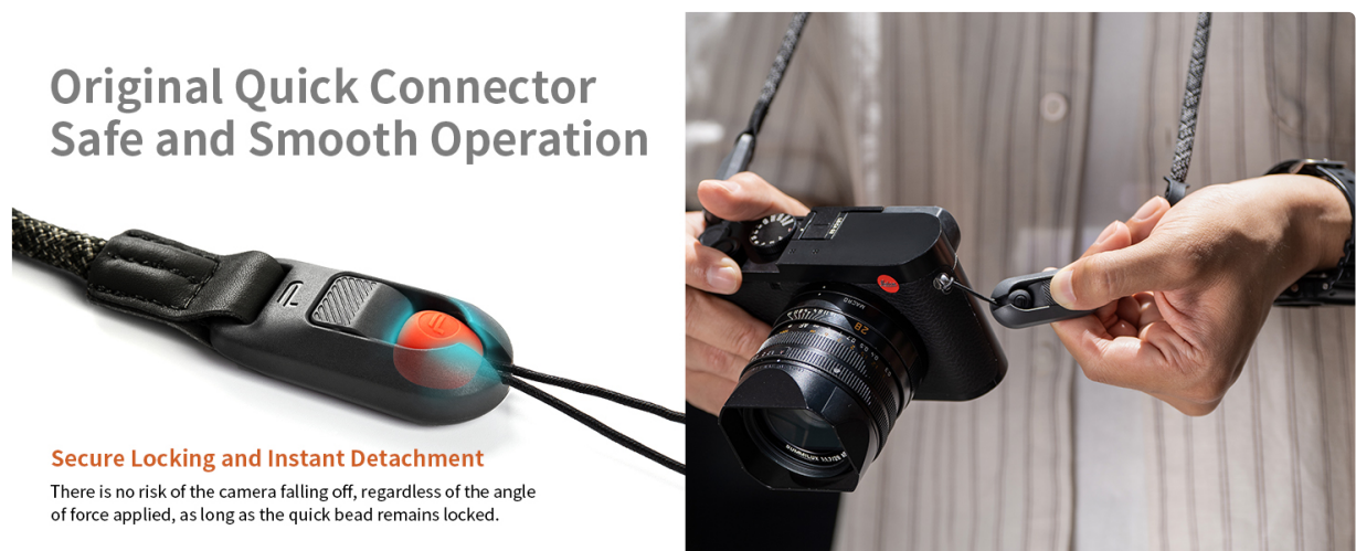
Image: Detailed view of the quick connector for secure attachment.