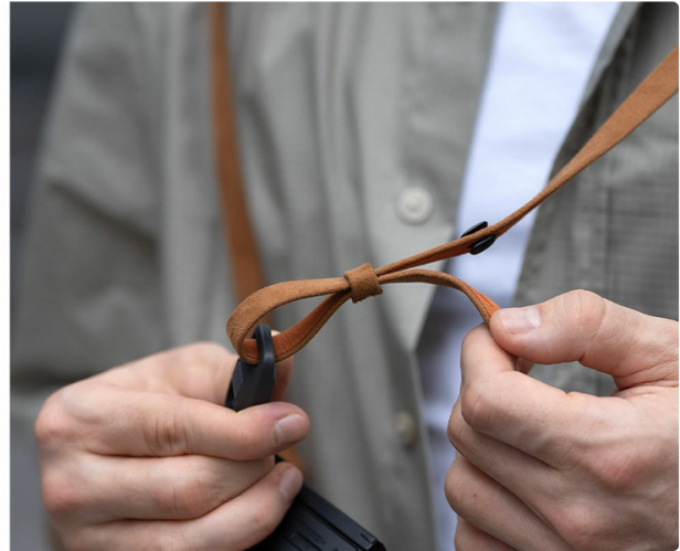
Image: The strap's flexible length adjustment mechanism with multiple button settings.