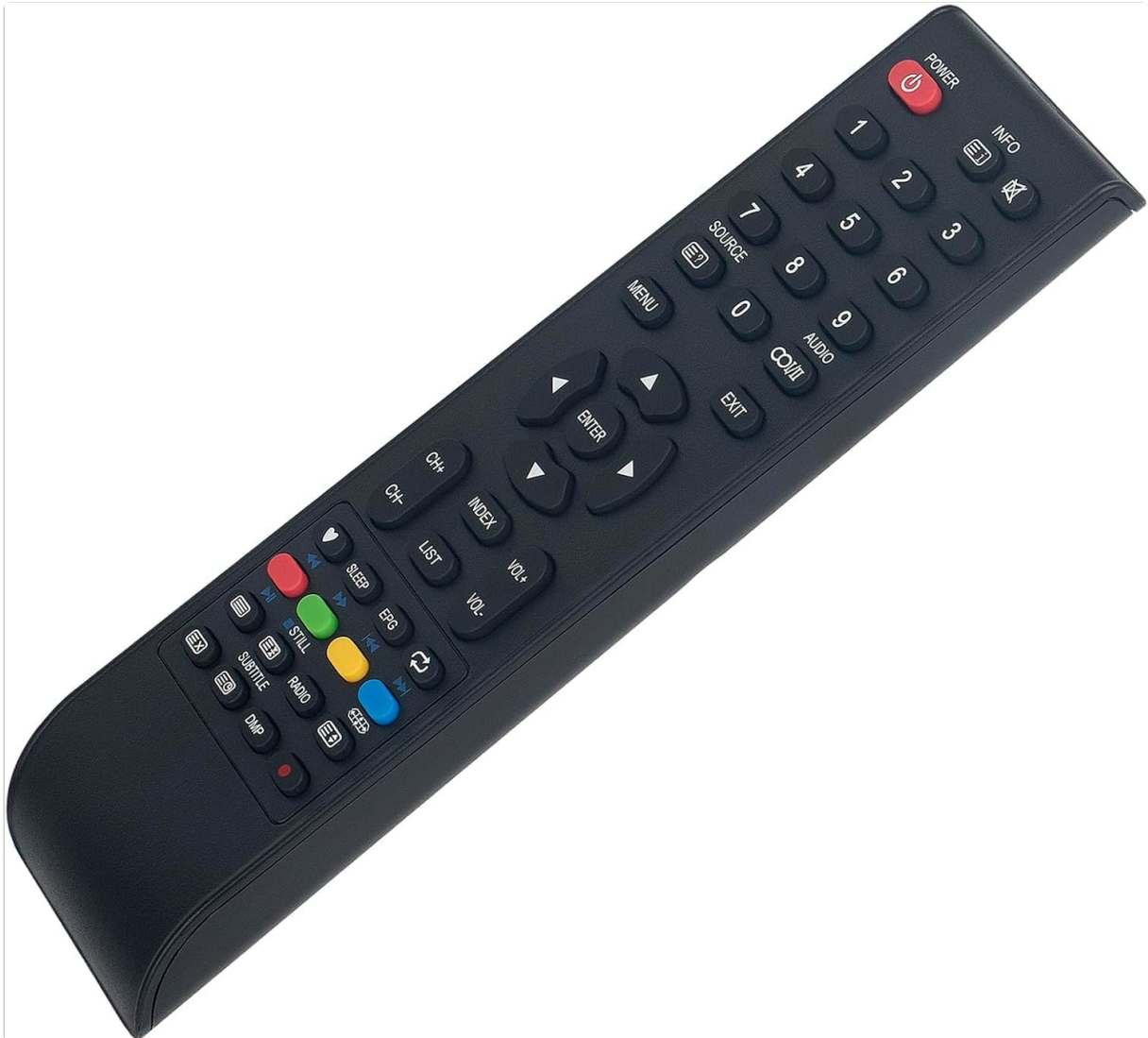
Image 2: Angled view of the ALLIMITY remote control, highlighting its ergonomic shape and button layout.