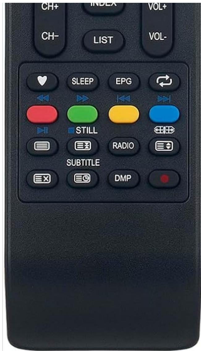
Image 4: Detailed view of the ALLIMITY remote control, highlighting the function of each button.