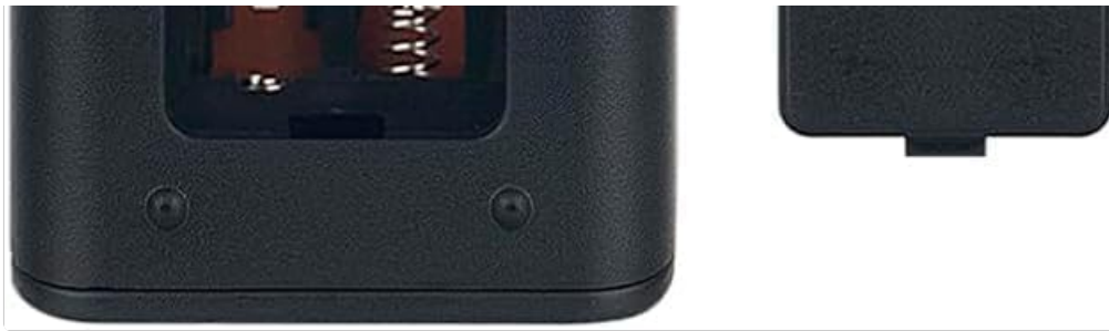
Image 3: Rear view of the ALLIMITY remote control with the battery compartment open, showing where to insert two AAA batteries.