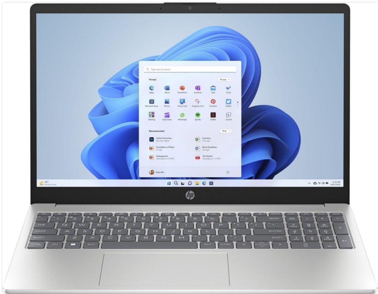
Image: The HP 15.6-inch Touch-Screen Laptop displaying the Windows 11 Start Menu, illustrating the main screen and keyboard layout.