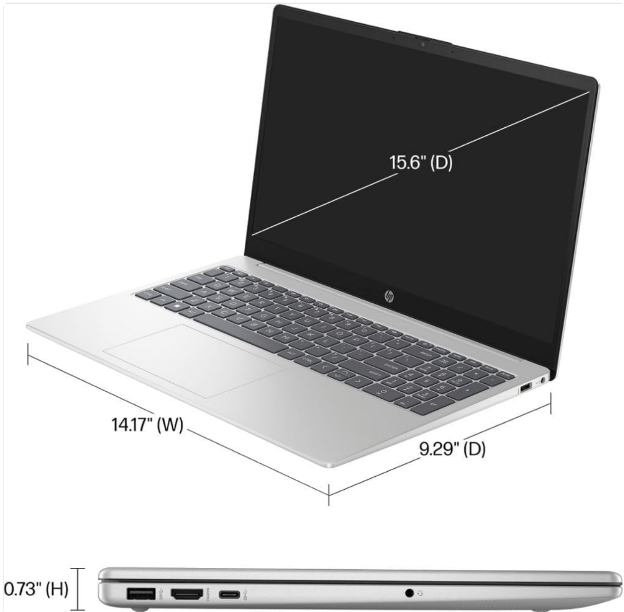
Image: A diagram illustrating the physical dimensions of the HP 15.6-inch Touch-Screen Laptop, including screen size, width, depth, and height.

Detailed technical specifications for the HP 15.6-inch Touch-Screen Laptop 15-fc0025dx.