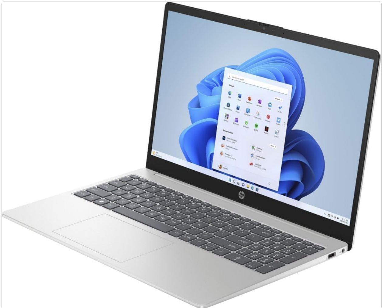
Image: An angled view of the HP 15.6-inch Touch-Screen Laptop, showcasing its slim profile and keyboard.