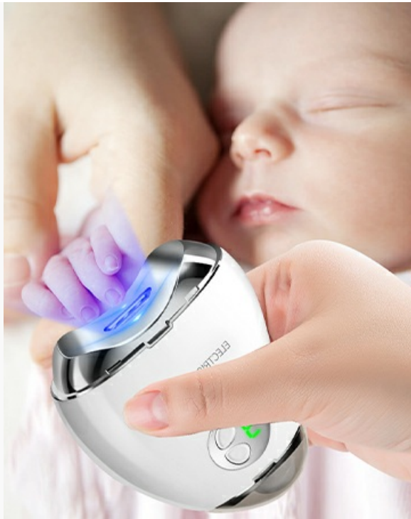
Image: Shows the automatic nail chip storage feature, which collects clippings for easy disposal.