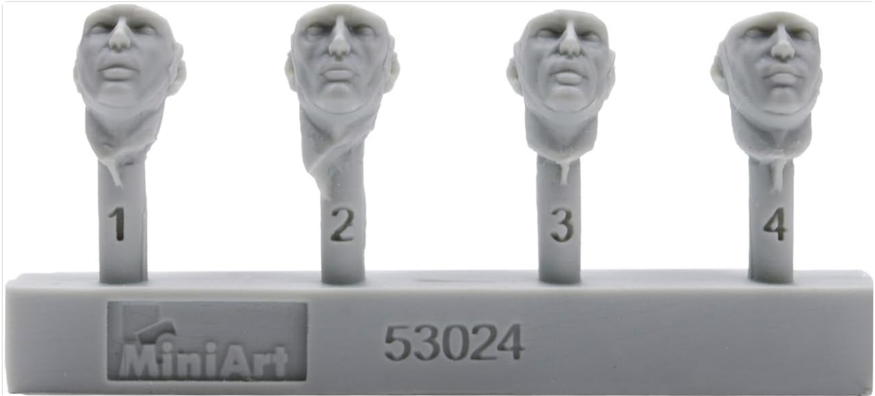
Figure 2: Sprue containing the four resin heads (numbered 1-4) for the figures. These heads offer superior detail compared to standard plastic.