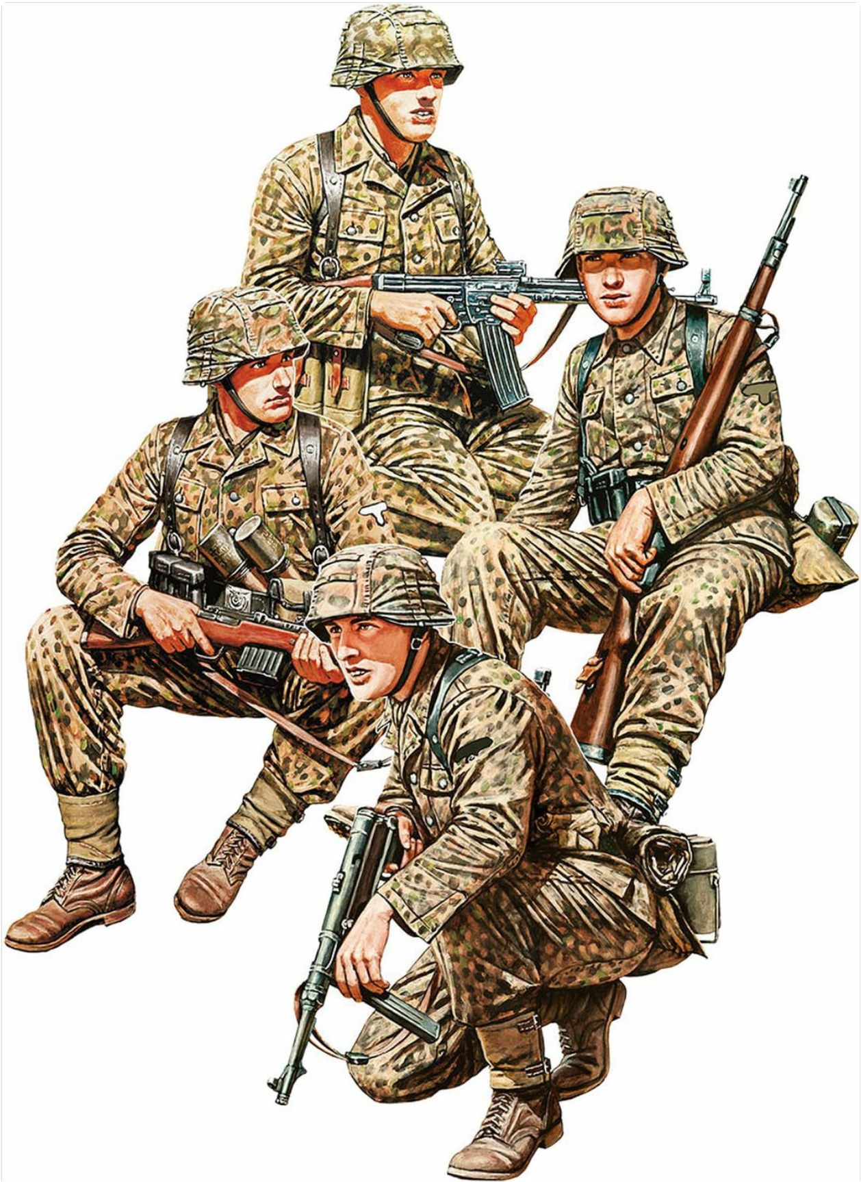
Figure 1: Box art for MiniArt MIN53024 German Tank Riders Set 2. This image displays the completed figures and the kit's branding.