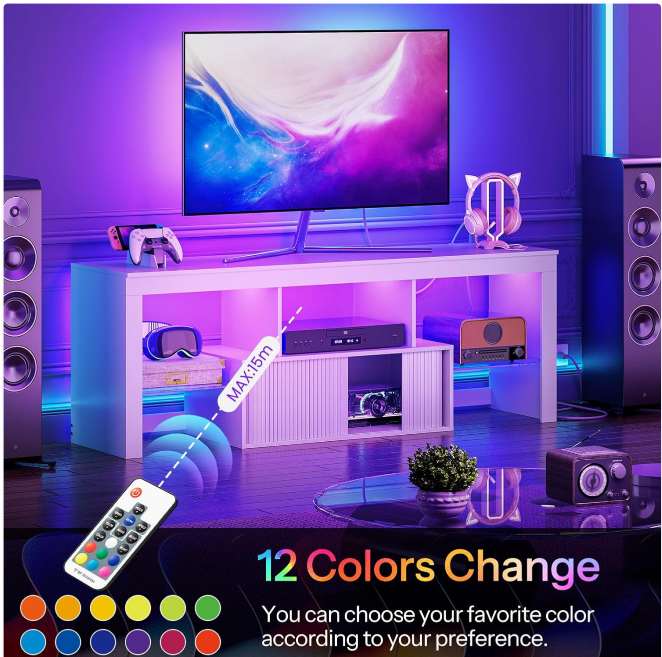
Image: Remote control for the LED light strip, offering various color and mode options.