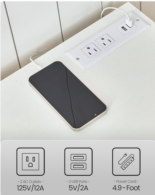
Image: Integrated power outlet with 2 AC outlets and 2 USB ports.