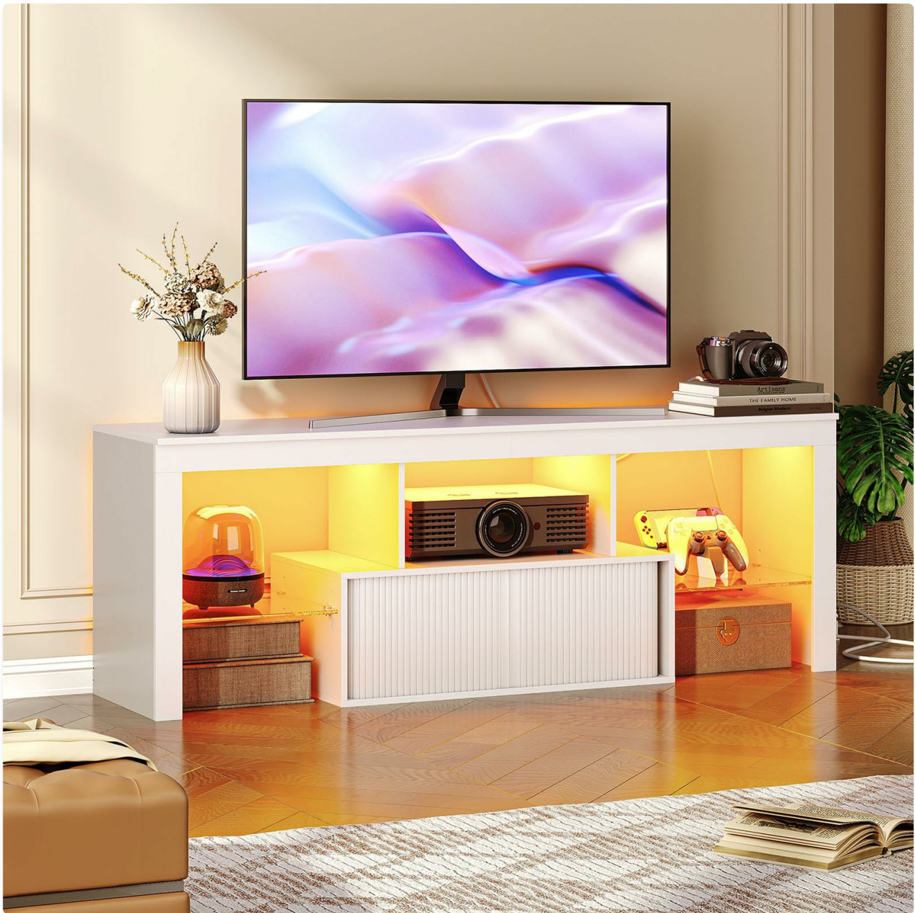
Image: The CHOEZON TV Stand in a living room setting, illuminated by its LED strip.