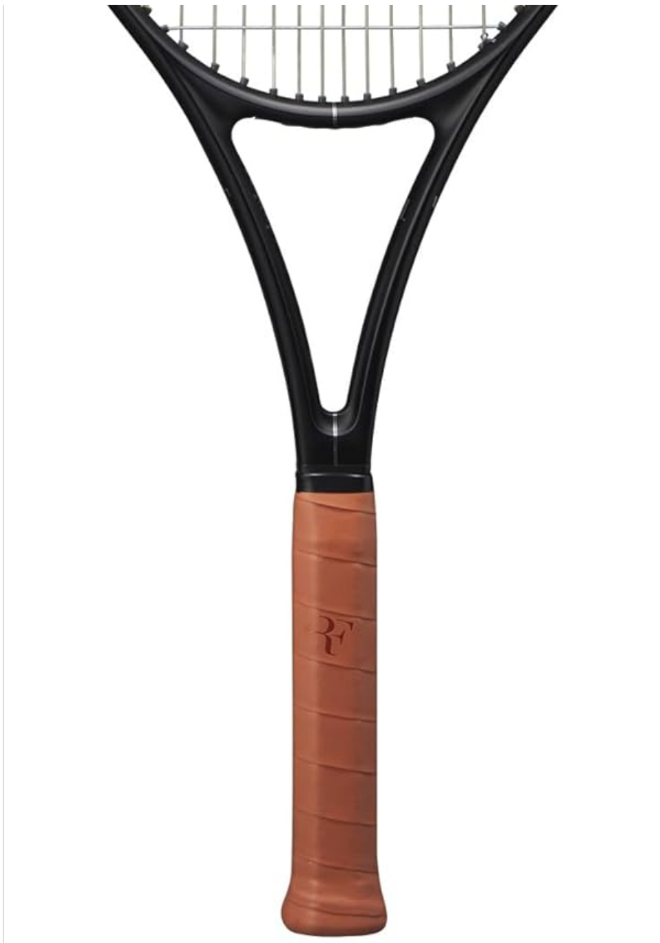
Figure 1: Front view of the Wilson RF 01 Performance Tennis Racket, showcasing its black frame, white strings with red Wilson logo, and brown leather grip.