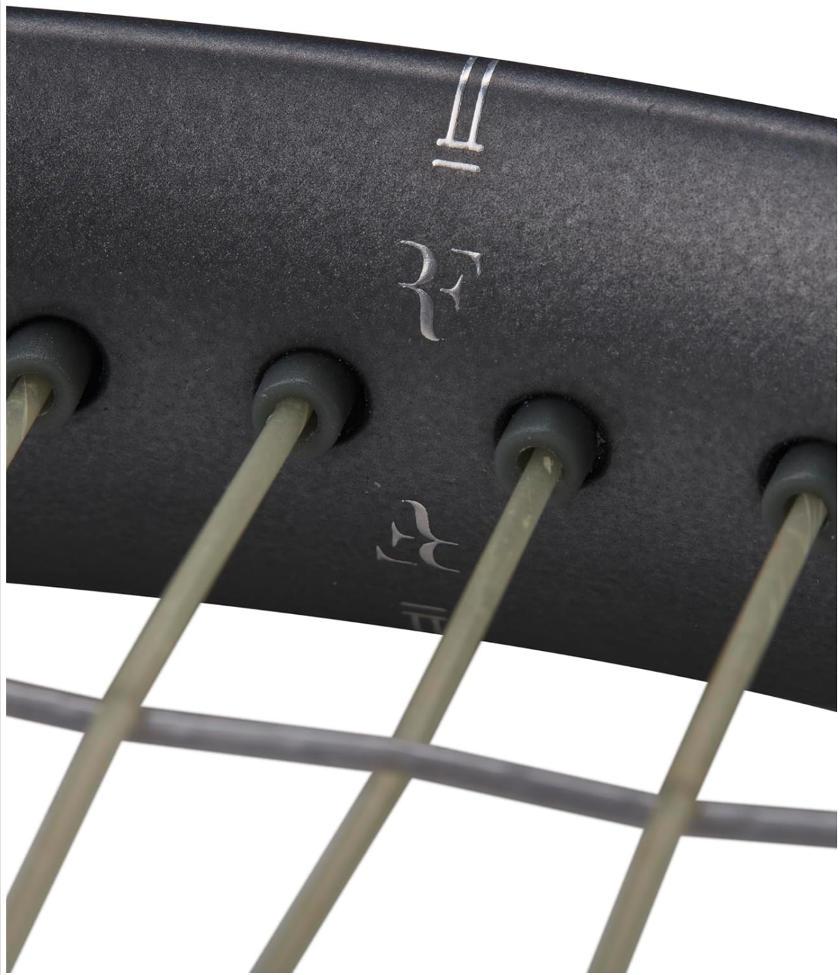
Figure 5: An extreme close-up of the racket's grommets and strings, illustrating the points of contact and potential wear areas.