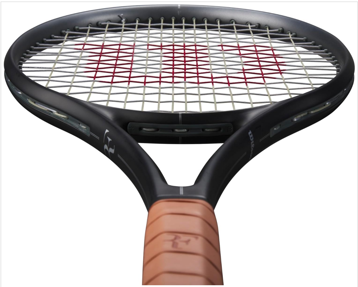
Figure 4: Close-up view of the racket head, highlighting the string pattern and grommets, essential for understanding string interaction and performance.