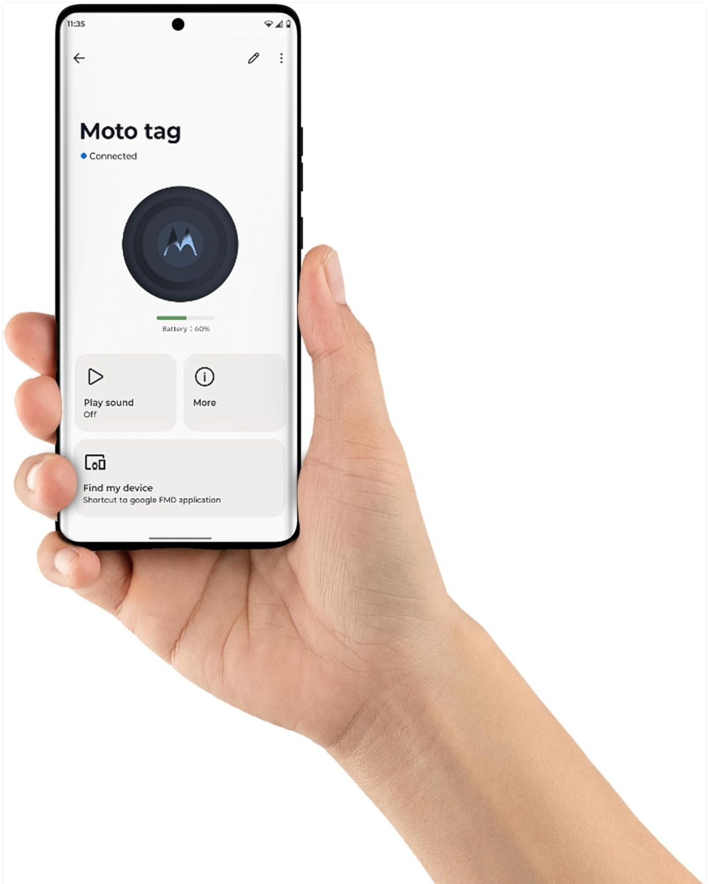
Image: Google Find My Device App Interface. This image shows the user interface of the Google Find My Device app on a smartphone, indicating a connected Moto tag and options like "Play sound" and "Find my device."