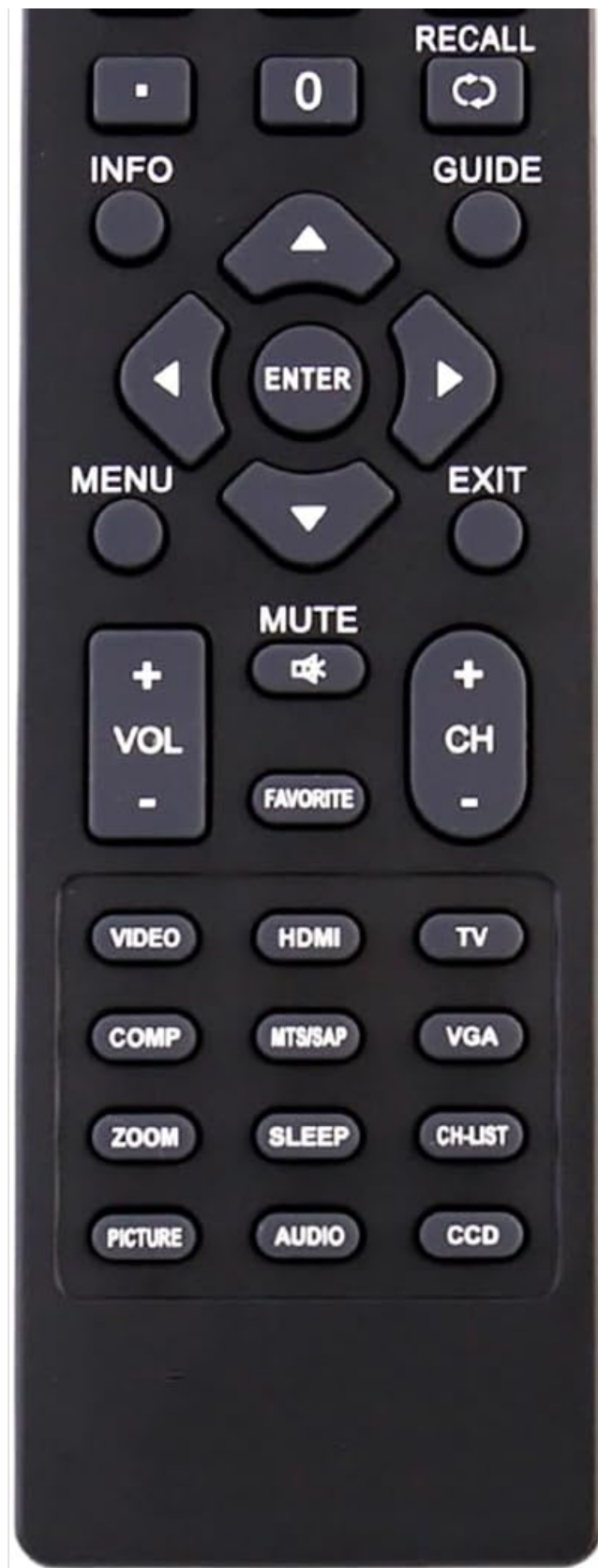
Figure 3: Front view of the AULCMEET DX-RC02A-12 remote control with all buttons labeled.