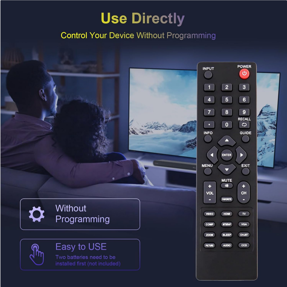
Figure 2: The remote control is ready for immediate use after battery installation, requiring no programming.