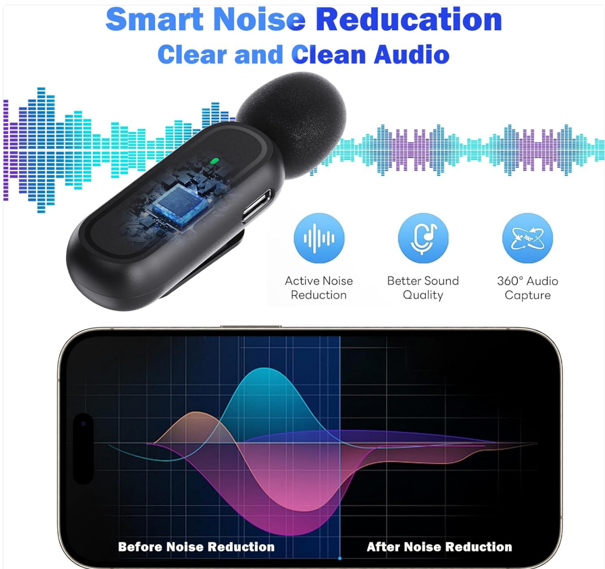
Image: A graphic depicting the smart noise reduction feature, showing a comparison of audio waveforms before and after noise reduction.