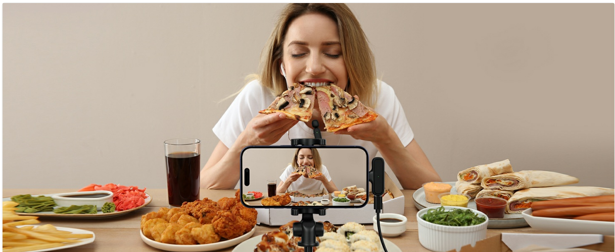
Image: A visual demonstrating the ability to charge a smartphone concurrently while the microphone receiver is plugged in and recording.

The receiver allows for simultaneous charging of your device while recording, ensuring uninterrupted use during long sessions.