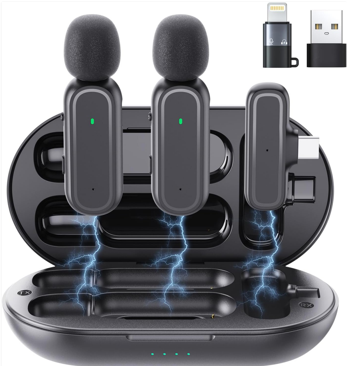
Image: The vojump DT625 wireless lavalier microphone system, showing two transmitters, one receiver, and the charging case.