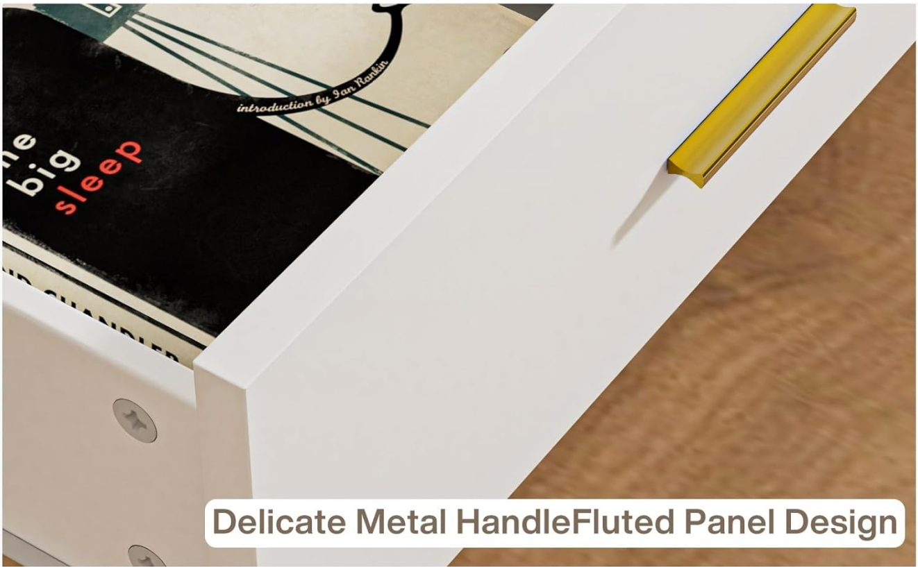
Delicate Metal Handle Fluted Panel Design