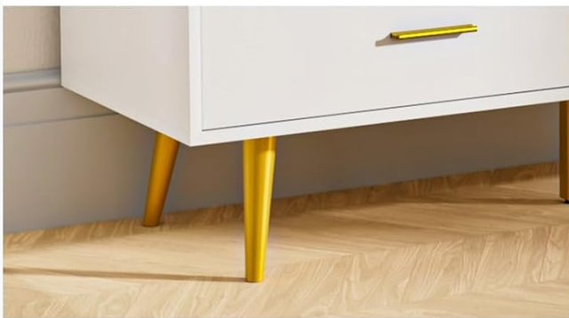
Stable Support Legs