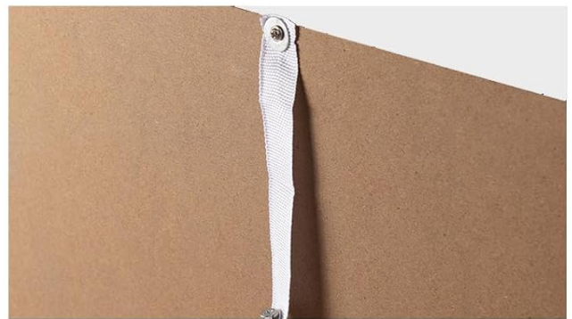
Prevent Tip-over Kit

Image: Detailed view highlighting the delicate gold metal handles, stable support legs, and the included anti-tip kit for enhanced safety.