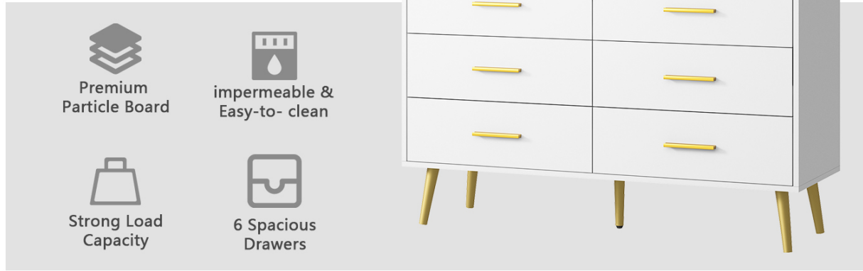
Image: A visual representation emphasizing the dresser's six drawers, designed to meet various storage needs for items like clothing, paper, and books.