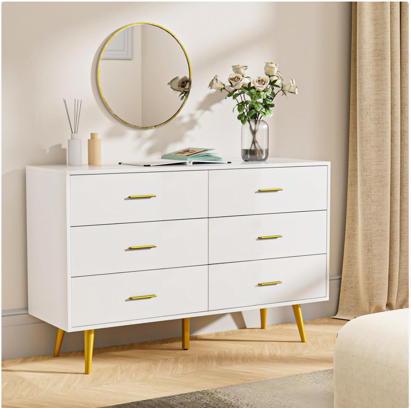
Image: The CARPETNAL White 6-Drawer Dresser, featuring a clean white finish and elegant gold metal handles, positioned in a modern bedroom setting.