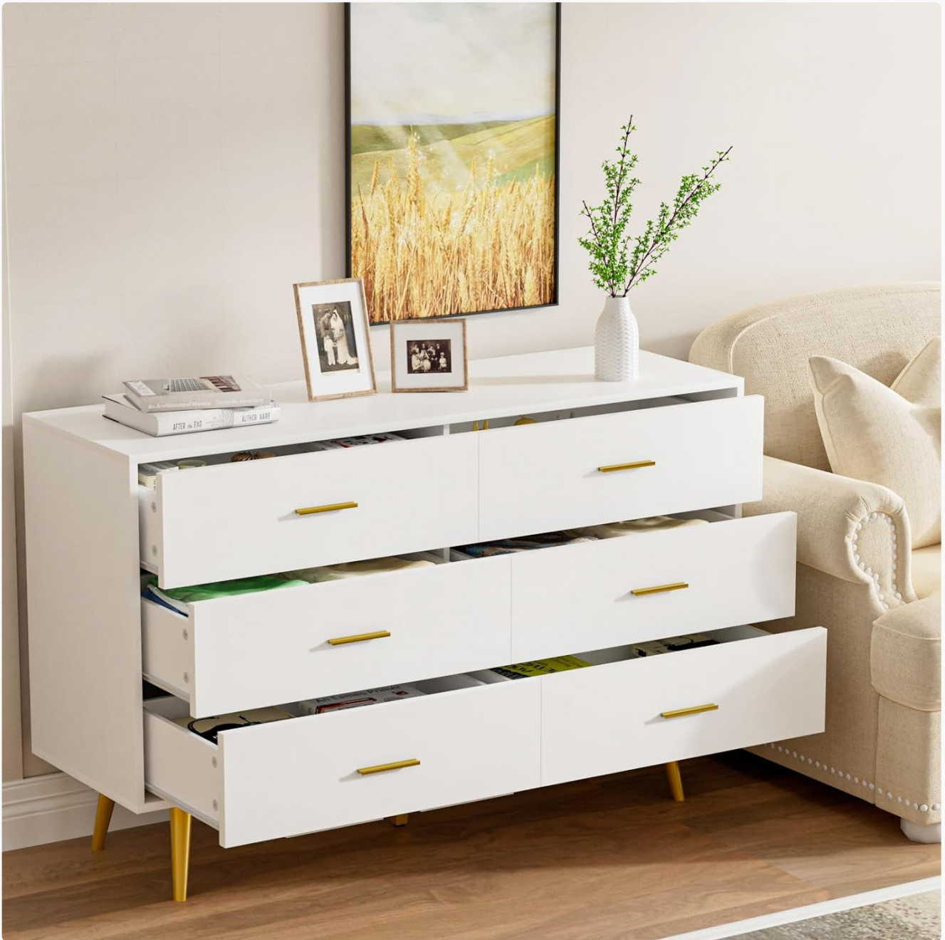
Image: The white dresser with three drawers partially open, showcasing the ample storage space available for various items.