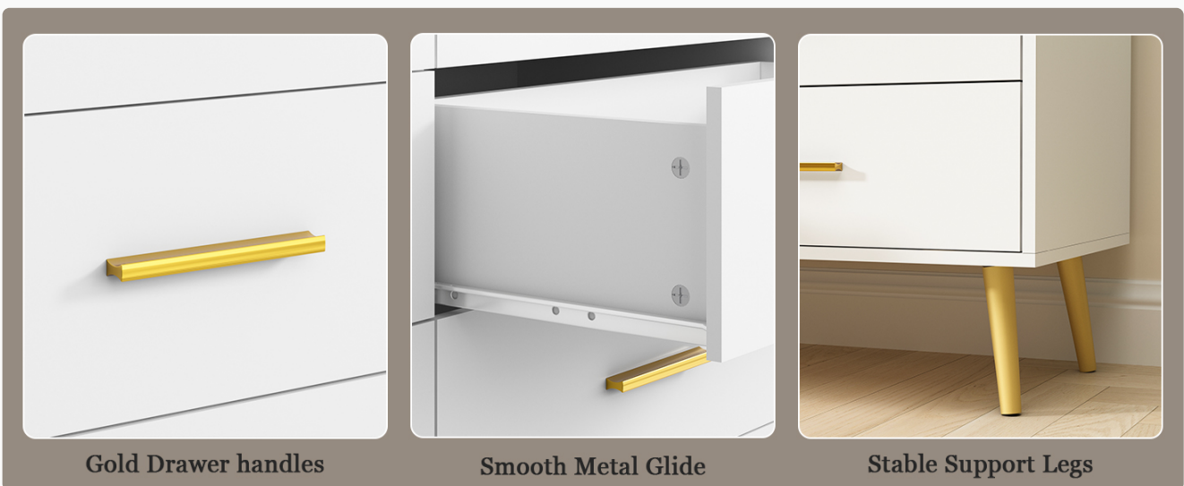
Gold Drawer handles

Image: Detailed view highlighting the delicate gold metal handles, stable support legs, and the included anti-tip kit for enhanced safety.