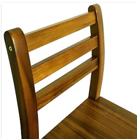
Image: A close-up view of the wooden backrest, highlighting the natural grain and finish of the acacia wood.