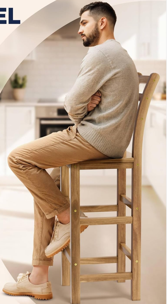
Image: The bar stools shown in different environments, including a modern kitchen, a terrace, and a garden, demonstrating their versatile application.