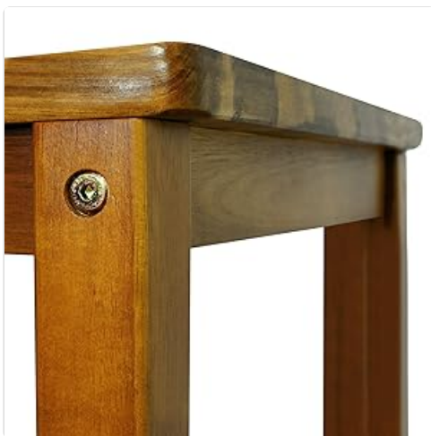
Image: A detailed view of a corner joint, showing the construction and the quality of the wood finish.