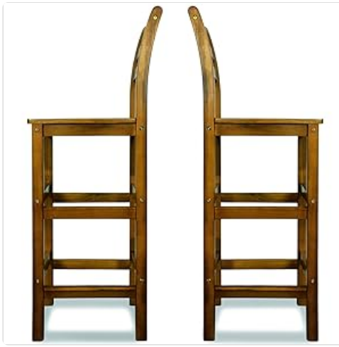
Image: Two fully assembled Casaria Acacia Wood Bar Stools, showcasing their design and the set of two.