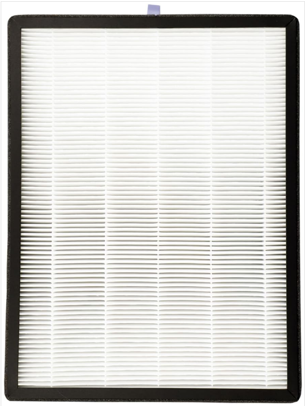
Image 2: Front view of the HEPA filter, showcasing its pleated design for maximum surface area.