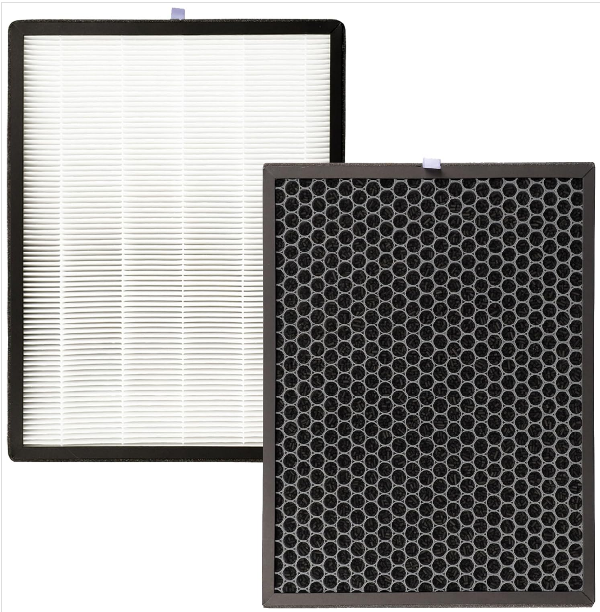
Image 1: The LRFDRESS AP3001/AP3001-FS replacement filter set, showing both the HEPA and Activated Carbon filters.