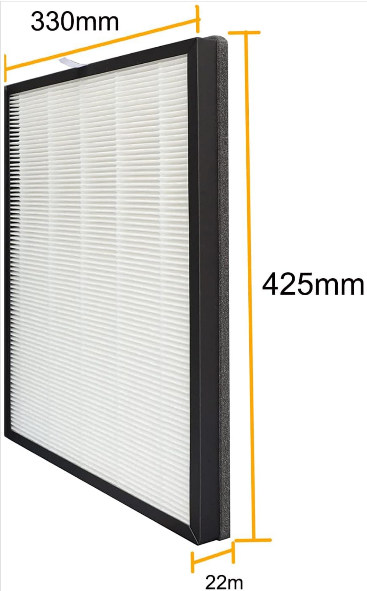
Image 4: Detailed dimensions of the HEPA filter (425mm x 330mm x 22mm).