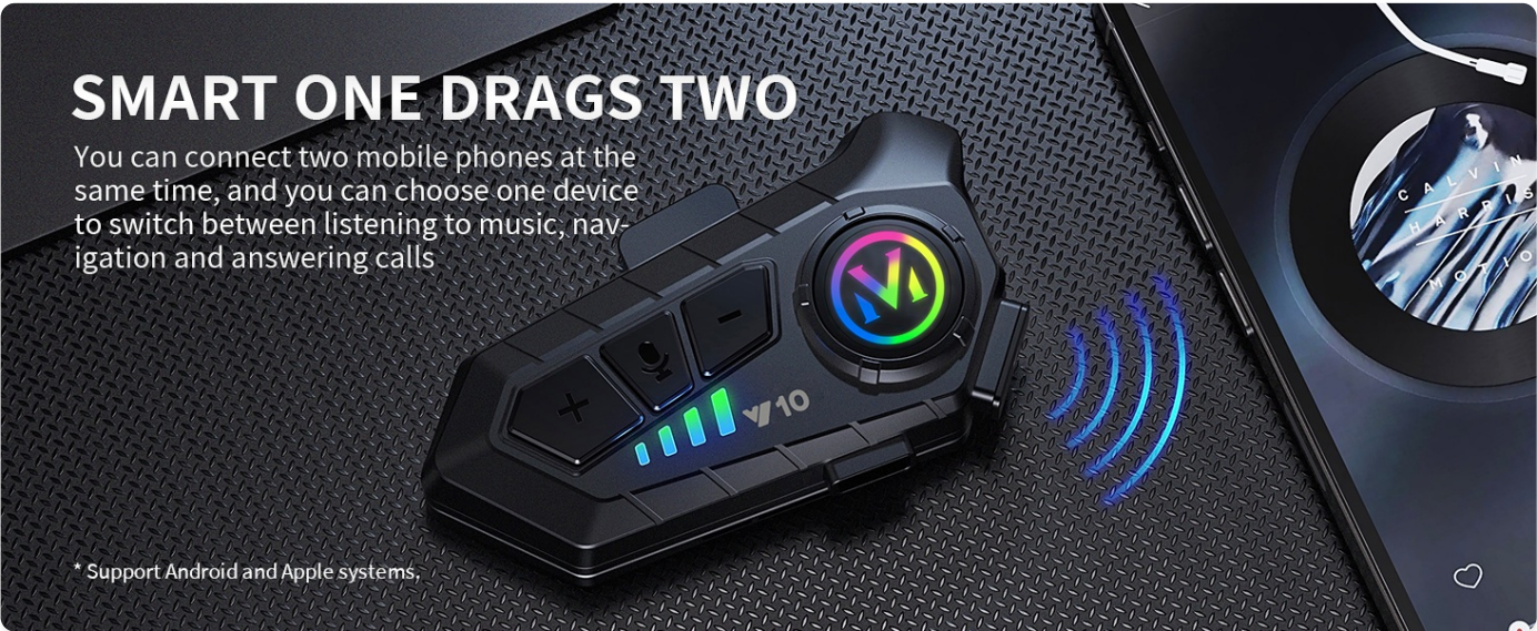
Image: The Y10 headset positioned between two smartphones, illustrating its "Smart One Drags Two" feature, allowing connection to two mobile phones simultaneously.