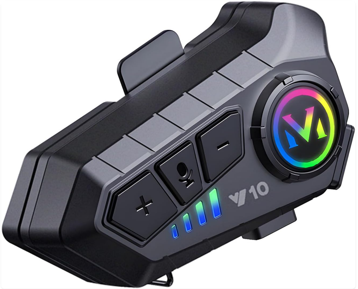
Image: A detailed view of the BTQILEYOO Y10 headset main unit, showing its buttons and colorful indicator light.