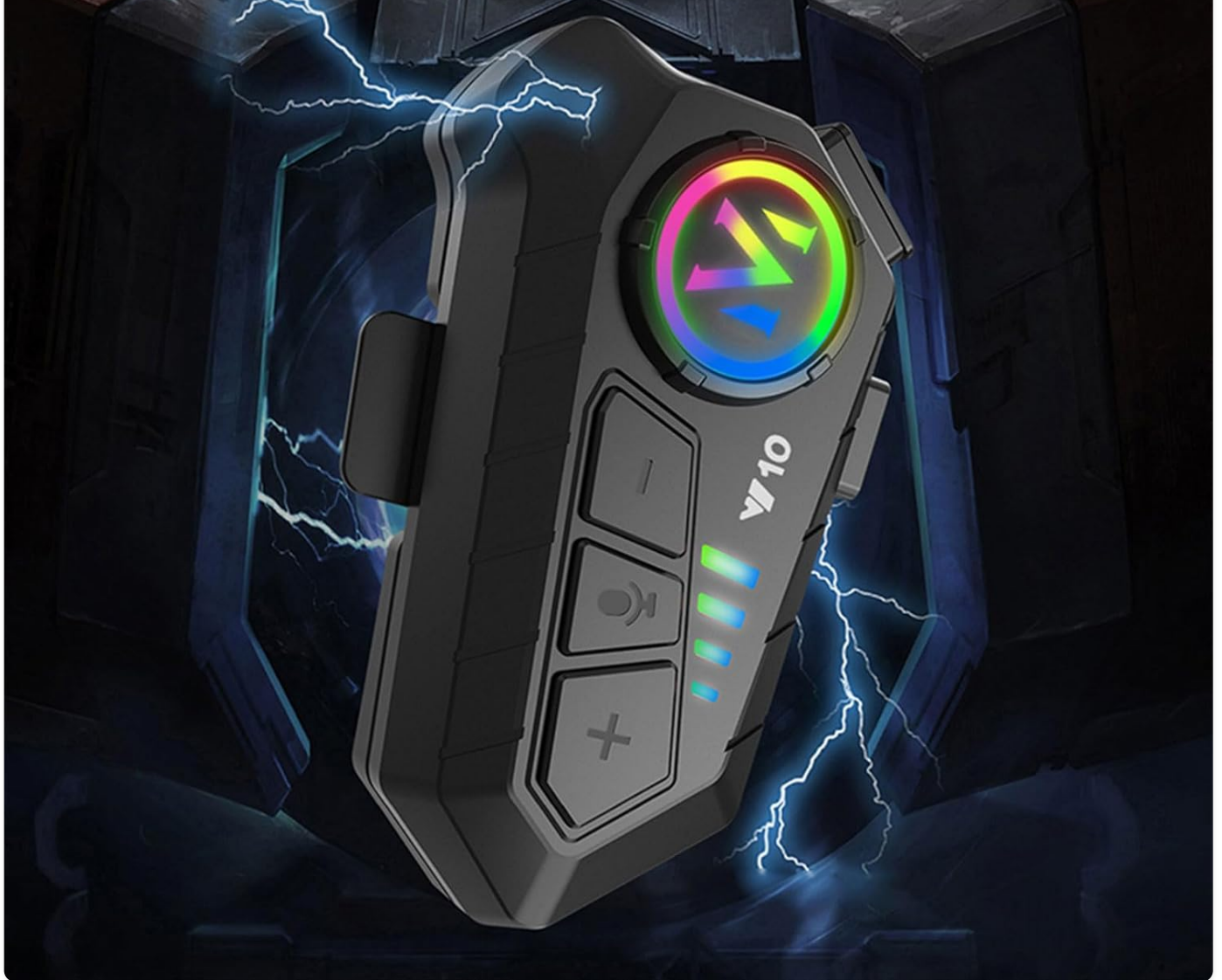
Image: The Y10 headset with lightning bolts, emphasizing its long-lasting battery life and fast charging capabilities.