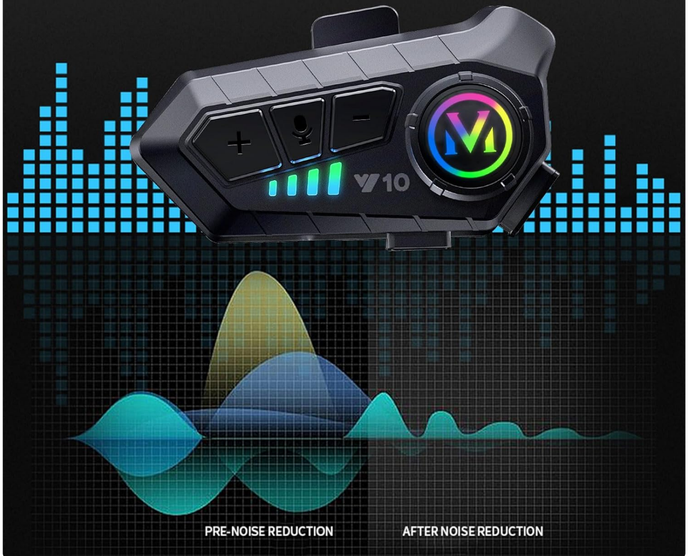
Image: The Y10 headset with sound wave graphics, illustrating its HD sound quality and intelligent noise reduction capabilities, showing pre-noise reduction and after-noise reduction sound profiles.