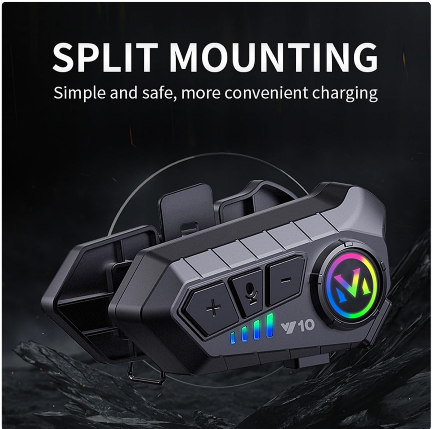
Image: The Y10 headset with its split mounting clip, illustrating simple and safe installation for convenient charging.

The Y10 headset uses a split hanging clip for secure and convenient installation on most motorcycle helmets.