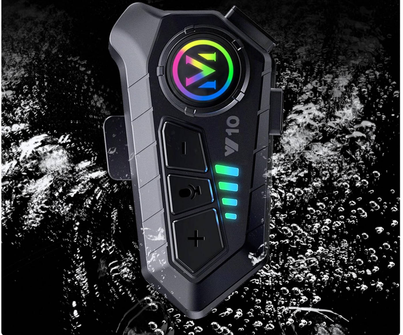
Image: The Y10 headset surrounded by water splashes, highlighting its IPX6 depth waterproof rating.