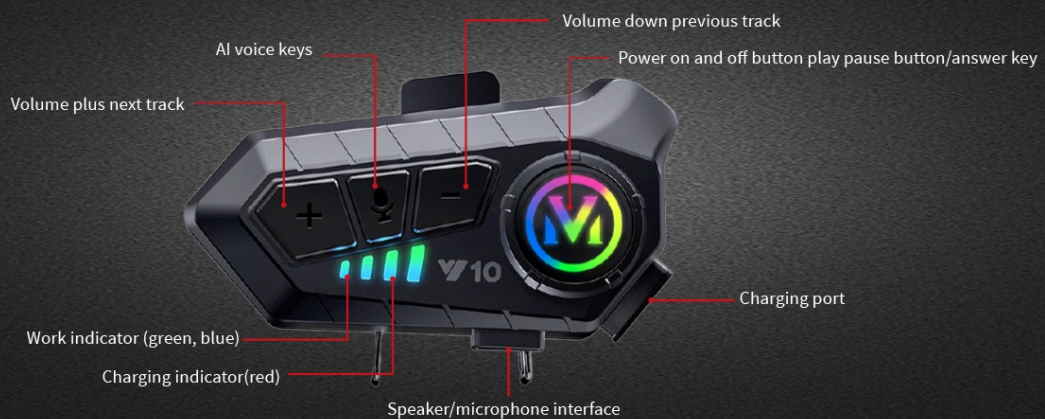
Image: Diagram illustrating the function keys of the Y10 headset, including volume controls, AI voice key, power/play/answer button, charging port, work indicator, charging indicator, and speaker/microphone interface.