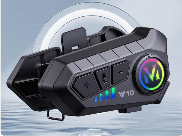
Figure 2.4: The split installation design of the headset for easy and secure mounting.

Continuing classic, split installation, simple, convenient, and safe