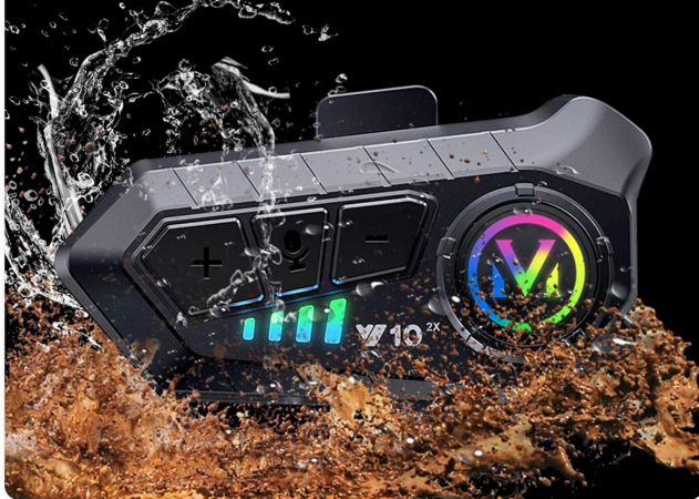
Figure 2.6: The IPX6 waterproof rating ensures the headset is protected against rain and mud splashes.

No need to worry about the rain splash or mud invasion for all the way of riding.