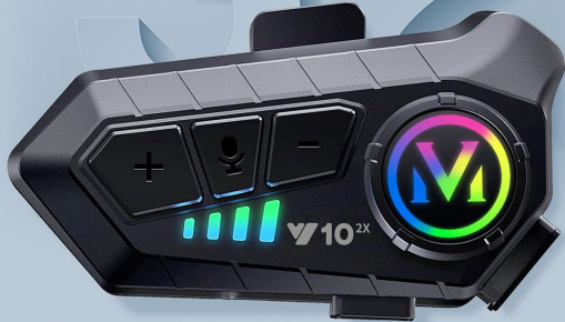
Figure 2.5: The headset boasts long-lasting battery life, offering over 32 hours of continuous play and 18 months of standby time.