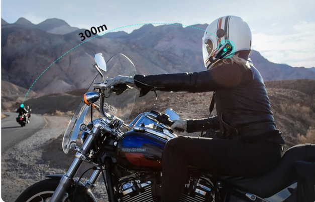
Figure 2.8: The headset supports dual 300m intercom, allowing easy communication and call answering while riding.

Dual 300m intercom, Easy to talk and answer phone calls, allowing you to travel smoothly without worry