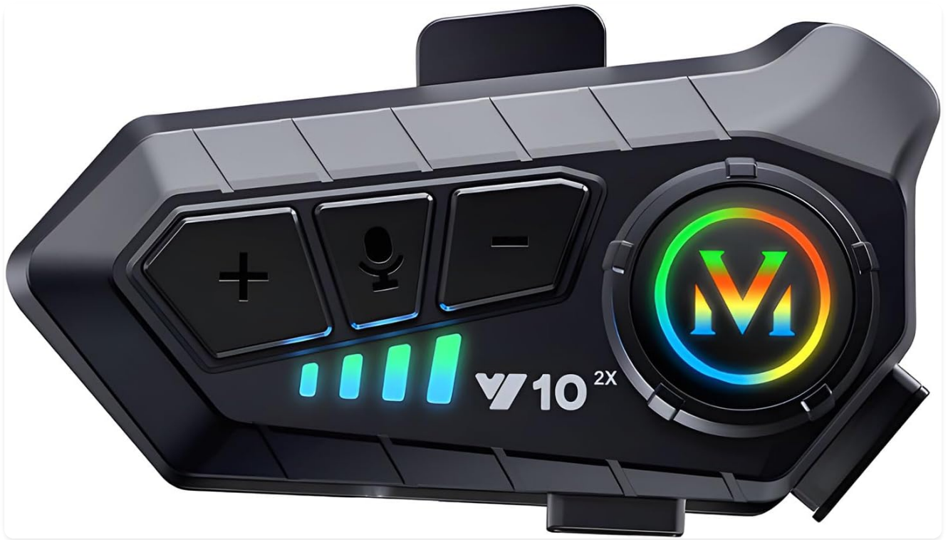
Figure 2.1: Main view of the Y10-2X Bluetooth Headset.