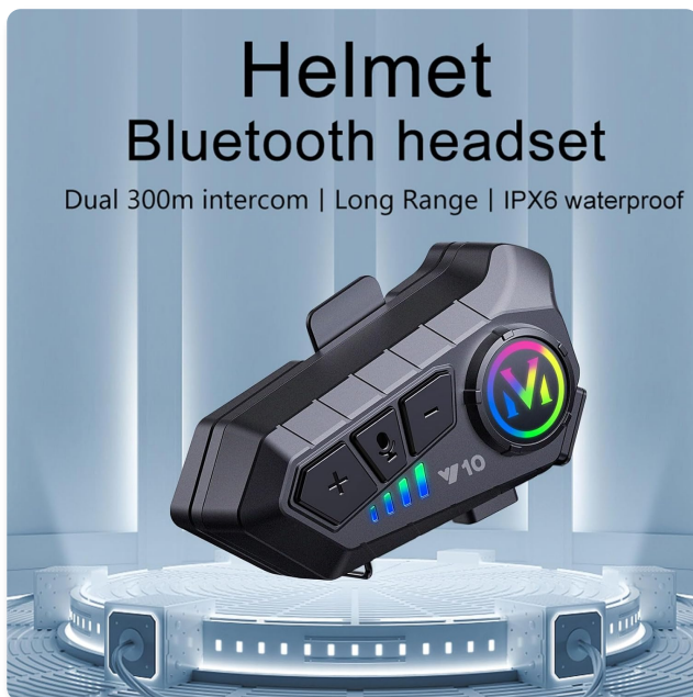
Figure 2.3: The Y10-2X headset highlighting its dual 300m intercom, long range, and IPX6 waterproof features.