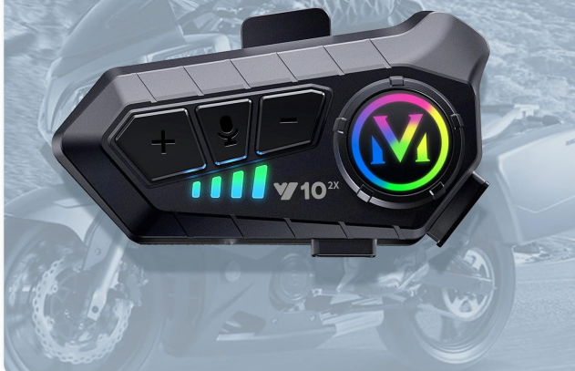
Figure 2.7: Enjoy high-fidelity sound quality and intelligent noise reduction for clear audio.