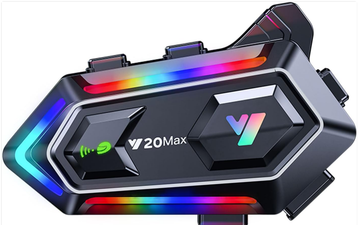
Image: The Y20MAX Motorcycle Helmet Bluetooth Headset, featuring a sleek black design with vibrant RGB lighting along its edges and