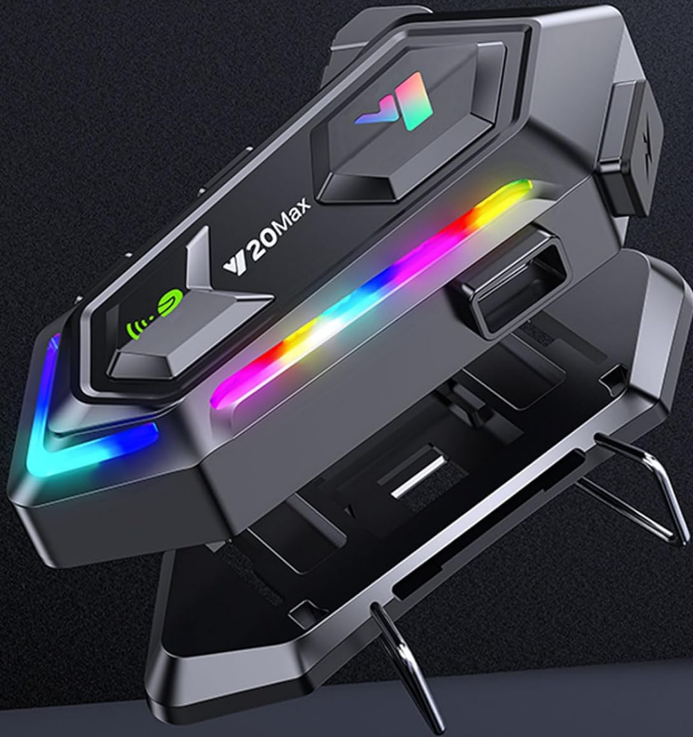
Image: The Y20MAX headset separated from its mounting clip, demonstrating its split installation design for easy attachment to various helmet types.