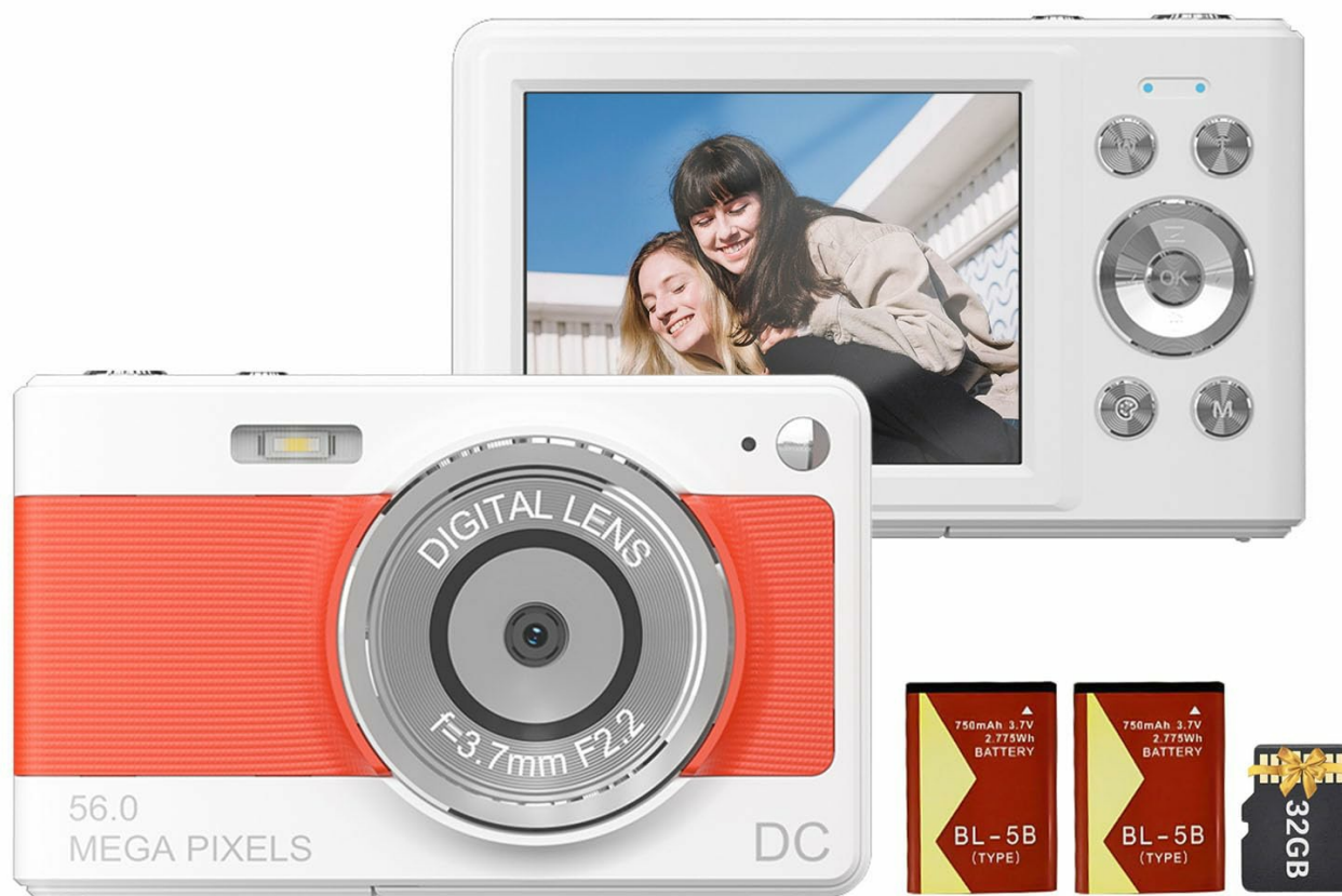
Front view of the Andoer 1080P Digital Camera, showcasing its lens and compact design.